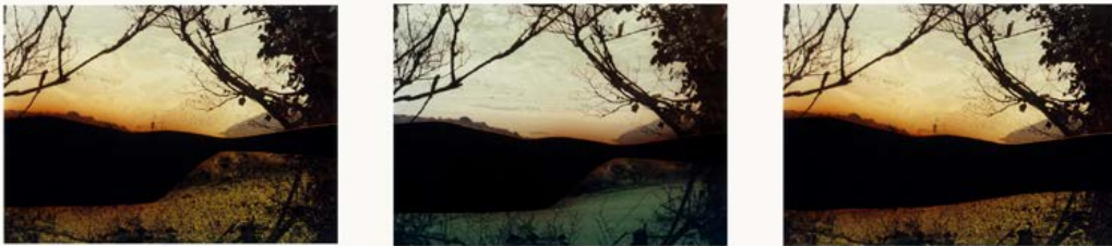
Dafna Talmor Untitled (0405) [Studies 1-3], 2012 C-type handprints Paper size: 12 × 10 inch (30.5 × 25.4 cm) Each print unique £1,950 (set of 3 studies, unframed)

Please note these are one-off studies so may have marks and imperfections All prices exclude VAT