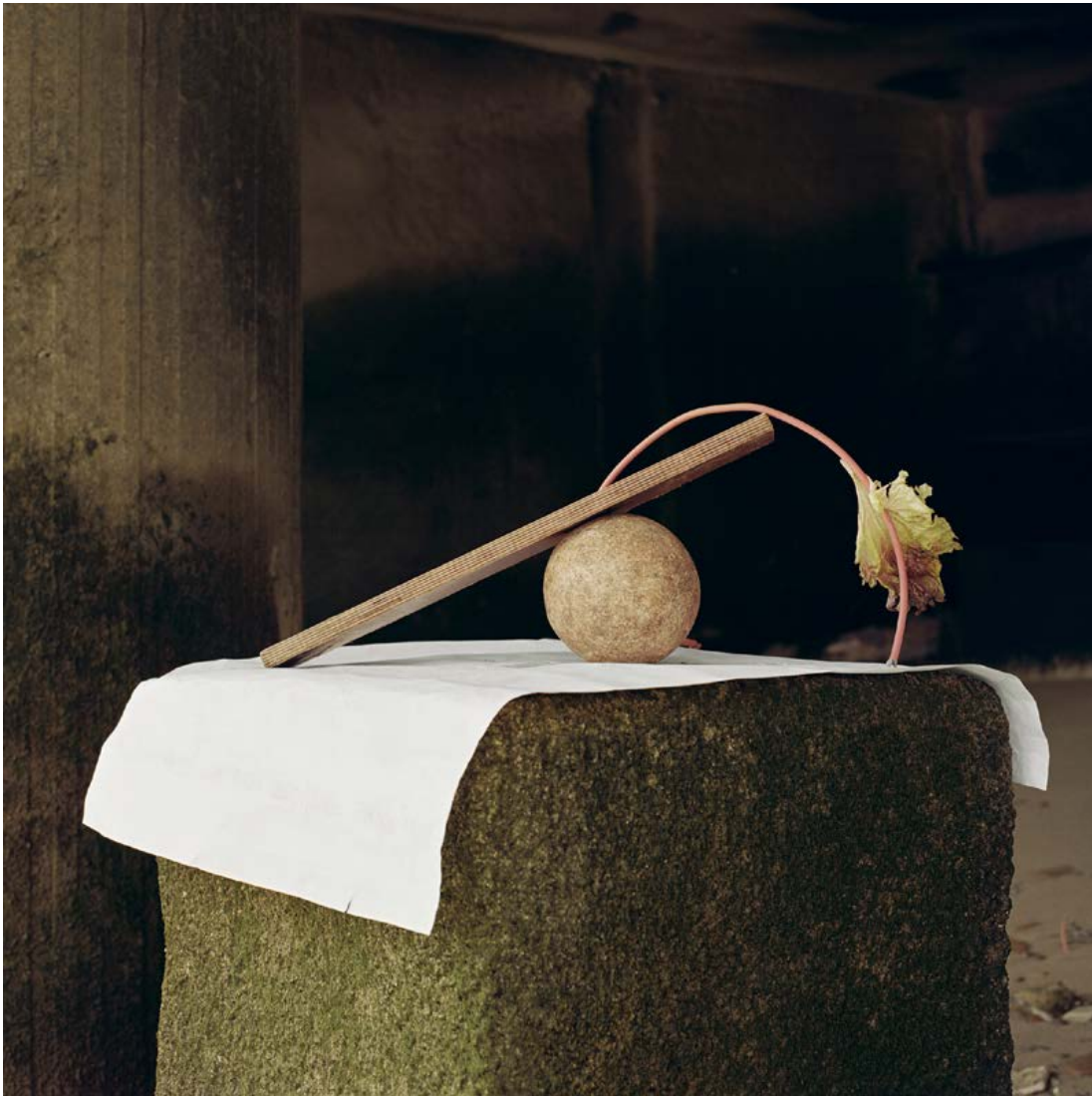
Angela Blažanović Red Wire, Ball and a Salad Leaf , 2019 C-type print 30 × 30 inch (76.2 × 76.2 cm) Edition of 2 + 1 AP Edition 2 of 2: £1,100 (unframed, print only)