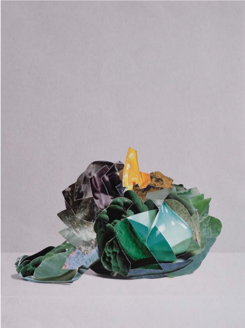
Abigail Hunt We prepared ourselves well for different times, 2020 Unique hand cut collage of photographic papers 28 x 21 cm £1,000 unframed