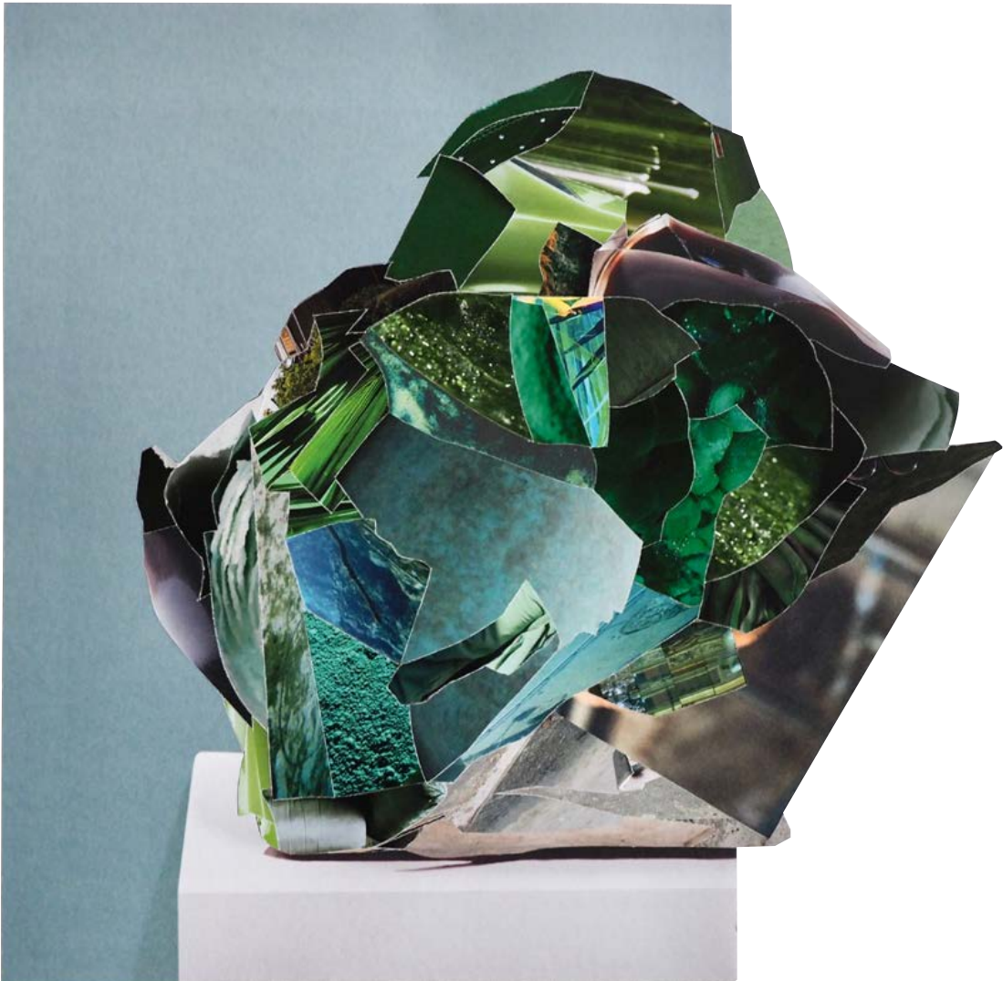
Abigail Hunt Between twenty and one hundred pieces, 2020 Unique hand cut collage of photographic papers 28 × 26.5 cm £1,250 unframed