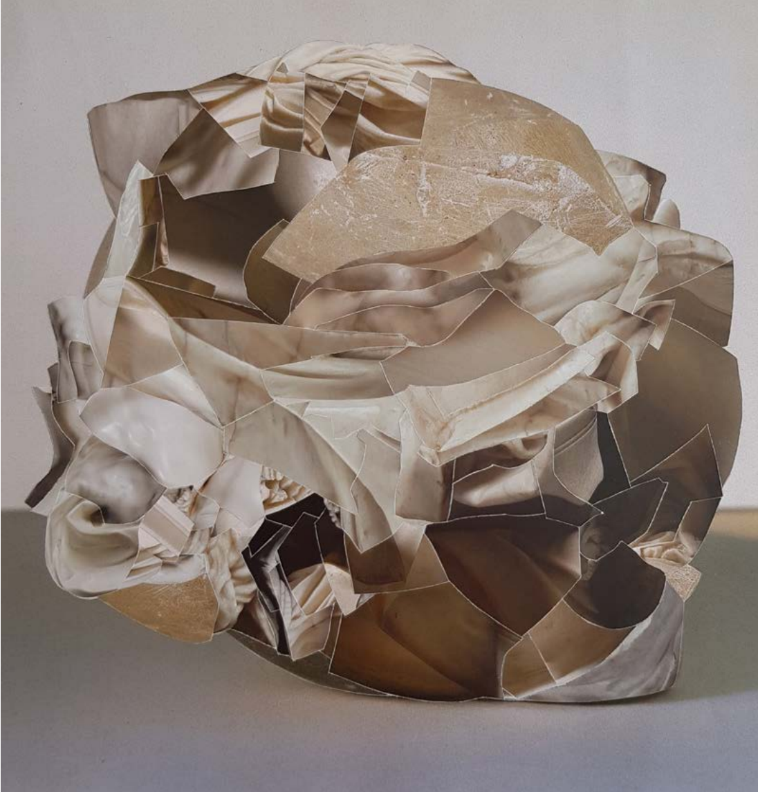
Abigail Hunt Invaluable treasures , 2020 Unique hand cut collage of photographic papers 31 x 30 cm £1,300 unframed