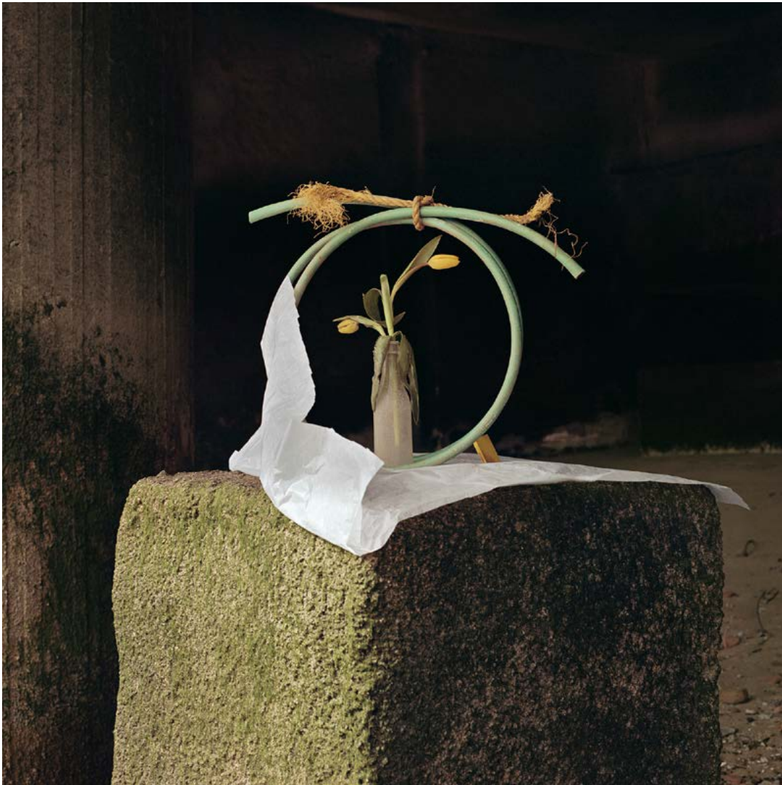
Angela Blažanović Turquoise Pipe, Yellow Rope, Glass Bottle, Yellow Tulips and a Little Yellow Square II , 2019 C-type print 30 × 30 inch (76.2 × 76.2 cm) Edition of 2 + 1 AP Edition 1 of 2: £950 (unframed, print only) Edition 2 of 2: £1,100 (unframed, print only)