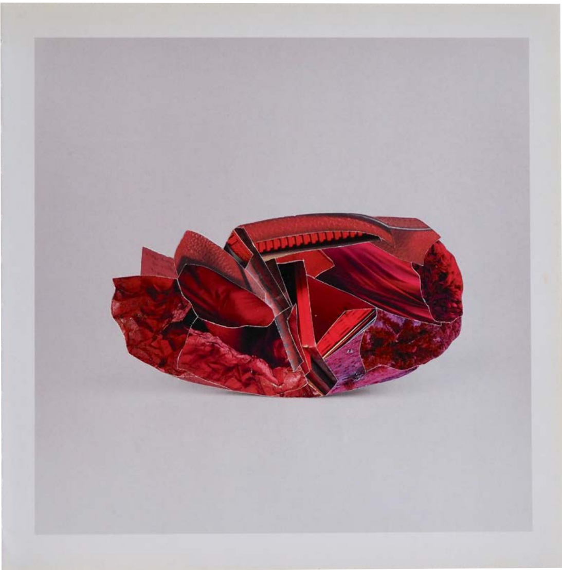
Abigail Hunt Perception of reality , 2020 Unique hand cut collage of photographic papers 24.5 × 24.5 cm £950 unframed