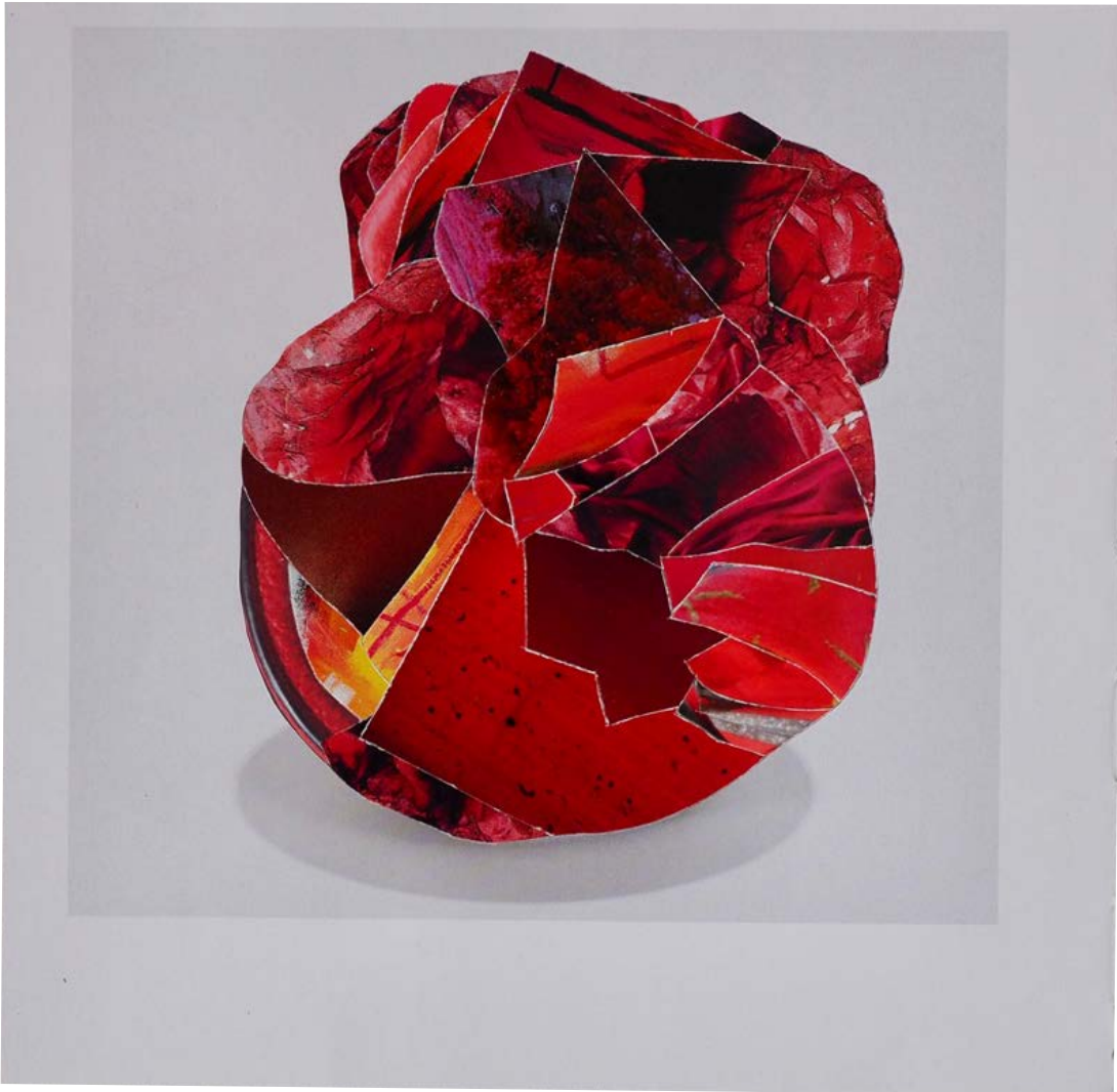
Abigail Hunt I like to hold it within my hand, feeling how my fingers, wrap around its form, 2020 Unique hand cut collage of photographic papers 16 x 16.5 cm £800 unframed