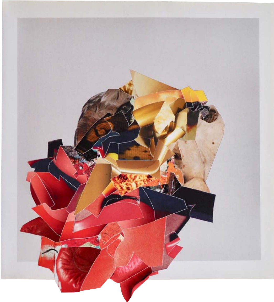
Abigail Hunt My image is not my own , 2020 Unique hand cut collage of photographic papers 27 × 24.5 cm £1,000 unframed