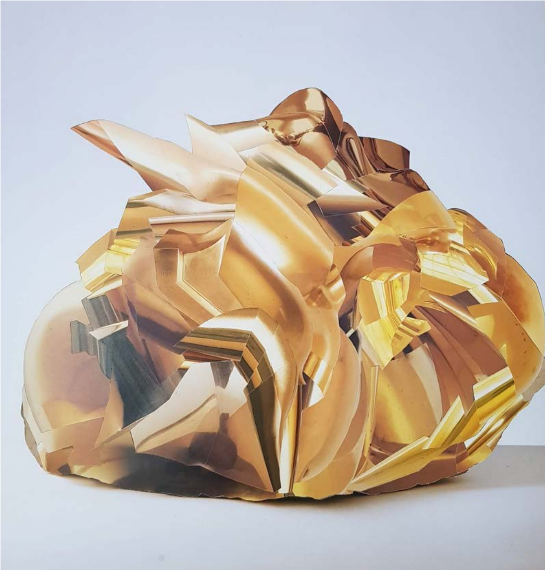
Abigail Hunt I know you've heard that story told , 2020 Unique hand cut collage of photographic papers 31 x 30 cm £1,300 unframed