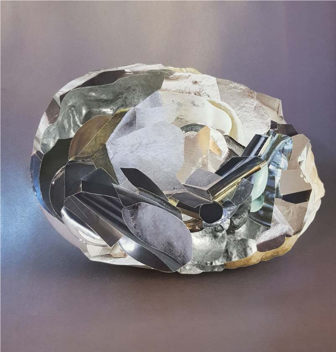
Abigail Hunt Coupled substitution , 2020 Unique hand cut collage of photographic papers 31 x 30 cm £1,300 unframed