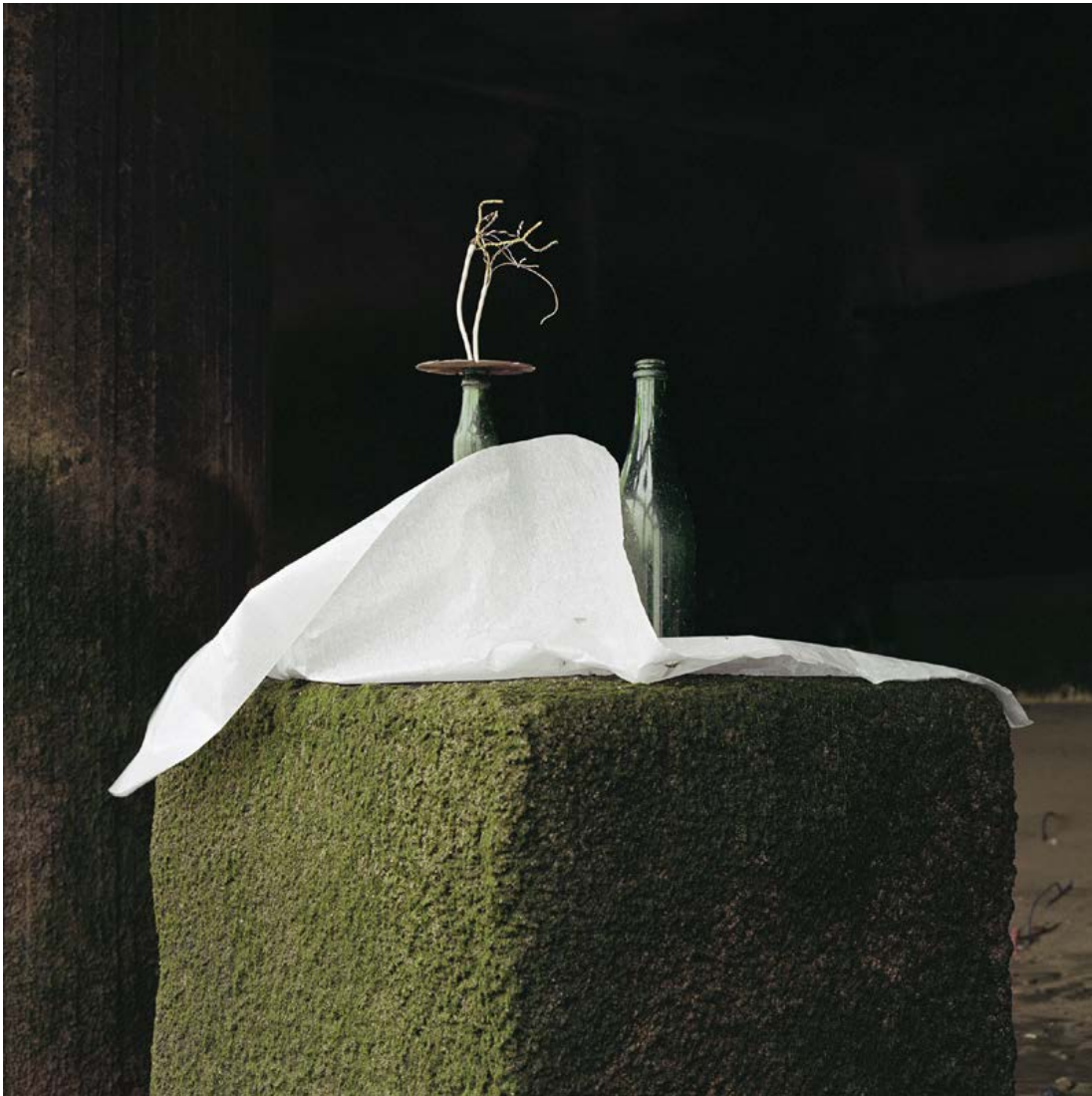
Angela Blažanović Two Glass Bottles, Pint Glass, Round Metal Plate, some Wire and a White Tile II , 2019 C-type print 30 × 30 inch (76.2 × 76.2 cm) Edition of 2 + 1 AP Edition 1 of 2: £950 (unframed, print only) Edition 2 of 2: £1,100 (unframed, print only)