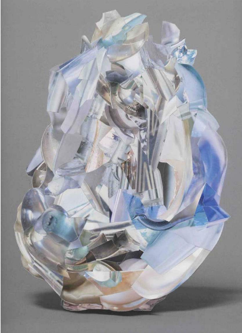
Abigail Hunt Probabilities for different outcomes, 2020 Unique hand cut collage of photographic papers 30 × 24 cm £1,200 unframed