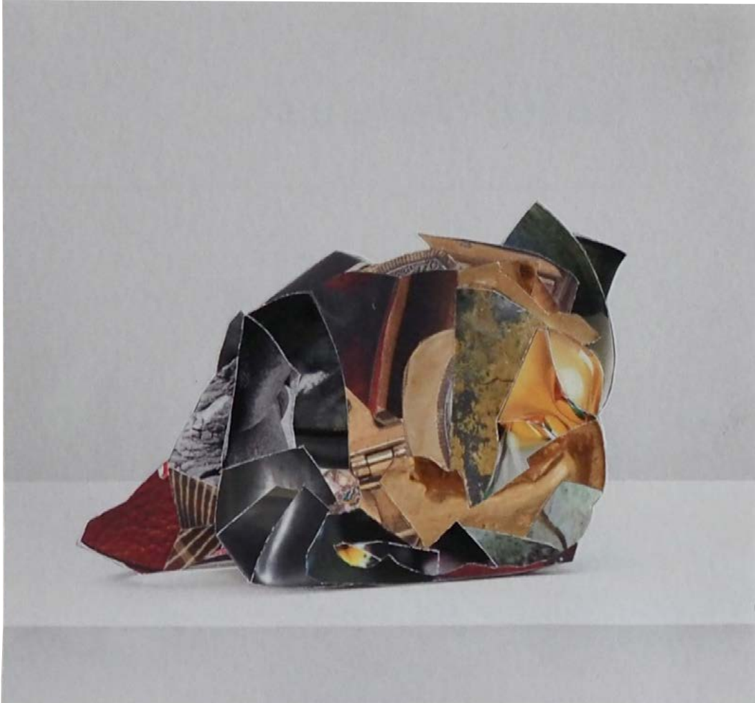
Abigail Hunt Solid values , 2020 Unique hand cut collage of photographic papers 12.5 × 13.5 cm £750 unframed