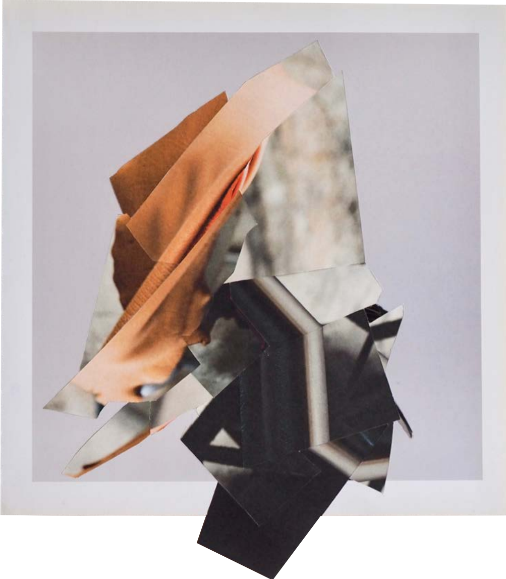
Abigail Hunt Construction could be different, 2020 Unique hand cut collage of photographic papers 28 x 24.5 cm £1,000 unframed