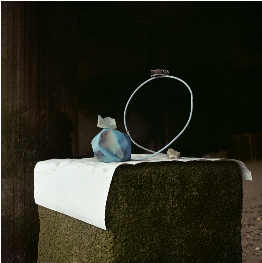
Angela Blažanović Blue Football, Blue Wire with Stone, Piece of Glass and a Hairbrush , 2019 C-type print 30 × 30 inch (76.2 × 76.2 cm) Edition of 2 + 1 AP Edition 2 of 2: £1,350 (mounted on aluminum with hanging battens on reverse)