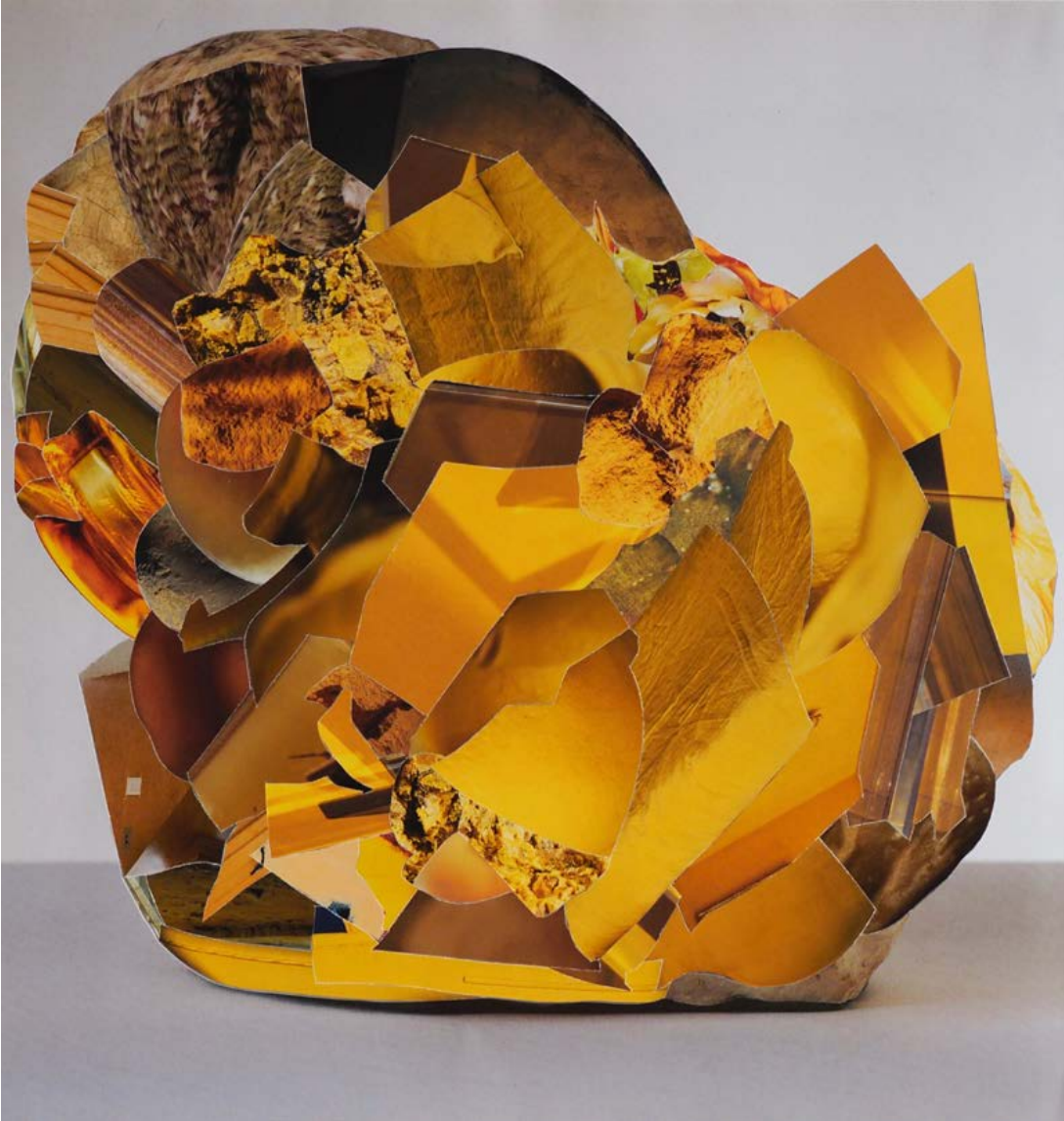
Abigail Hunt Soon a story will emerge , 2020 Unique hand cut collage of photographic papers 31 x 30 cm £1,300 unframed