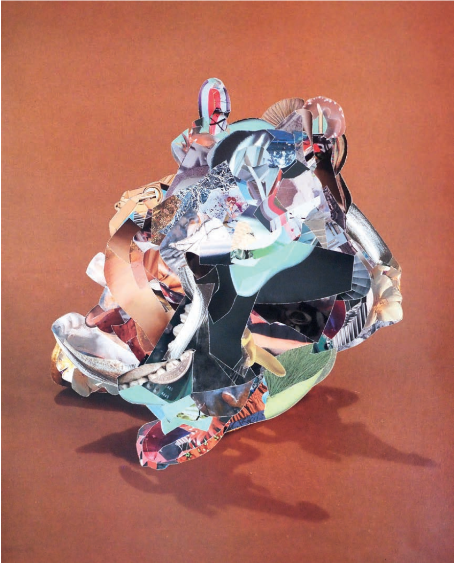
Abigail Hunt When I picked it up it was heavier than I expected, 2020 Unique hand cut collage of photographic papers 40.5 x 25 cm £1,450