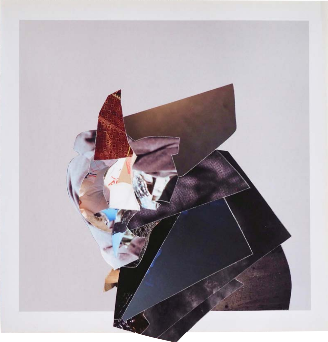
Abigail Hunt Why didn't you say that before? , 2020 Unique hand cut collage of photographic papers 25.5 × 24.5 cm £1,000 unframed