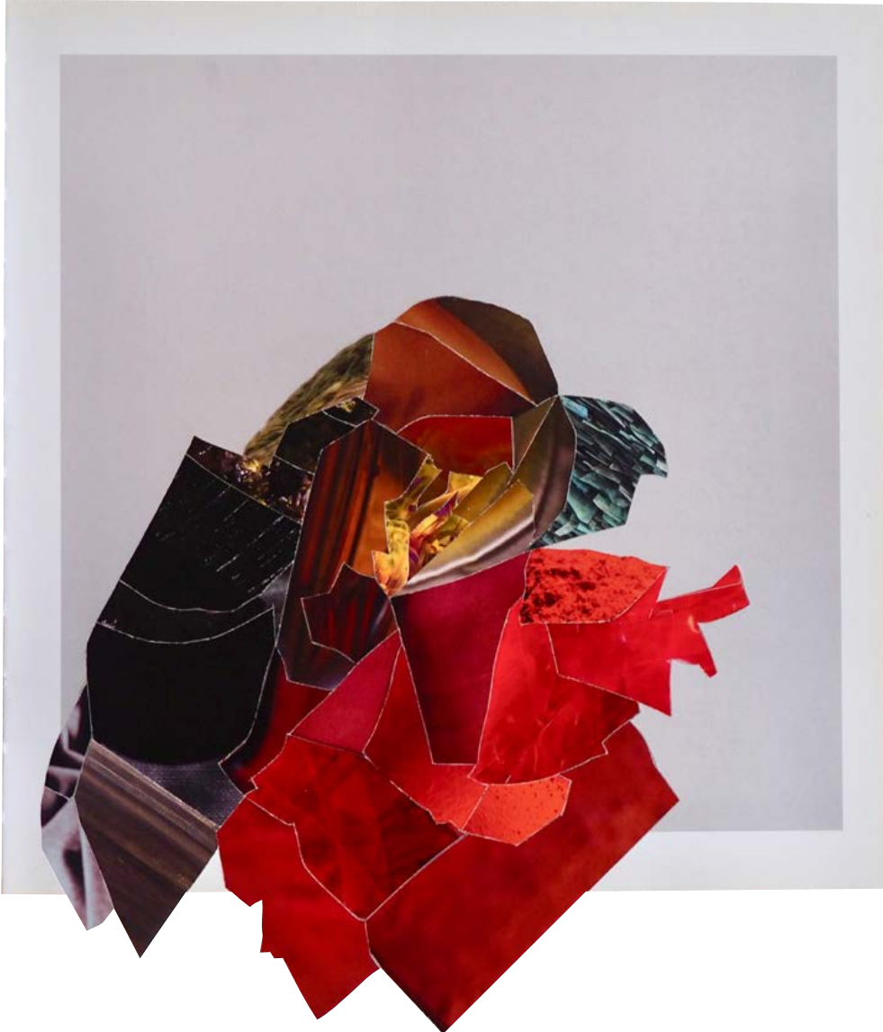
Abigail Hunt The rules are confusing , 2020 Unique hand cut collage of photographic papers 28.5 × 24.5 cm £1,000 unframed