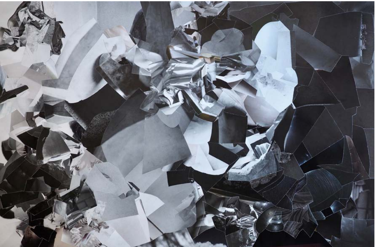
Abigail Hunt Our knowledge of things is unique , 2020 Unique hand cut collage of photographic papers 56 × 86 cm £2,000 unframed