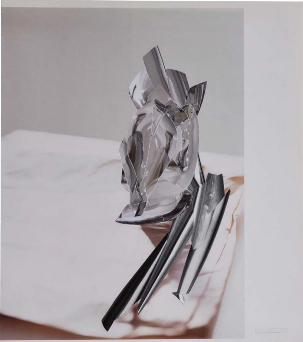
Abigail Hunt I believe that if you dropped it, it would shatter, 2020 Unique hand cut collage of photographic papers 25.5 × 23 cm £950 unframed