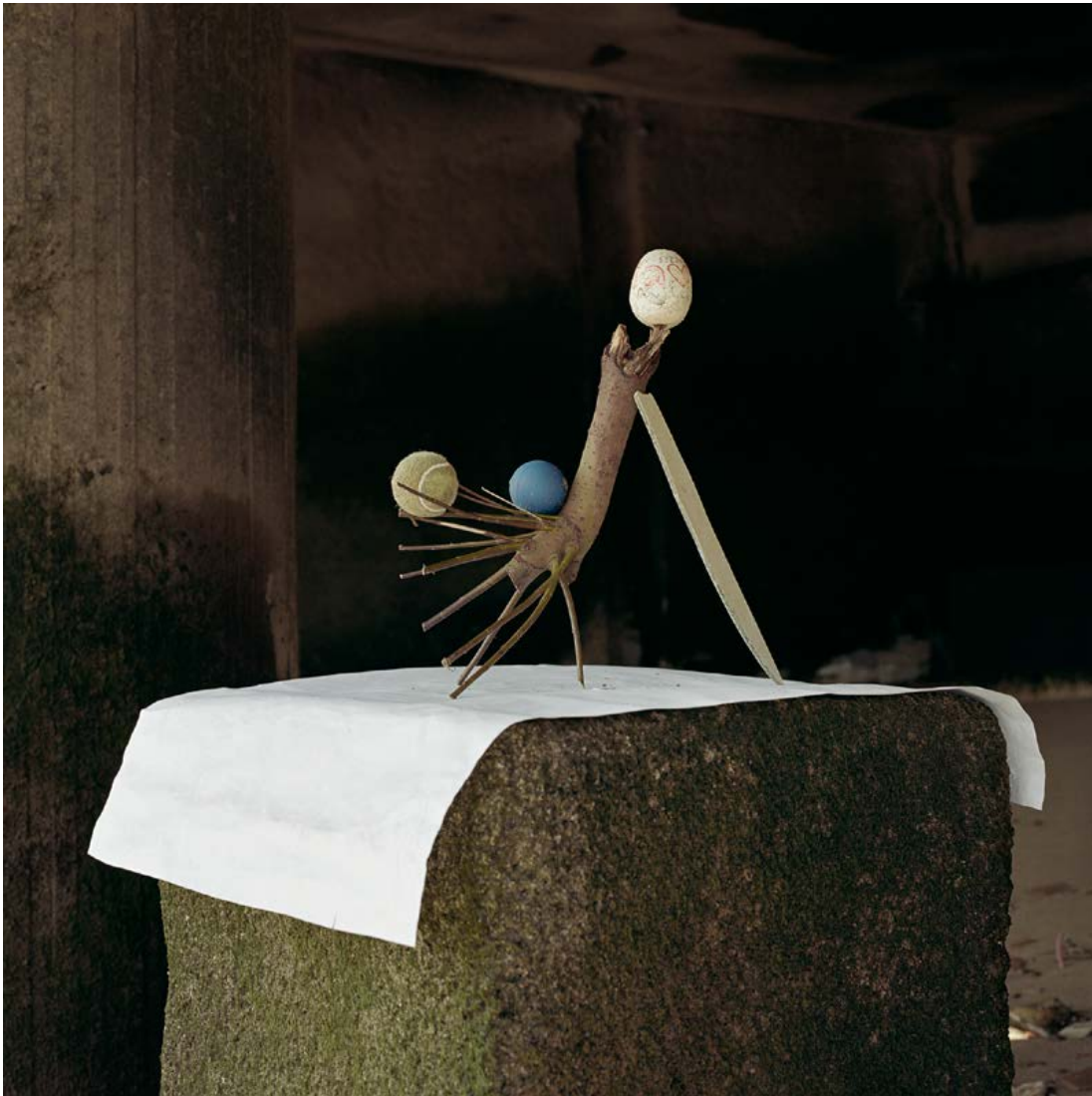
Angela Blažanović Branch, Piece of Plastic, Blue Plastic Ball, Tennis Ball and a Painted Styrofoam Egg , 2019 C-type print 30 × 30 inch (76.2 × 76.2 cm) Edition of 2 + 1 AP Edition 1 of 2: £950 (unframed, print only) Edition 2 of 2: £1,100 (unframed, print only)