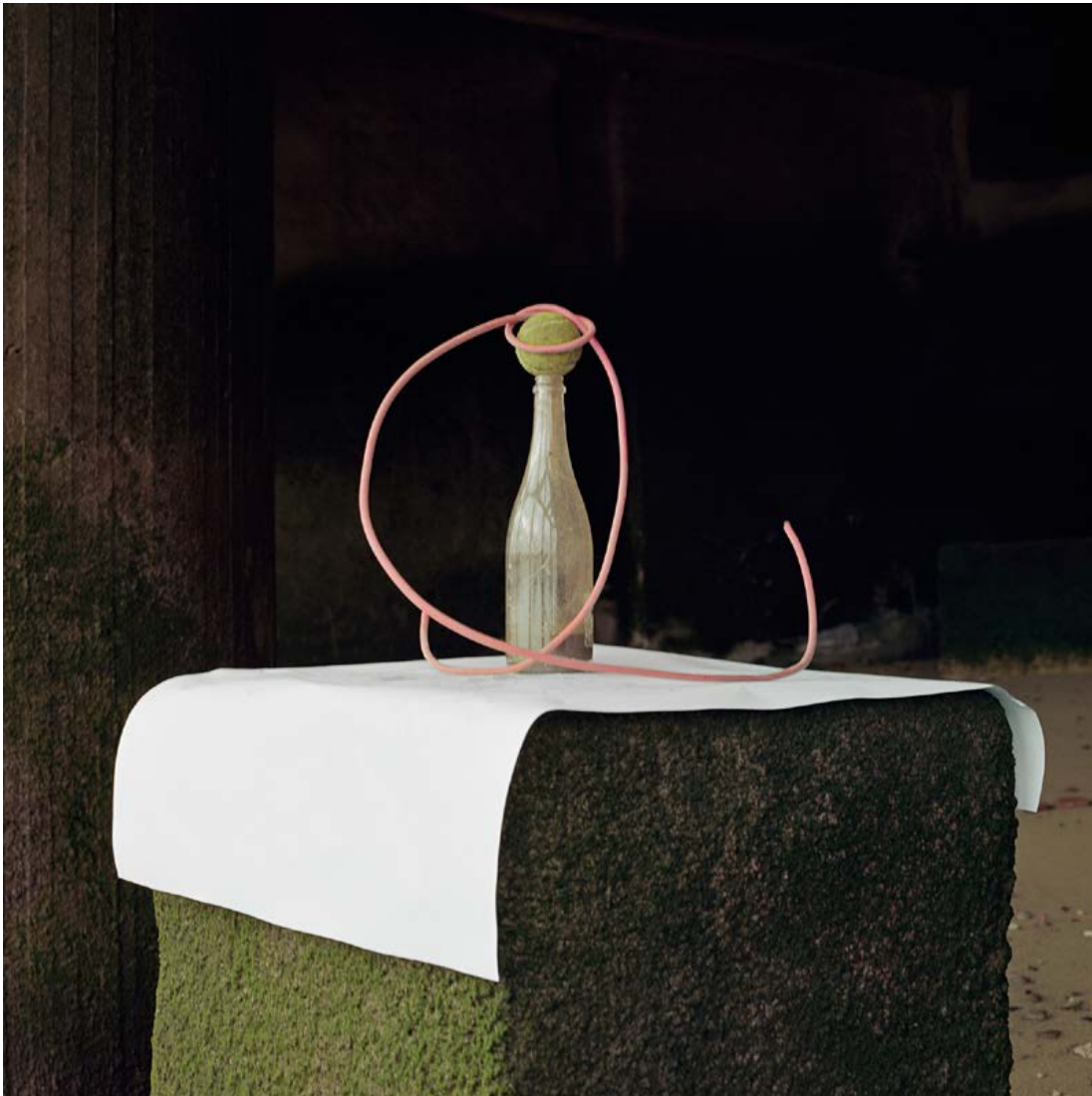
Angela Blažanović Red Wire, Glass Bottle and a Tennis Ball , 2019 C-type print 30 × 30 inch (76.2 × 76.2 cm) Edition of 2 + 1 AP Edition 2 of 2: £1,100 (unframed, print only)