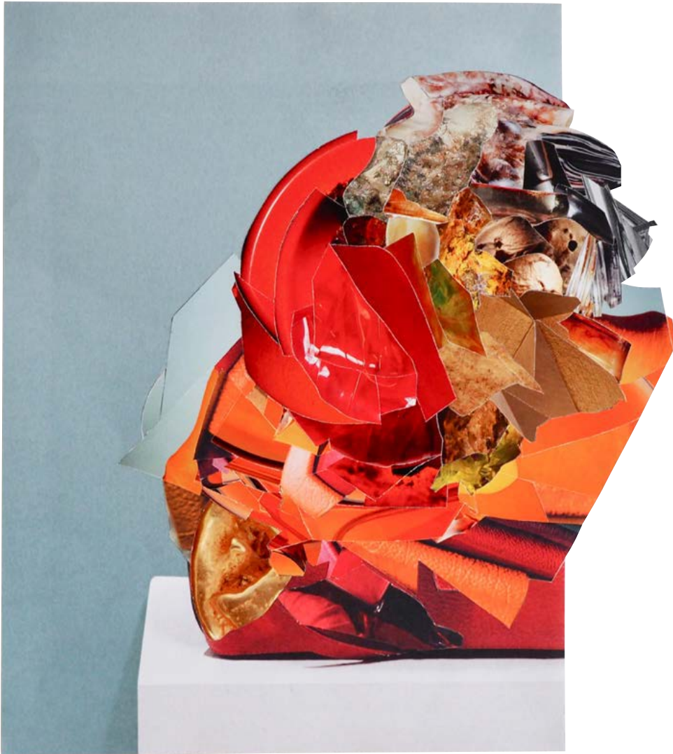
Abigail Hunt A more stable form , 2020 Unique hand cut collage of photographic papers 28 x 25 cm £1,250 unframed