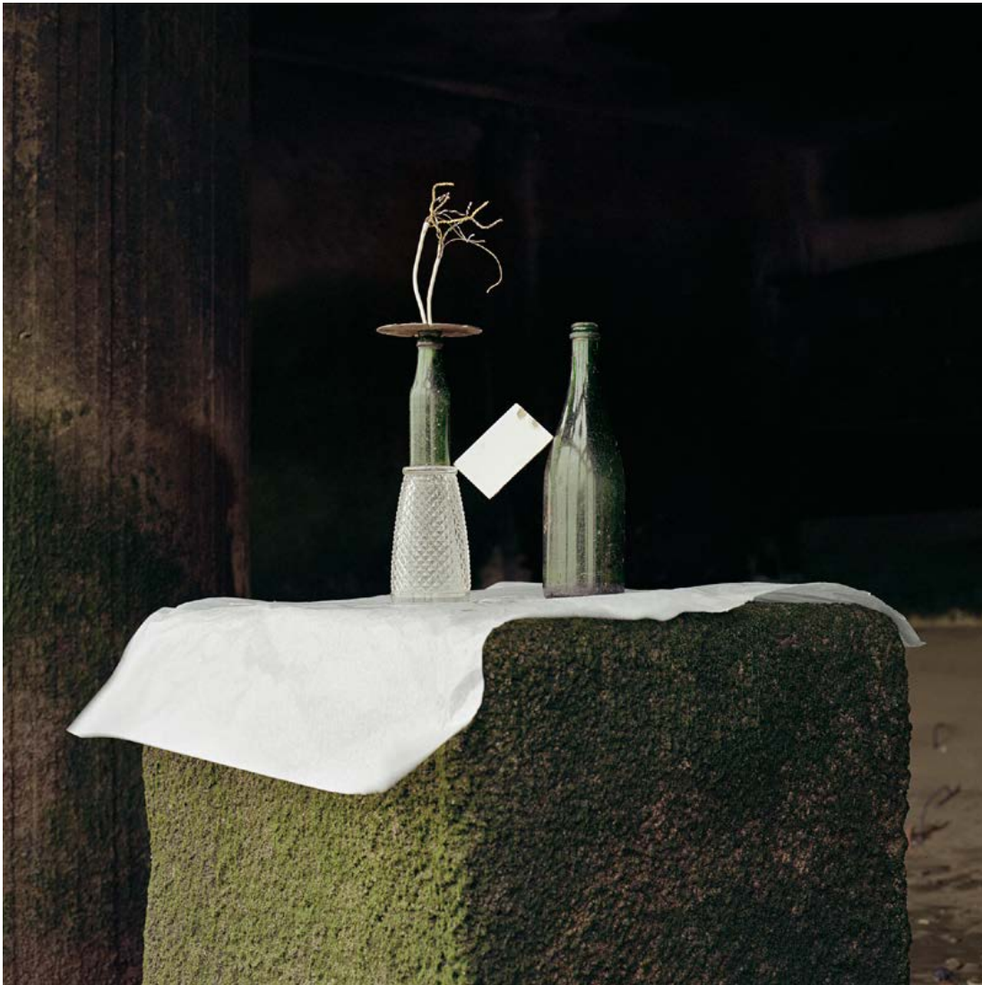
Angela Blažanović Two Glass Bottles, Pint Glass, Round Metal Plate, some Wire and a White Tile I, 2019 C-type print 30 × 30 inch (76.2 × 76.2 cm) Edition of 2 + 1 AP Edition 2 of 2: £1,100 (unframed, print only)