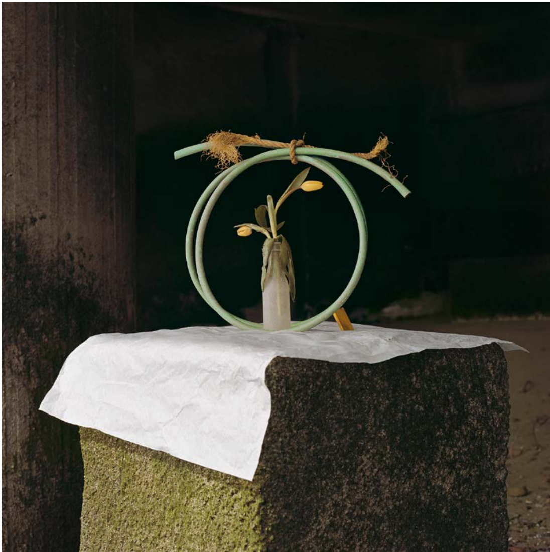
Angela Blažanović Turquoise Pipe, Yellow Rope, Glass Bottle, Yellow Tulips and a Little Yellow Square I , 2019 C-type print 30 × 30 inch (76.2 × 76.2 cm) Edition of 2 + 1 AP Edition 1 of 2: £950 (unframed, print only) Edition 2 of 2: £1,100 (unframed, print only)