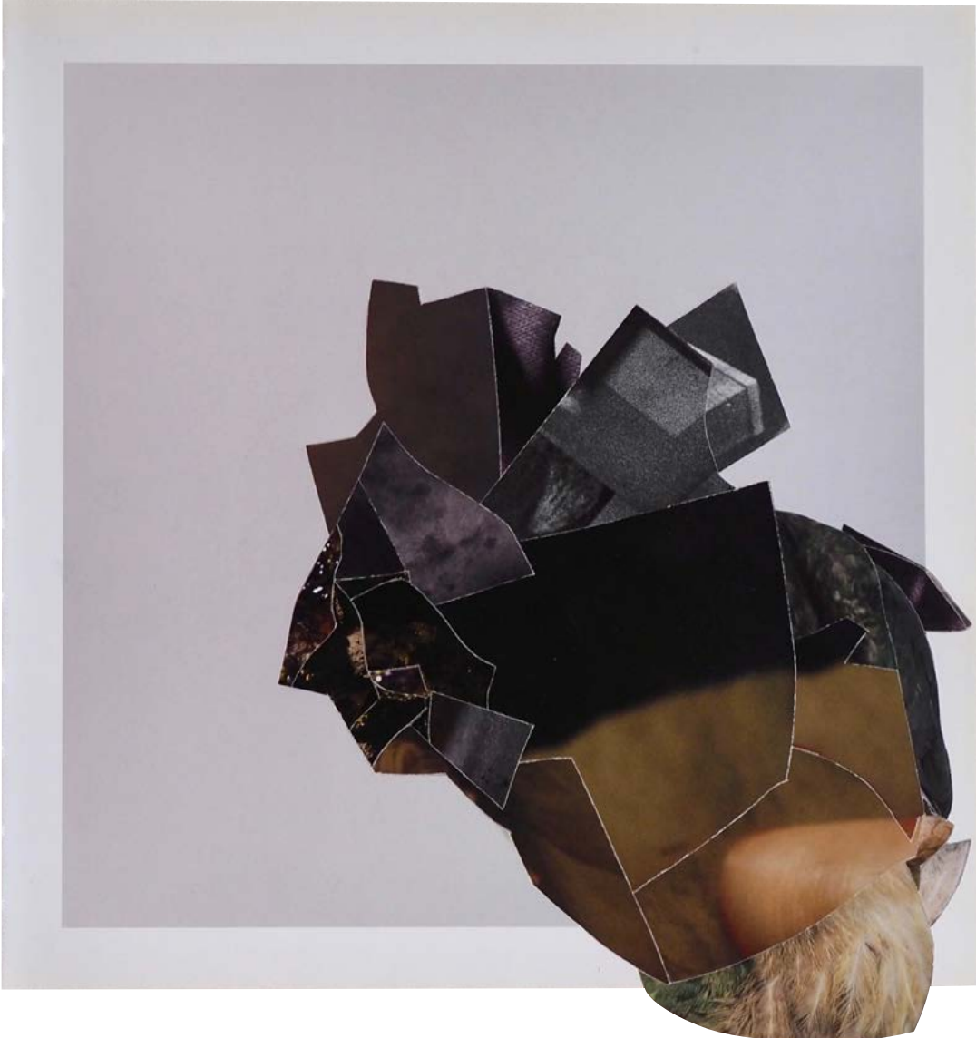
Abigail Hunt The exploration of my experience, 2020 Unique hand cut collage of photographic papers 26 × 24.5 cm £1,000 unframed