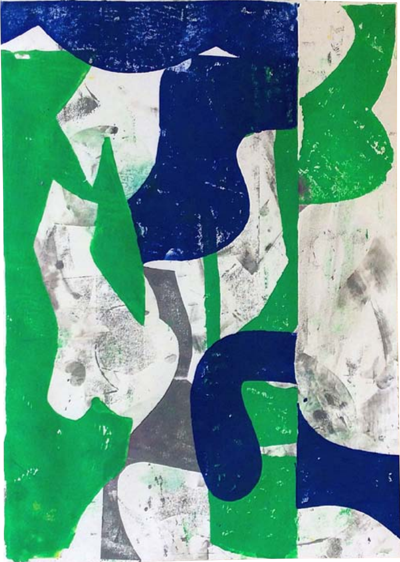
Vincent Hawkins Corner , 2016 Water based woodblock ink on paper 42 x 29 cm