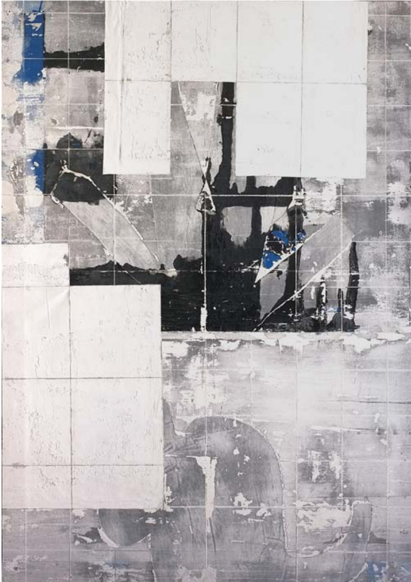
Antoine Puisais Untitled (Faits marquants) , 2016 Mixed media on linen, acrylic, filler, ink, spray paint, epoxy resin 162 × 114 cm