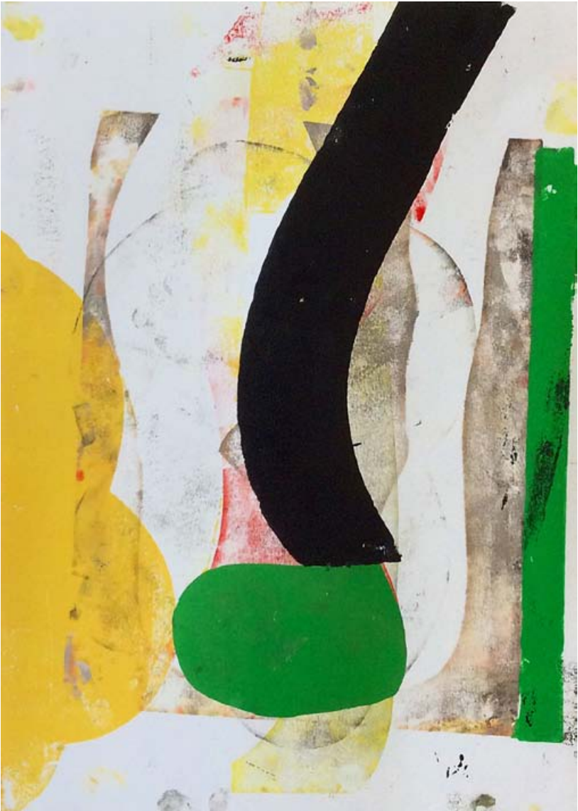
Vincent Hawkins Untitled , 2016 Water based woodblock ink on paper 42 x 29 cm