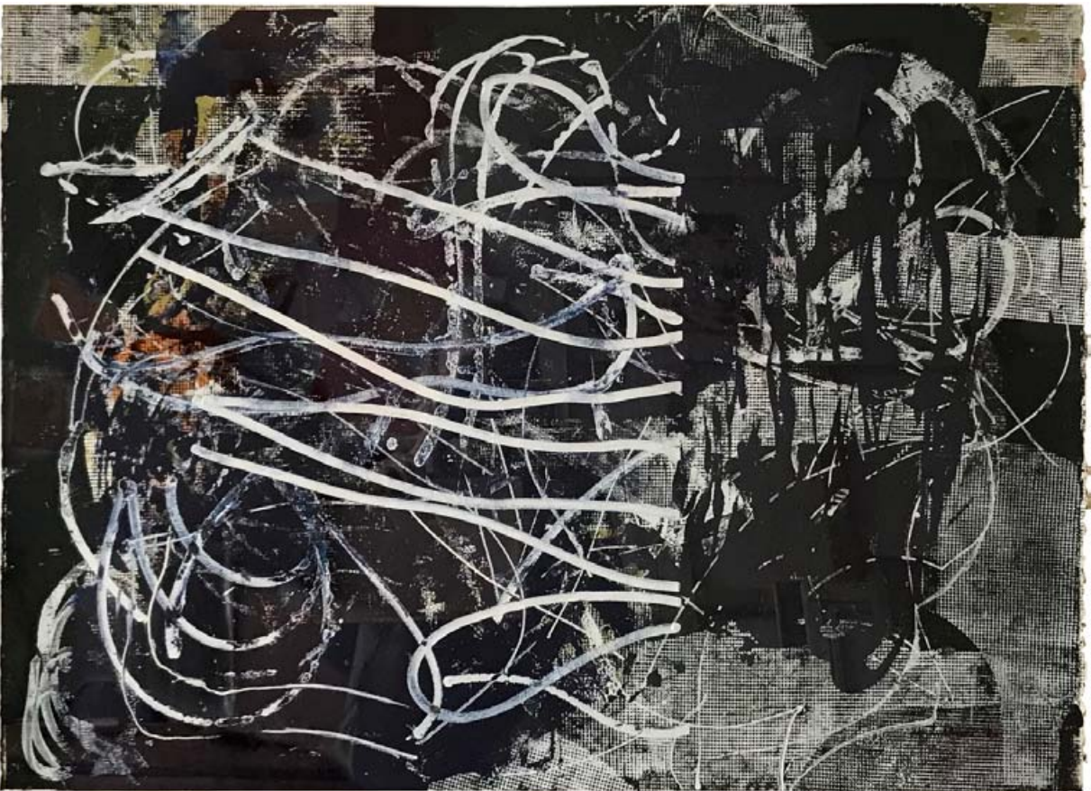
Vincent Hawkins Map Of The Ancient World , 2017 Water based woodblock ink and gouache on paper, framed 55 × 75 cm