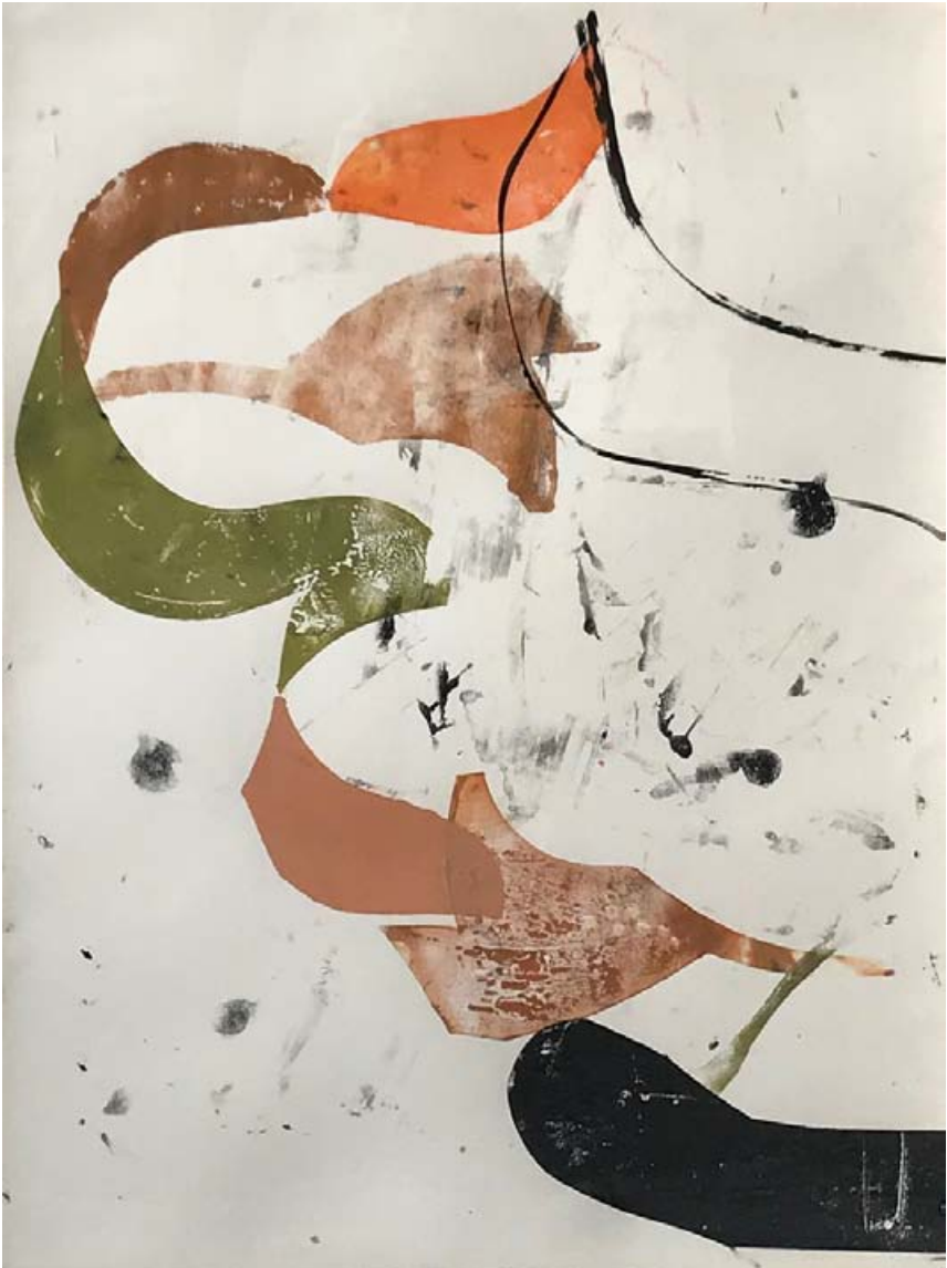
Vincent Hawkins The Periphery , 2016 Water based woodblock ink on paper, framed 75 x 55 cm