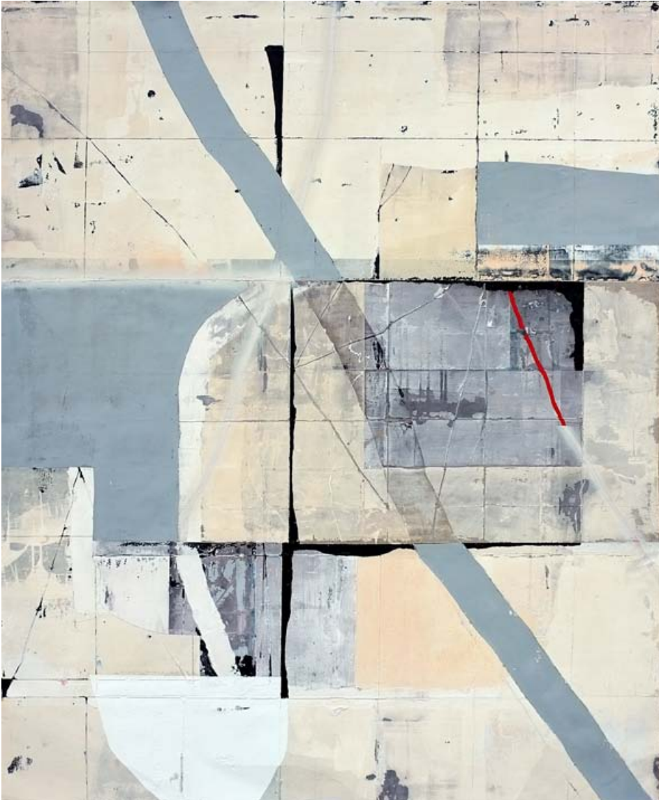
Antoine Puisais Green soba and a chair for my daughter , 2017 Mixed media on linen, acrylic, spray paint, filler and glue 162 × 130 cm