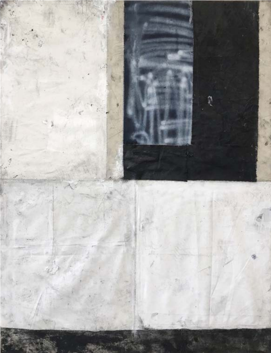
Joseph Grahame Awake , 2017 Oil, gesso, dirt, acrylic, charcoal, canvas, pine frame 130 x 100 cm