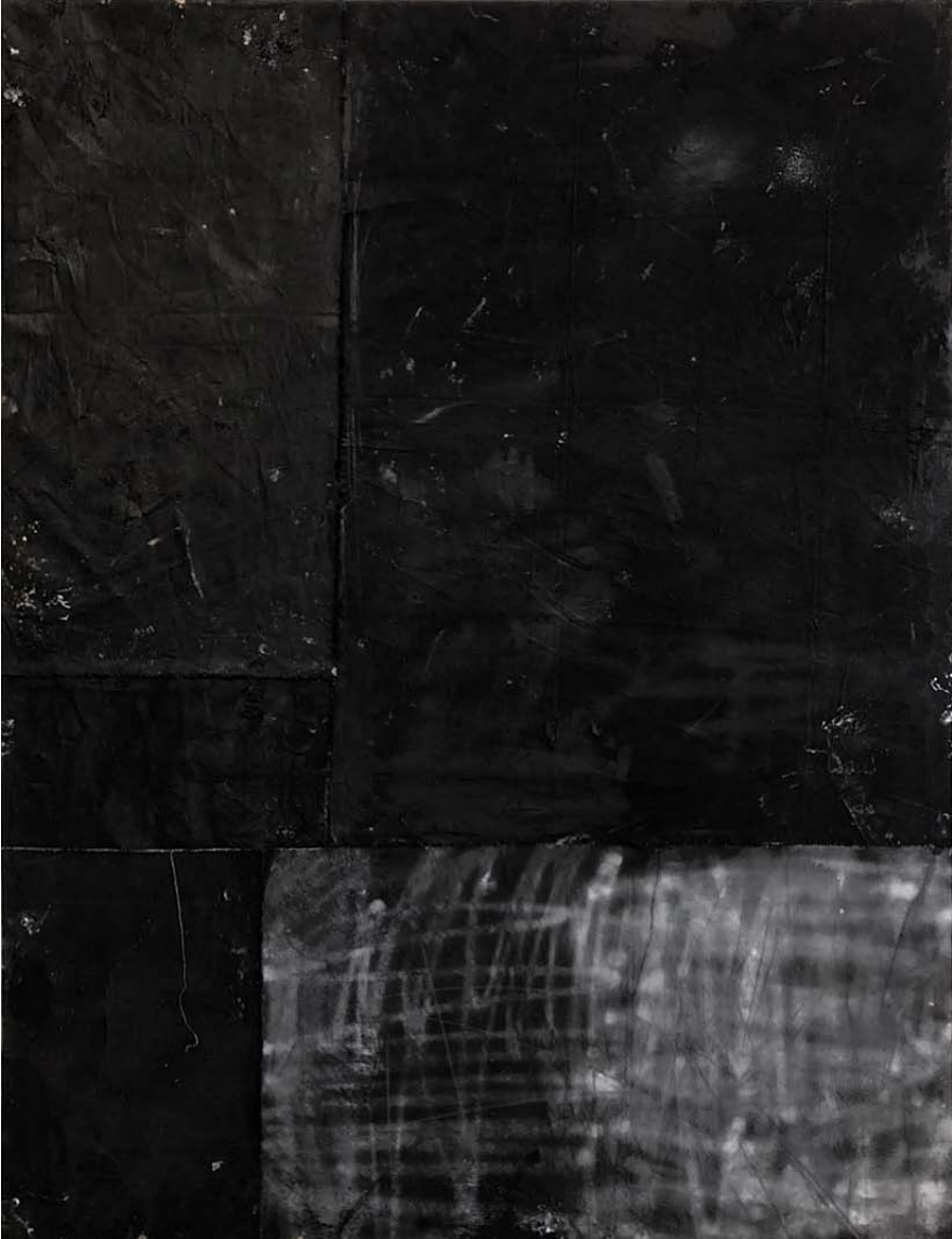
Joseph Grahame Half , 2017 Oil, graphite, oil stick, dirt, acrylic, canvas, pine frame 130 × 100 cm