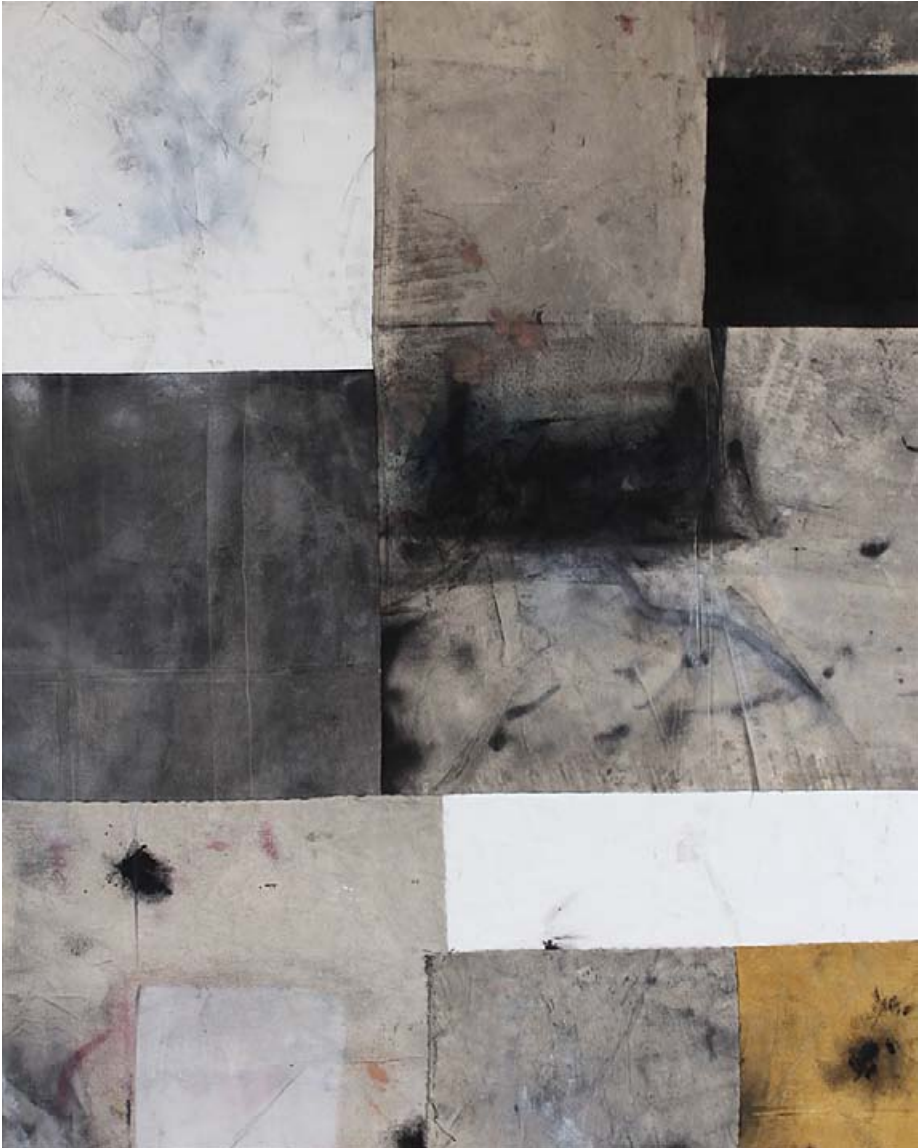
Joseph Grahame Permanent vacation , 2017 Oil, acrylic, charcoal, dirt, gesso, oil stick, sewn canvas, pine frame 125 × 100 cm