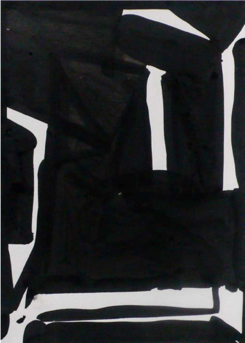
Vincent Hawkins Windows , 2015 Ink on paper, framed 35 × 24 cm