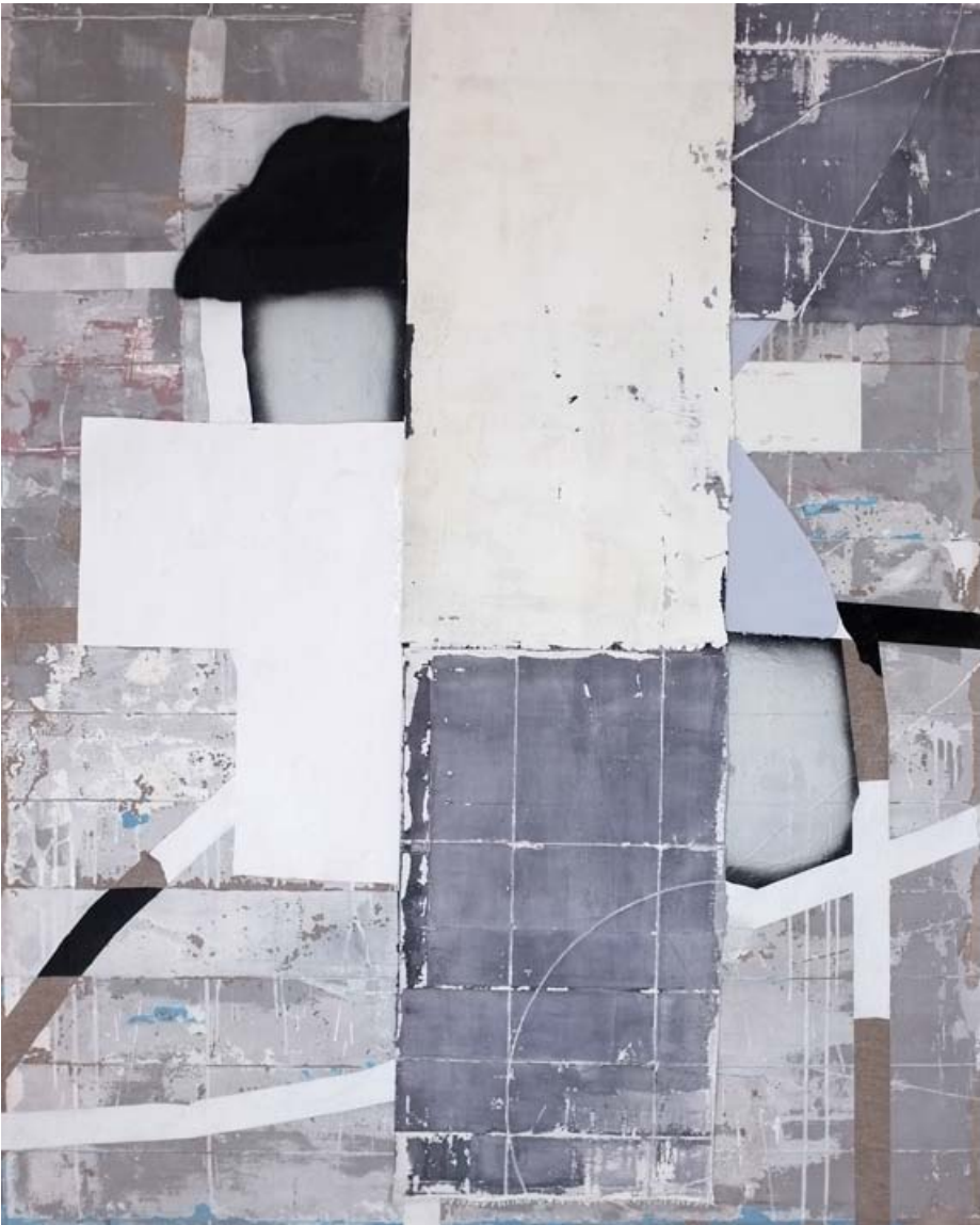
Antoine Puisais Untitled (unfolded grids) , 2017 Mixed media on linen, acrylic, spray paint, filler and glue 162 × 130 cm