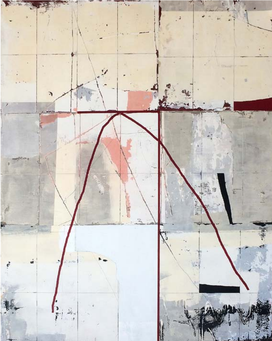
Antoine Puisais Untitled , 2017 Mixed media on linen, acrylic, spray paint, filler and glue 162 × 130 cm