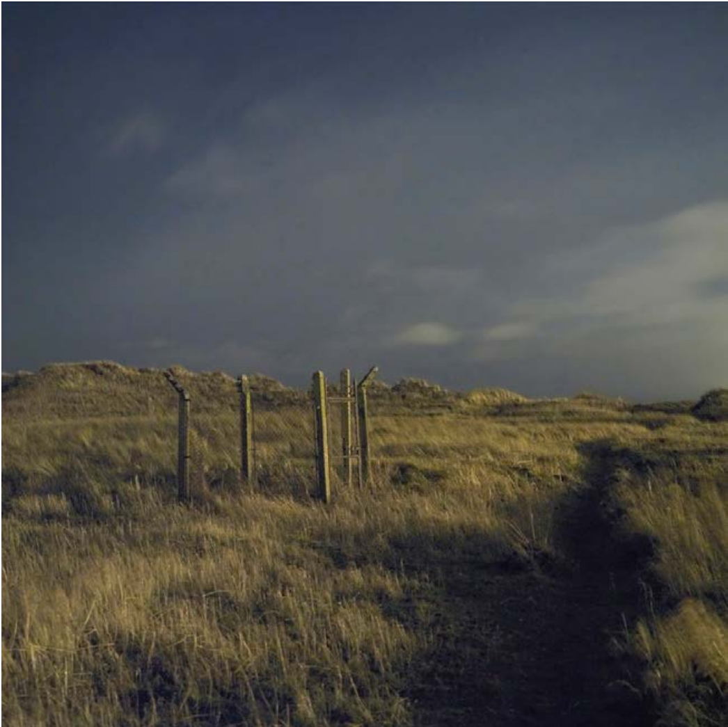
Enclosures Badlands and Borders 1 , 2009

Giclee digital archival print, mounted on aluminium