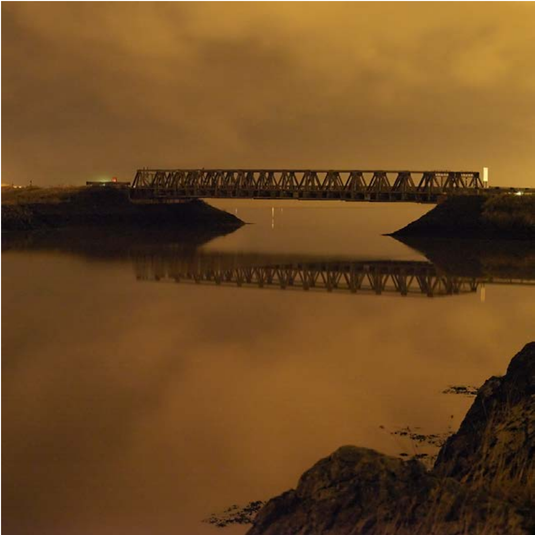
Backwater 3 , 2012 Giclee digital archival print, mounted on aluminium 20 × 20 in. Edition 1 of 5, 2 AP