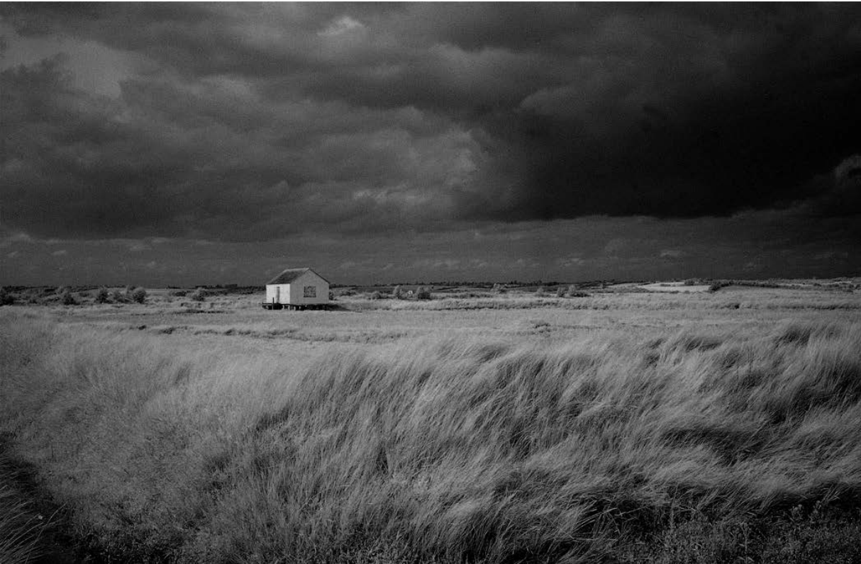
Faulness, 2014, Silver gelatin, hand print, archival print 8 × 5 ¼ in. Edition 2 of 5, 2 AP