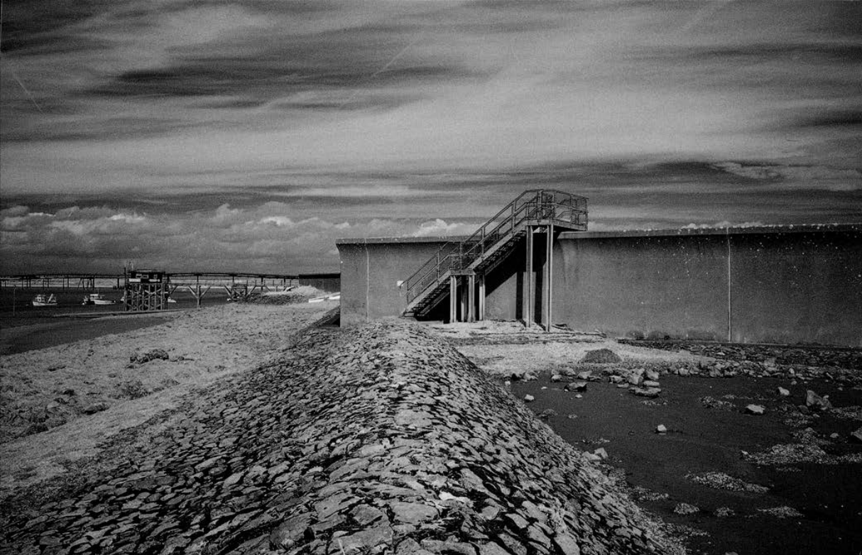
Canvey Island, 2014, Silver gelatin, hand print, archival print 8 × 5 ¼ in. Edition 1 of 5, 2 AP