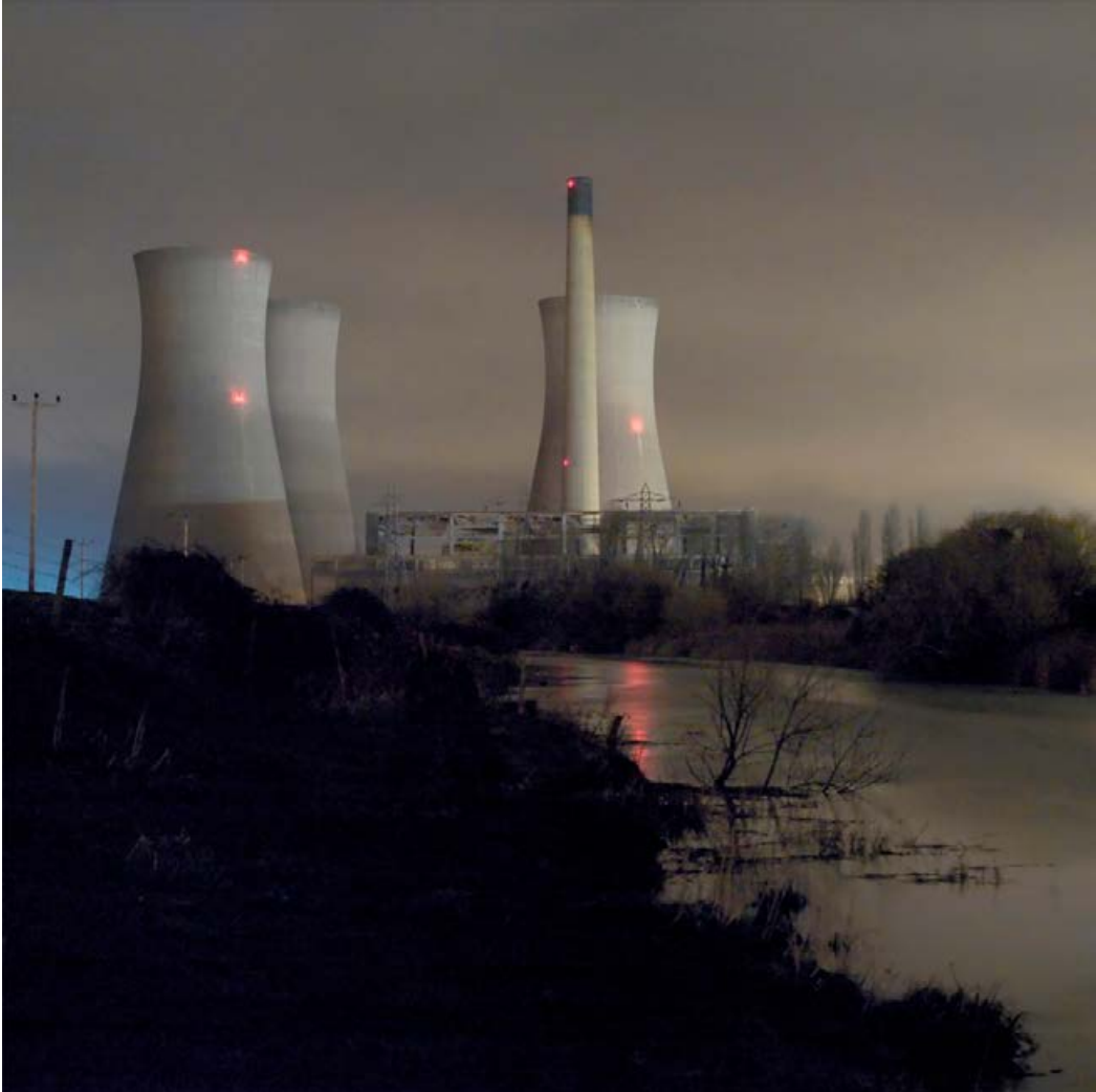
Enclosures Badlands and Borders 3 , 2009 Giclee digital archival print, mounted on aluminium 30 × 30 in. Edition 3 of 5, 2 AP