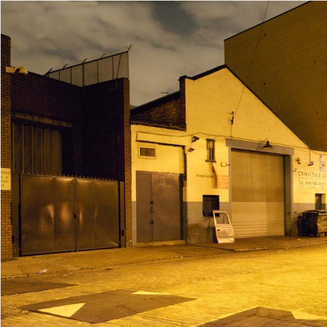
Hackney by Night 3, 2015

C-type print on metallic archival paper, backed on foam board and mounted in tray frame 10 × 10 in. Edition 1 of 5, 2 AP