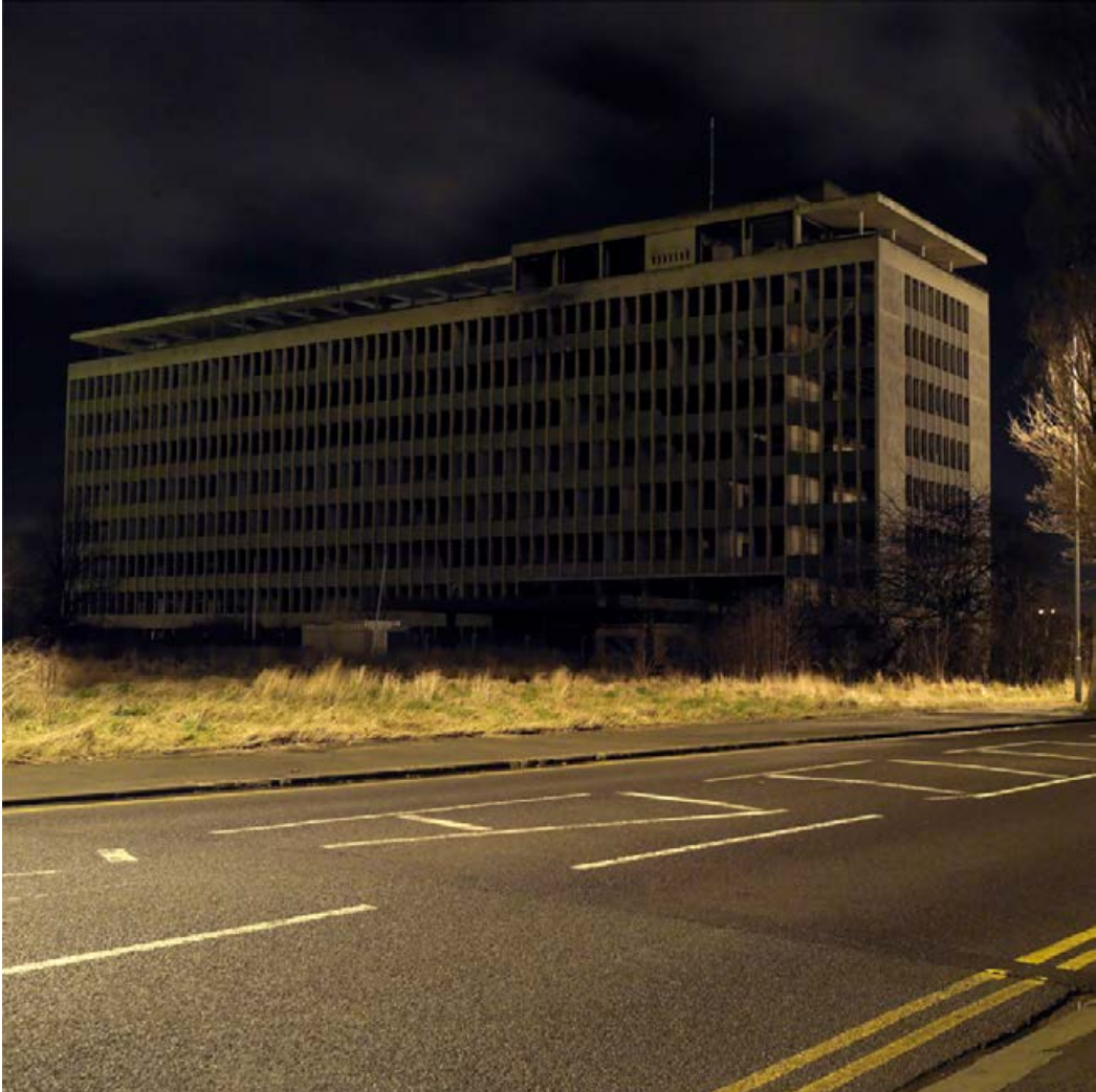
Enclosures Badlands and Borders 4 , 2009 Giclee digital archival print, printed as vinyl 30 × 30 in. Edition 1 of 5, 2 AP