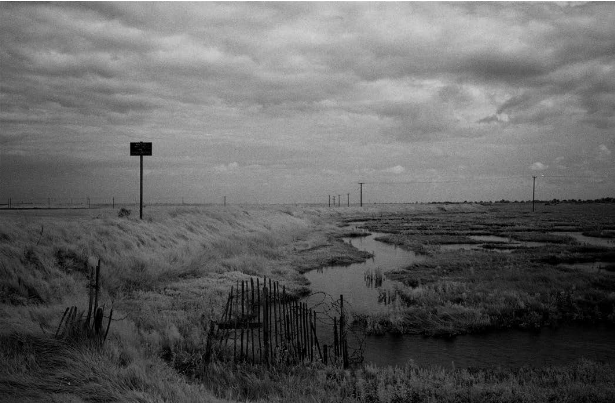
Faulness, 2014, Silver gelatin, hand print, archival print 8 × 5 ¼ in. Edition 1 of 5, 2 AP