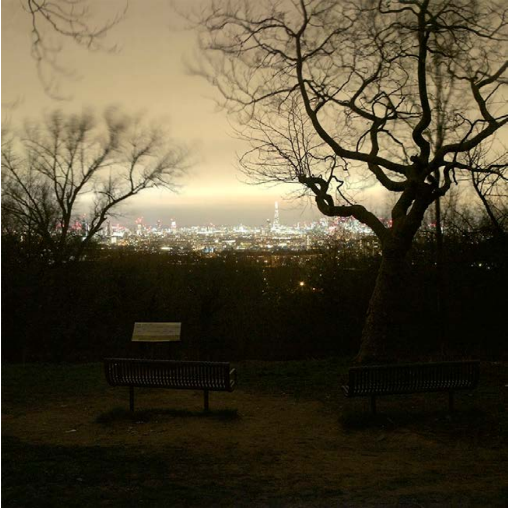
William Blake's vision , 2017 Giclee digital archival print 13 ½ × 13 ¾ in. Edition 1 of 5, 2 AP