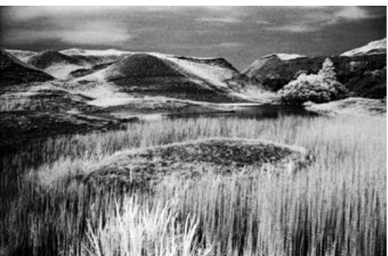
Alebebo , Triptych