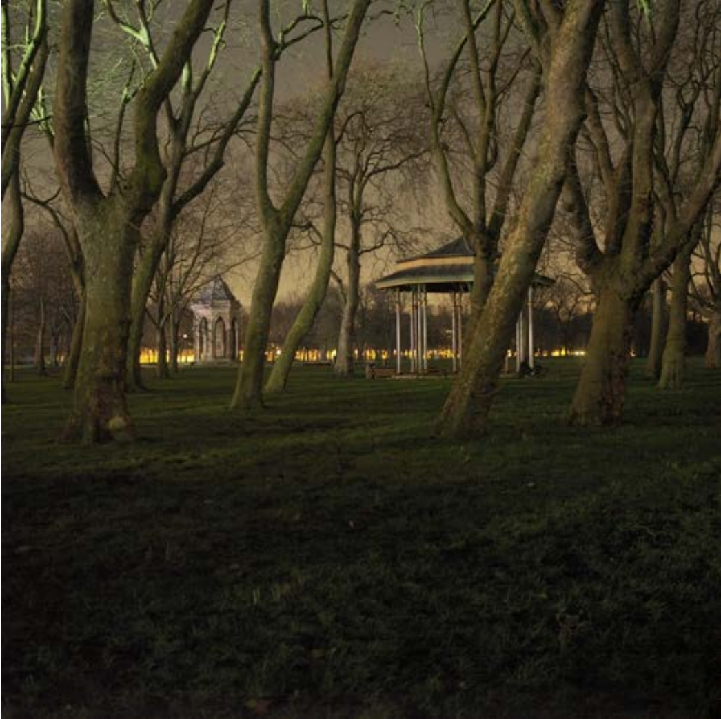
Hackney by Night 2 , 2015

C-type print on metallic archival paper, backed on foam board and mounted in tray frame 10 × 10 in.