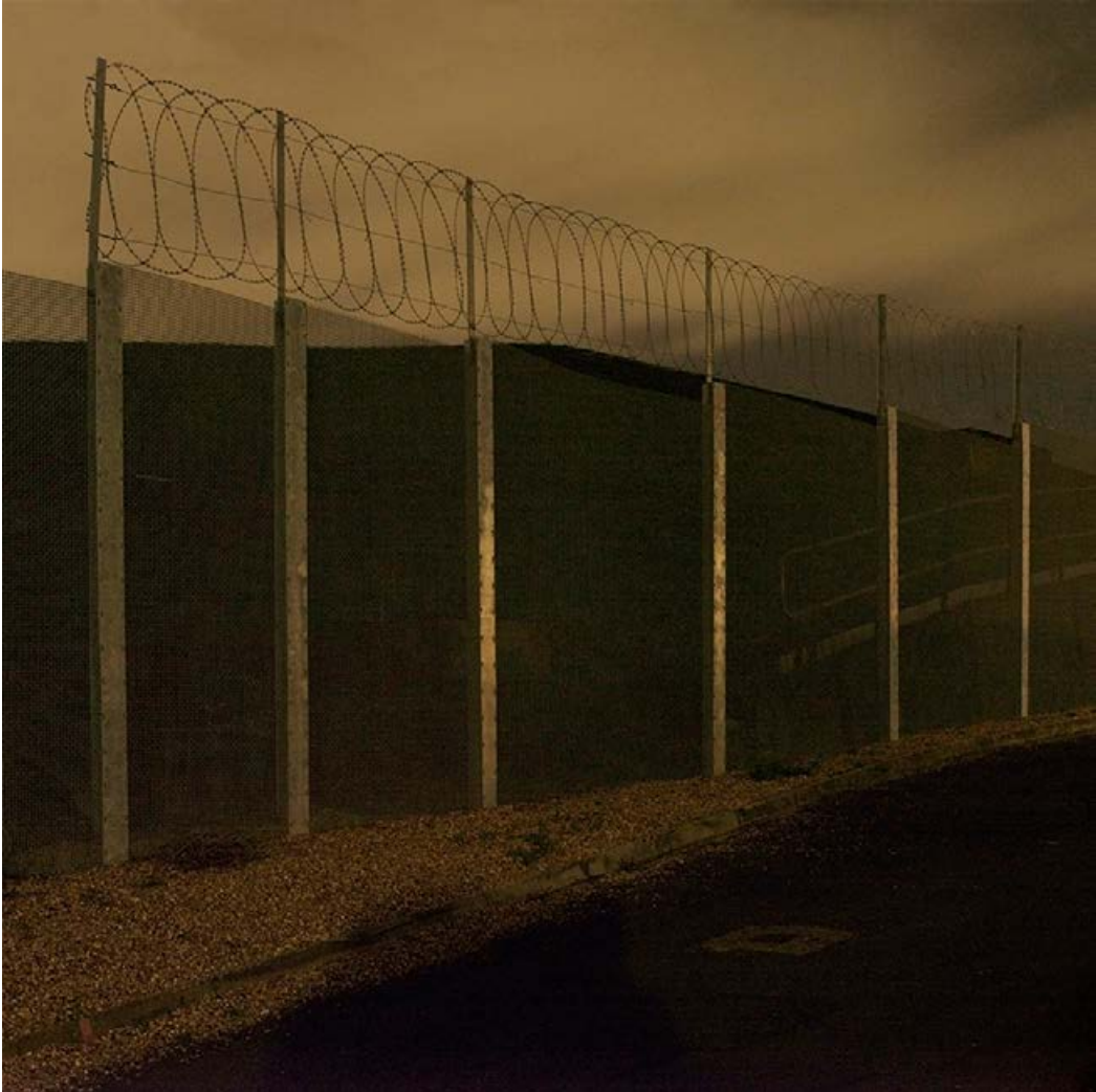
Nunhead , 2017 Giclee digital archival print 13 ½ × 13 ¾ in. Edition 1 of 5, 2 AP