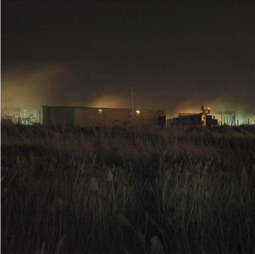
Enclosures Badlands and Borders 2, 2009

Giclee digital archival print, mounted on aluminium