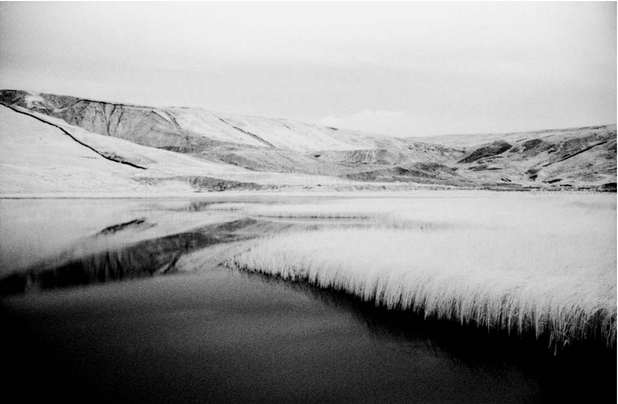
Albedo 3 , 2013 Archival chlorobromide print 7 ½ × 4 ¾ in. Edition 1 of 5, 2 AP