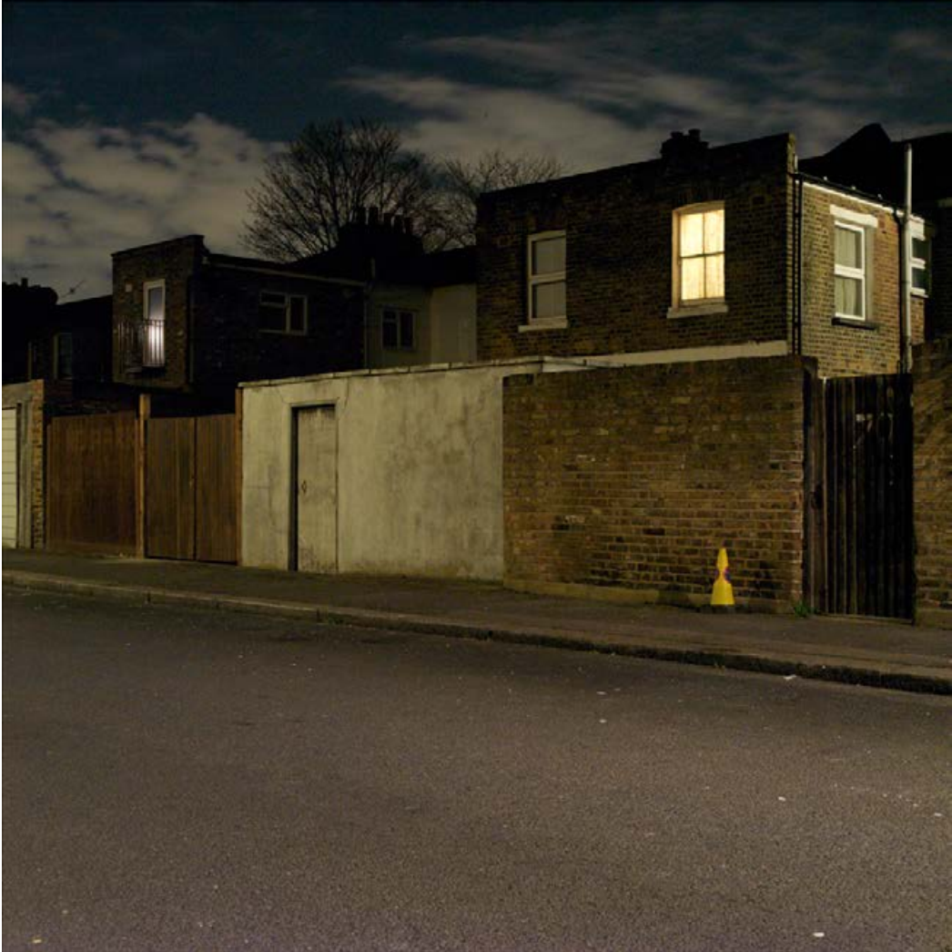
Eagle Wharf , 2017 Giclee digital archival print 13 ½ × 13 ¾ in. Edition 2 of 5, 2 AP