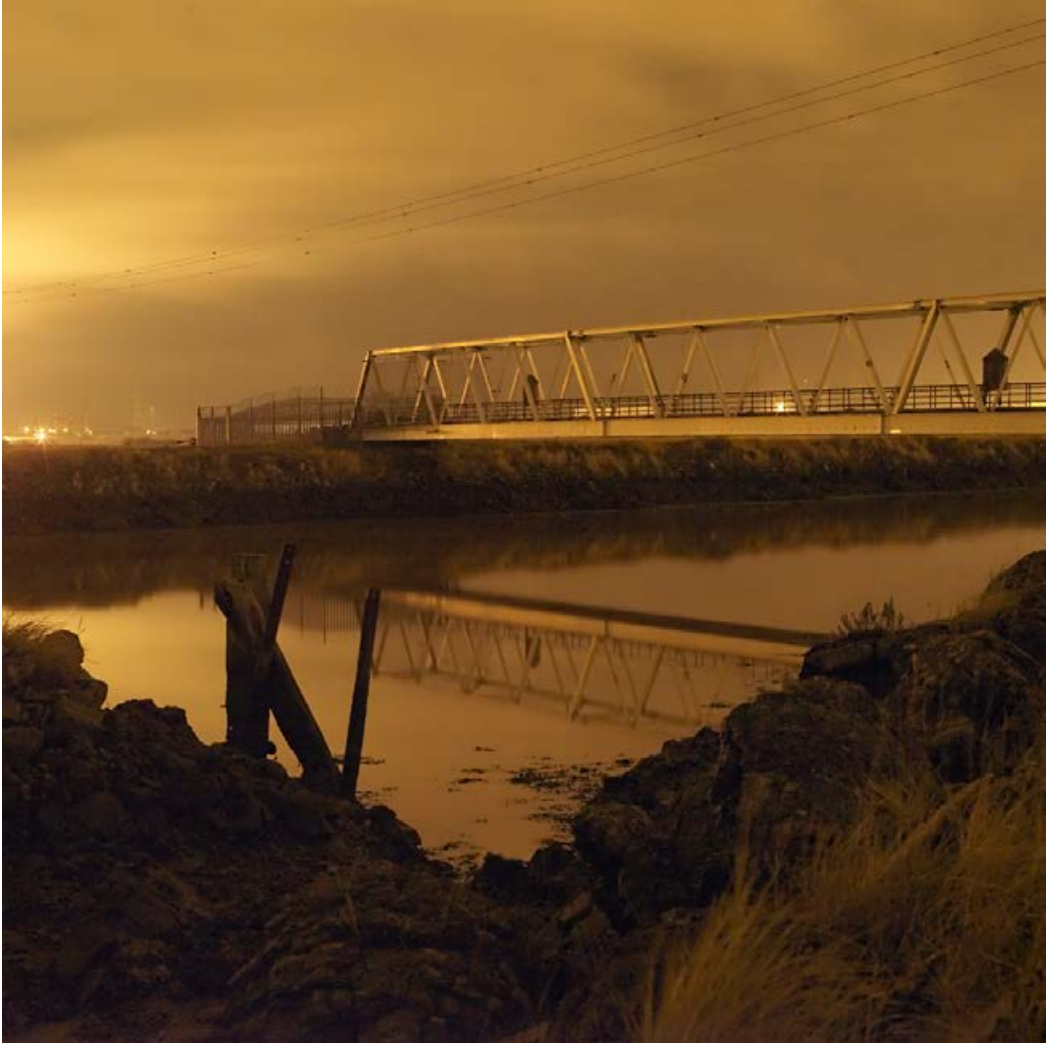
Backwater 1 , 2012 Giclee digital archival print, mounted on aluminium 20 × 20 in. Edition 1 of 5, 2 AP