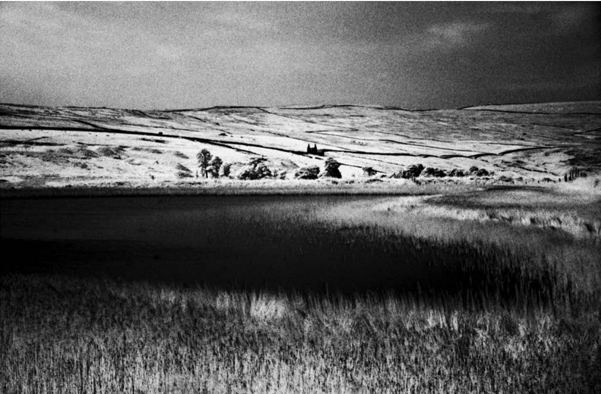
Albedo 1 , 2013 Archival chlorobromide print 7 ½ × 4 ¾ in. Edition 1 of 5, 2 AP