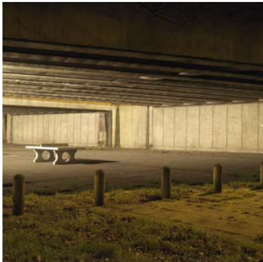
Hackney by Night, Quadtych