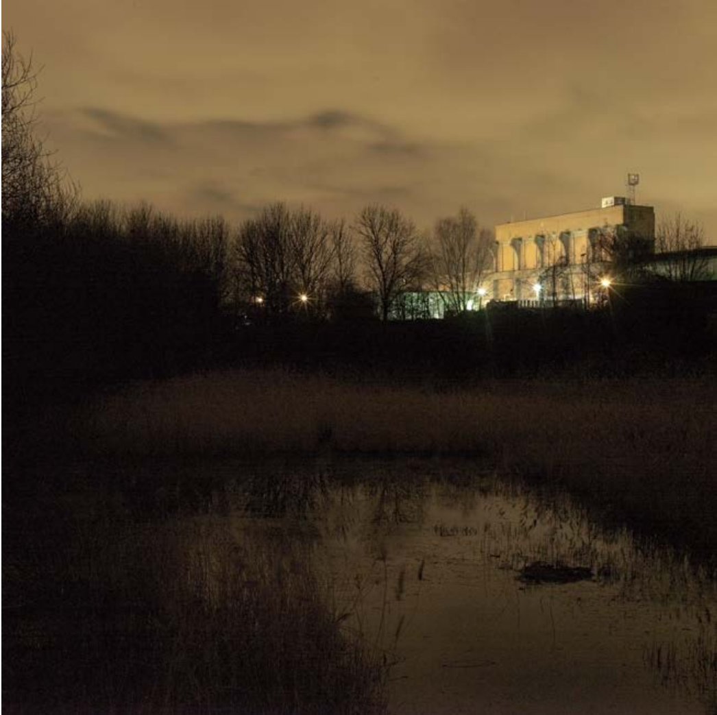
Hackney by Night 1, 2015

C-type print on metallic archival paper, backed on foam board and mounted in tray frame 10 × 10 in.