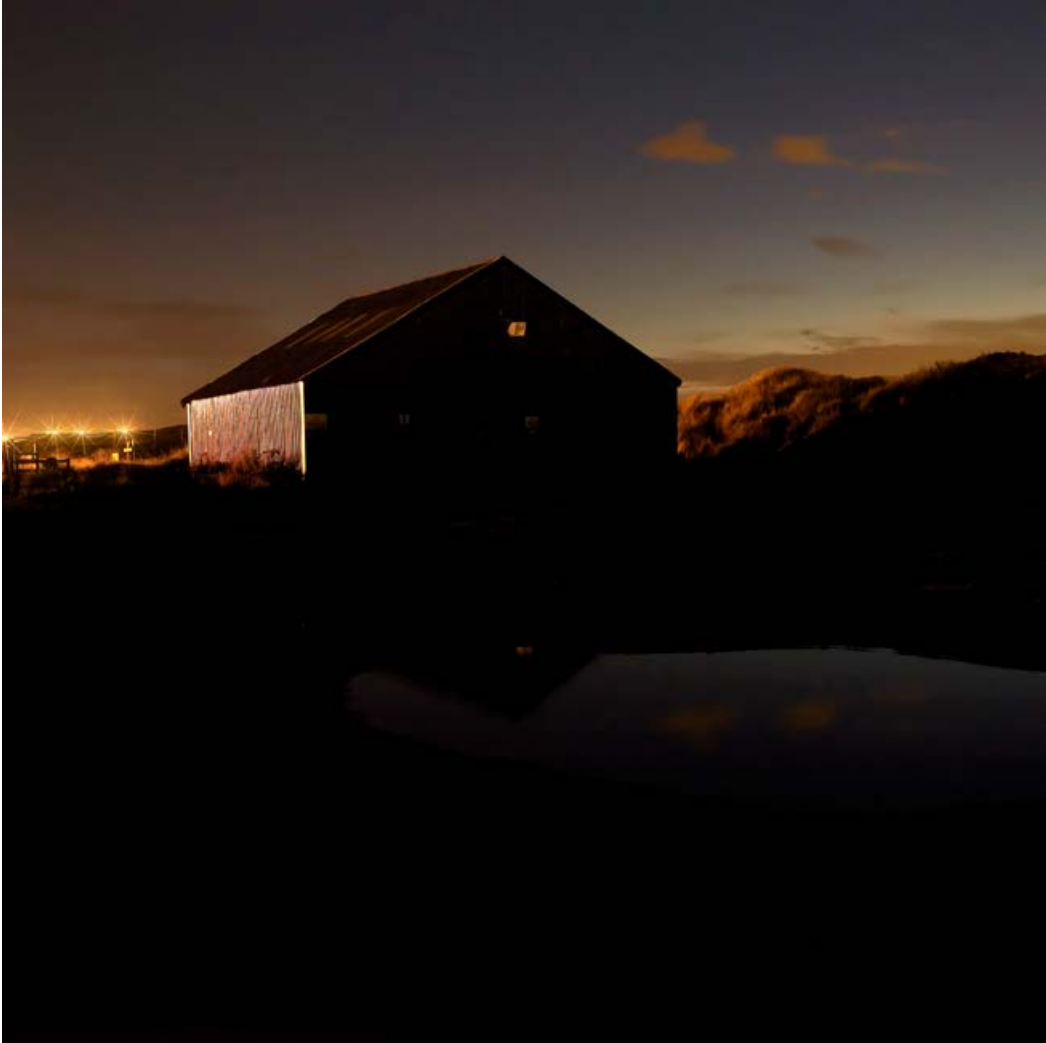
Backwater 2 , 2012 Giclee digital archival print, mounted on aluminium 20 × 20 in. Edition 1 of 5, 2 AP