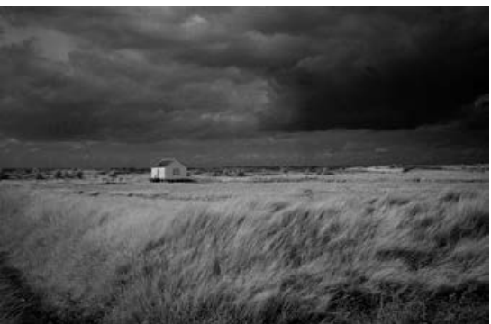
Estuary English, Triptych