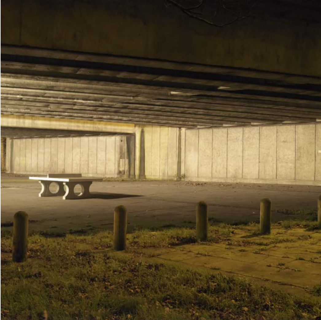
Hackney by Night 4 , 2015

C-type print on metallic archival paper, backed on foam board and mounted in tray frame 10 × 10 in.