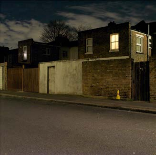
9 Square Kilometres, Triptych