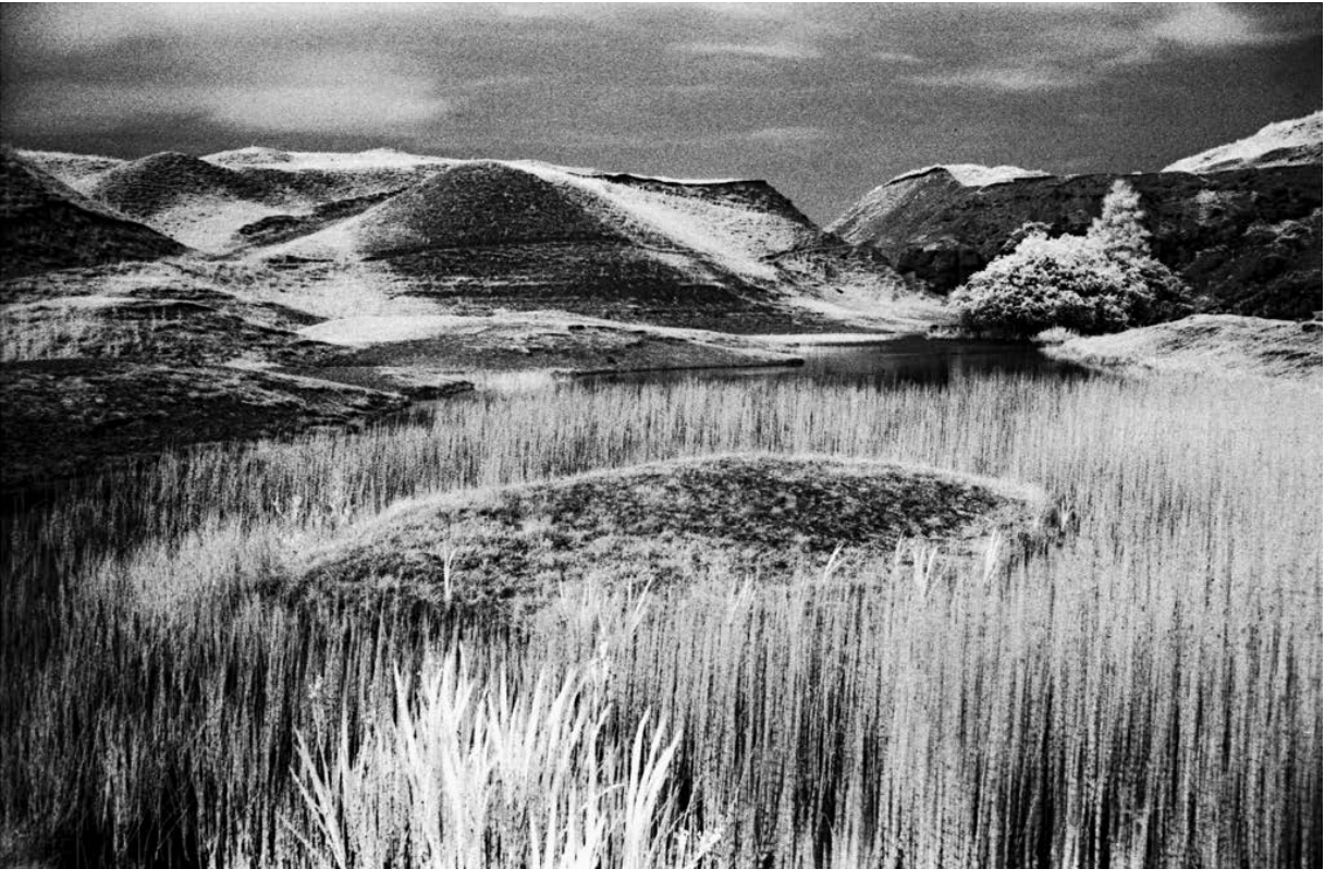
Albedo 2 , 2013 Archival chlorobromide print 7 ½ × 4 ¾ in. Edition 1 of 5, 2 AP