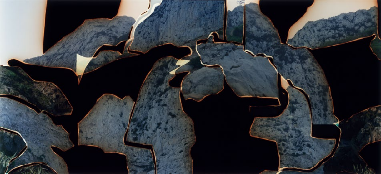
Untitled (GI -191919191919-1) 2019, C-type handprint made from 7 negatives Edition 1/5 + 1 AP 60" × 27.4" (152.4 × 69.5 cm)