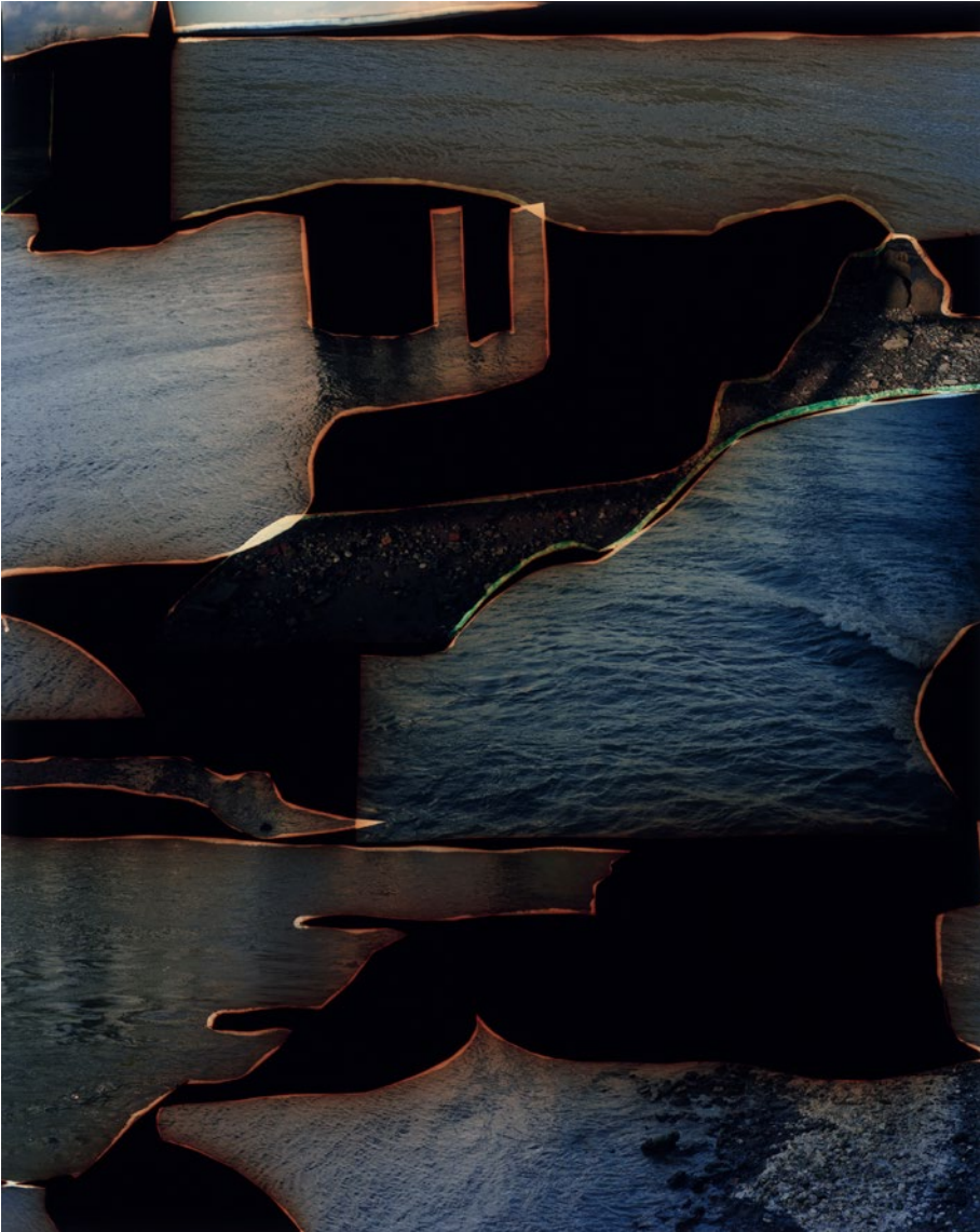
Untitled (LO -TH - 18181818-2) 2019, C-type handprint made from 4 negatives Edition 1/5 + 1 AP 16" × 19.9" (40.6 × 50.5 cm)