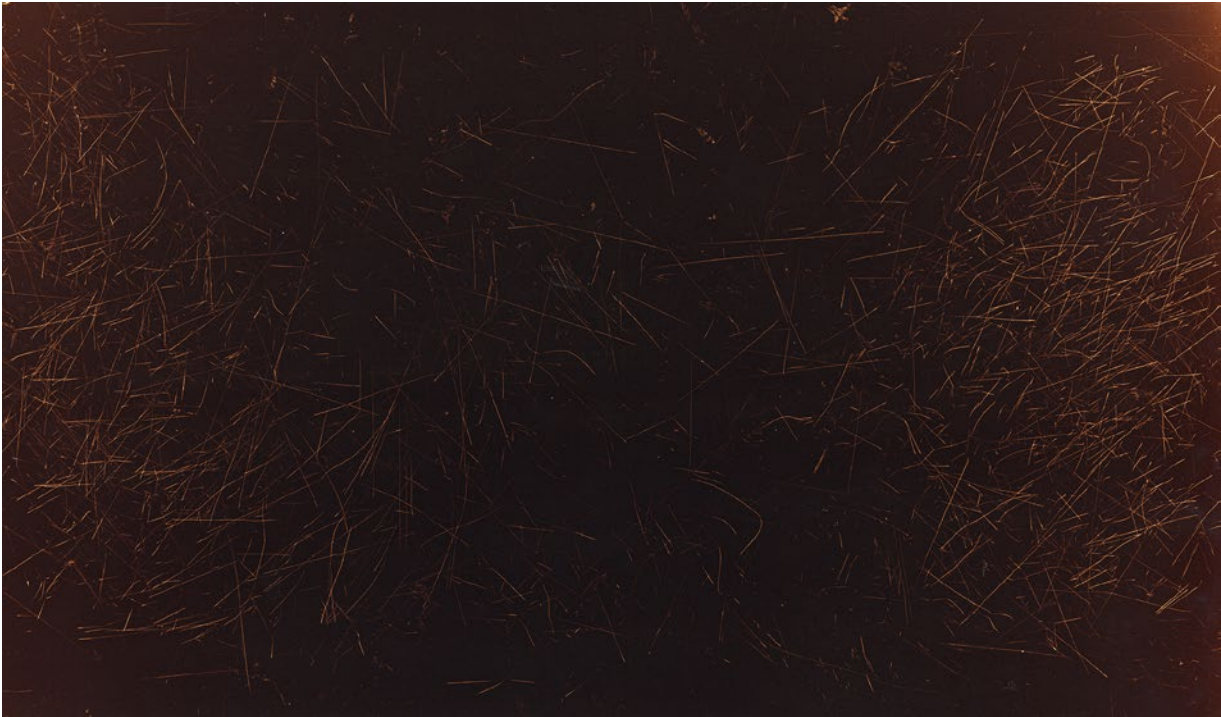
Untitled (09092019) from the Constructed Landscapes series, 2019

Colour photogram, C-type handprint, 10" × 17.5"