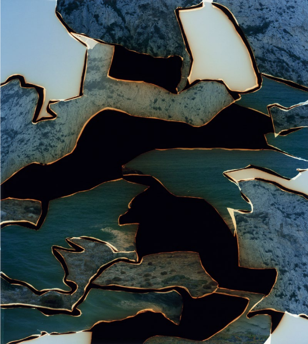
Untitled (GI -19191919191919-1) 2019, C-type handprint made from 8 negatives Edition 1/5 + 1 AP 32.2" × 40" (81.8 × 101.6 cm)