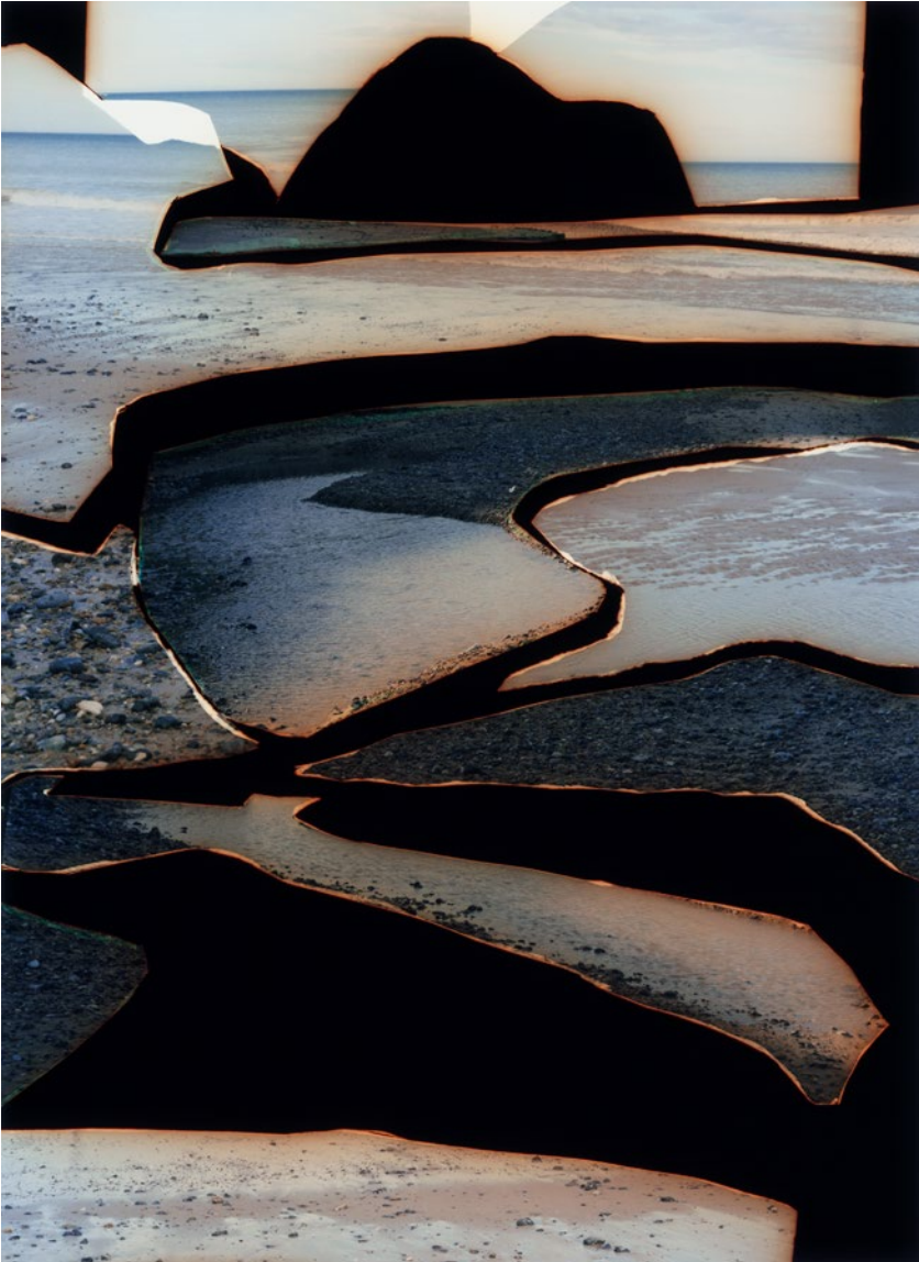
Untitled (MU - 1818181818-1) 2019, C-type handprint made from 5 negatives Edition 1/5 + 1 AP 24" × 33.7" (61 × 85.5 cm)