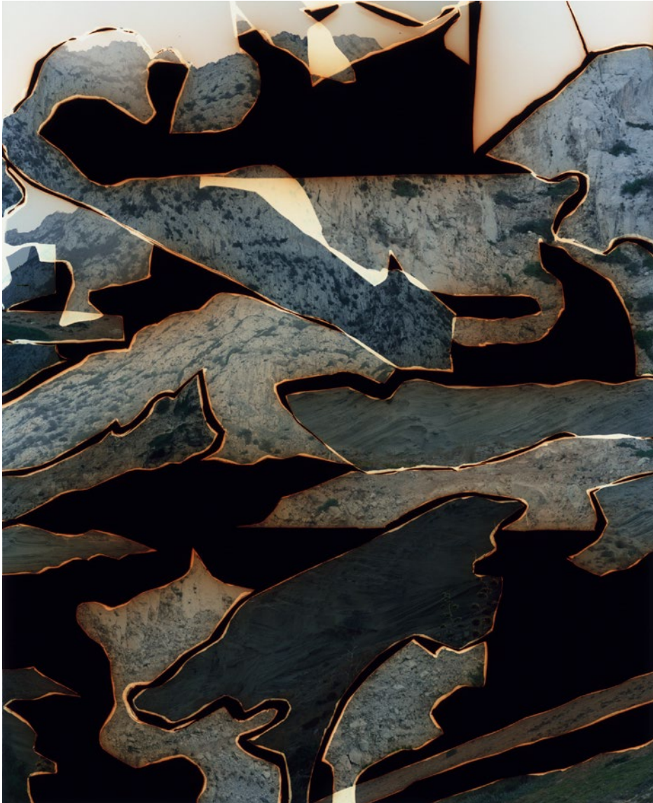
Untitled (GI -191919191919-1) 2019, C-type handprint made from 6 negatives Edition 1/5 + 1 AP 24" × 26.6" (61 × 67.5 cm)