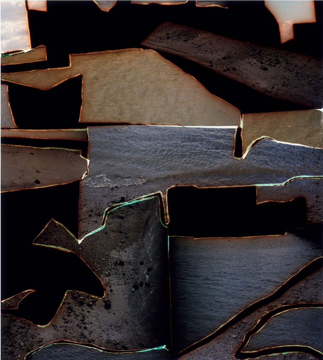
Untitled (LO -TH -1818181818181818 -1) 2018, C-type handprint made from 9 negatives Edition 1/5 + 1AP 40" × 45" (101.6 × 114.5 cm)