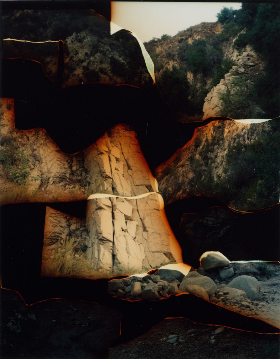
Untitled (AL-15151515151515-1) from the Constructed Landscapes series, 2019 C-type handprint made from 8 negatives 9" x 7" Edition of 70 + 4 AP