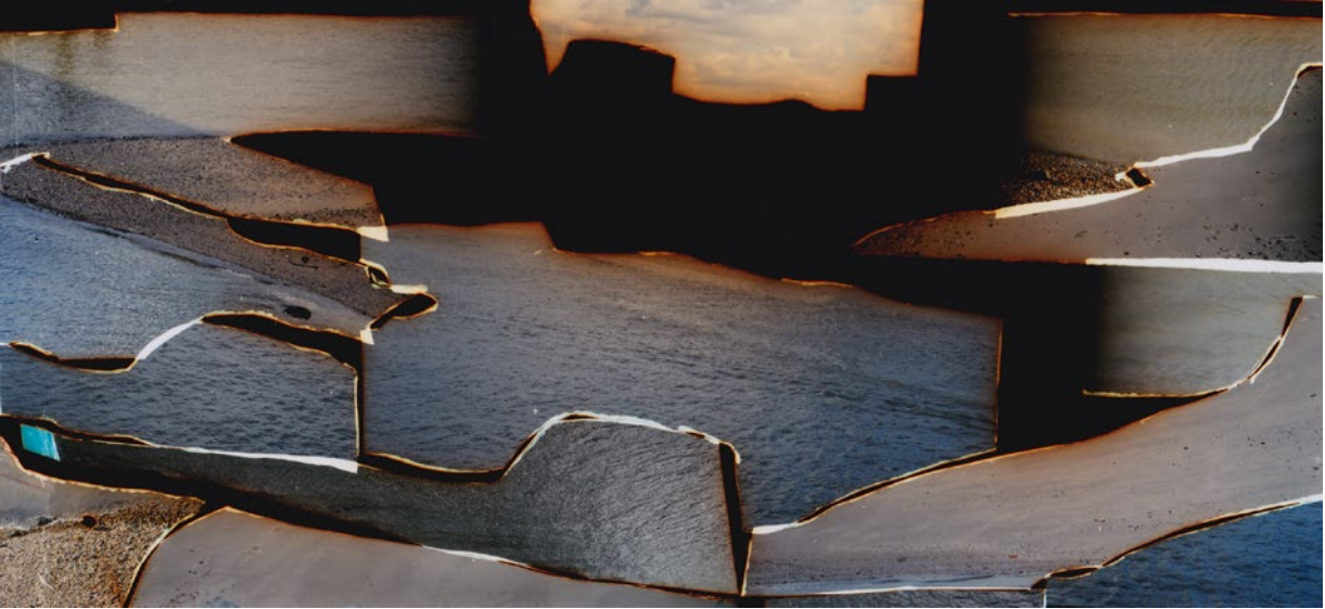
Untitled (LO -TH -18181818181818 -1) 2018, C-type handprint made from 8 negatives Edition 1/5 + 1 AP 30" × 13.8" (76.2 × 35 cm)