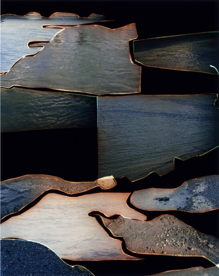
Untitled (LO -TH - 181818181818-1) 2019, C-type handprint made from 7 negatives Edition 1/5 + 1 AP 24.2" × 30" (61.5 × 76.2 cm)