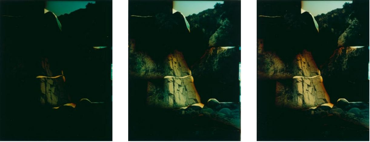
Untitled (AL-1515151515151515) [Studies 1-3], 2019