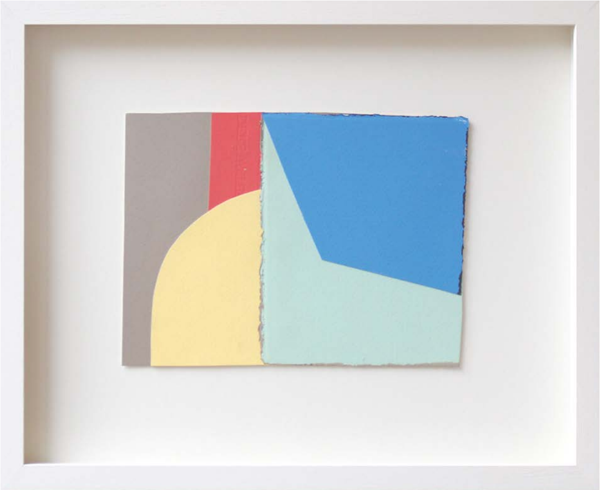
Joanne Hummel-Newell Unbecoming , 2017 Water-based and ink collage on watercolour paper 47 × 37 cm