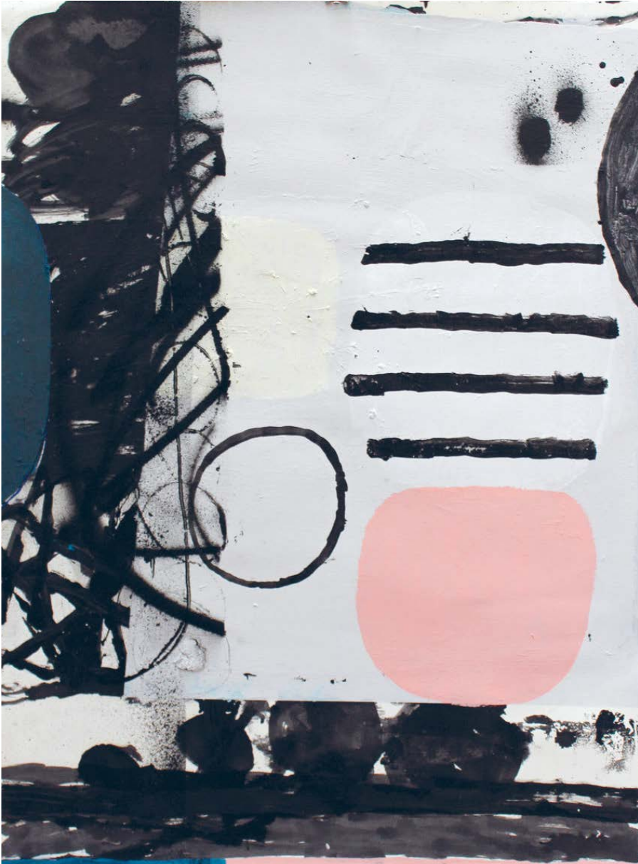
Stephen Smith Archetype Study , 2017 Acrylic, enamel and oil stick on paper 56 × 76 cm