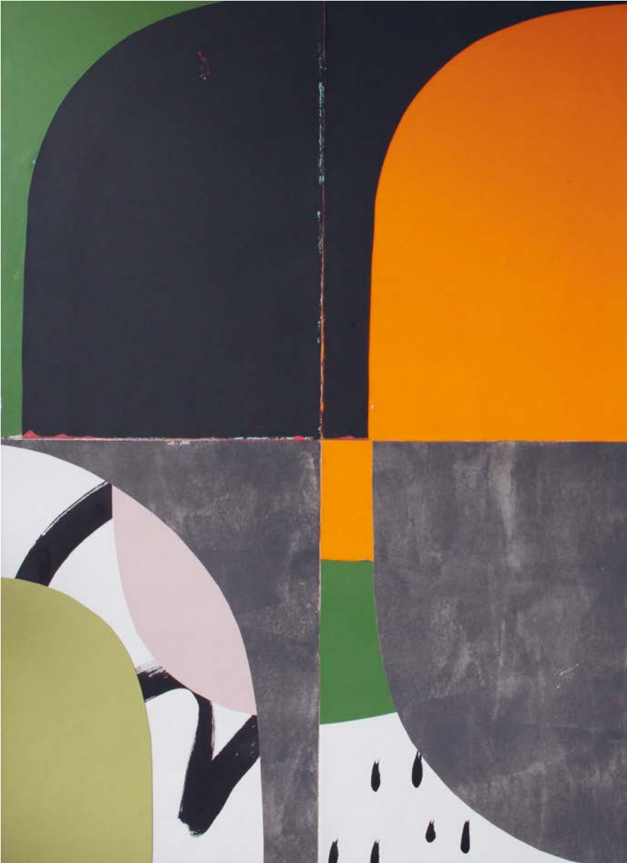
Joanne Hummel-Newell Youth , 2018 Water-based and ink collage on watercolour paper 112 × 153 cm