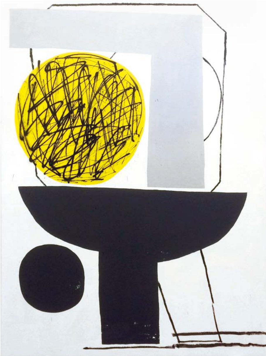
Stephen Smith Pavilion , 2015 Acrylic and oil on canvas 150 × 200 cm