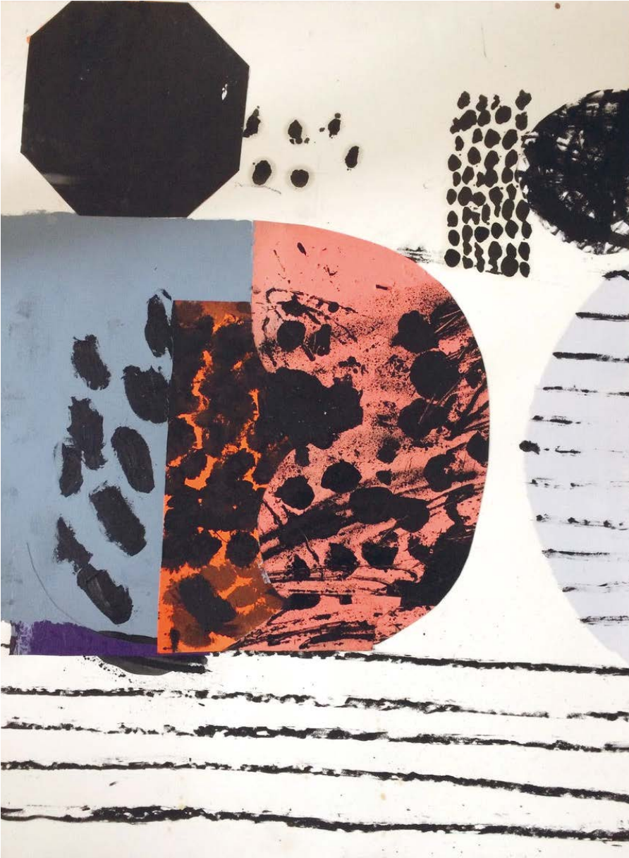
Stephen Smith Systematic , 2015 Enamel, acrylic, oil stick and collage on paper 56 x 76 cm