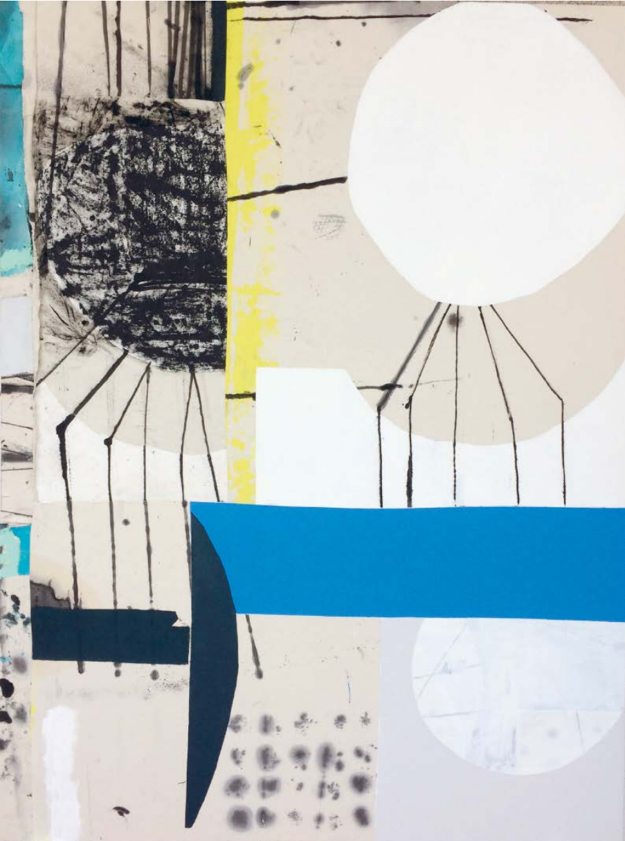
Stephen Smith Crawler , 2017 Oil and acrylic on stitched canvas 150 × 200 cm