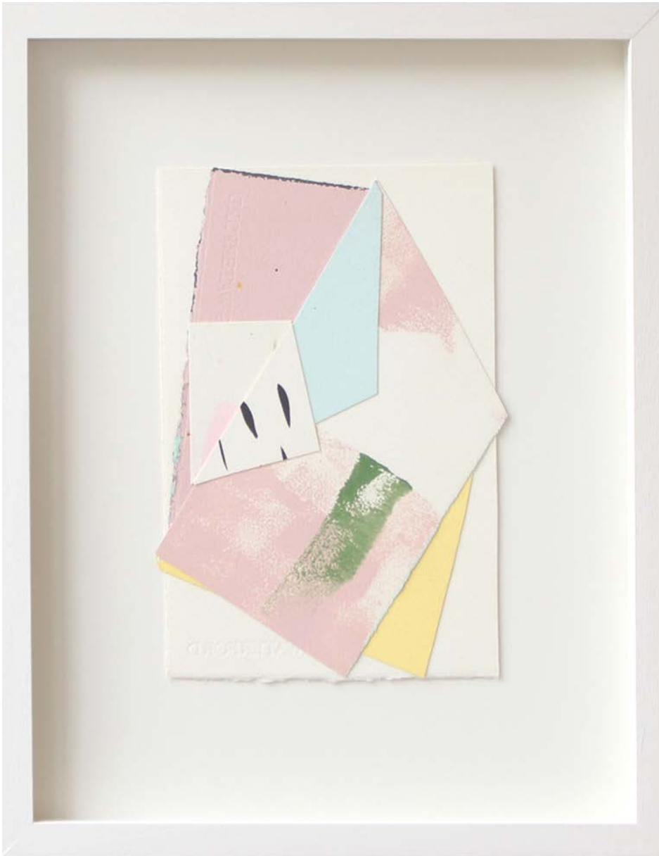
Joanne Hummel-Newell Bright Light , 2017 Water-based and Indian ink on watercolour paper 37 × 47 cm