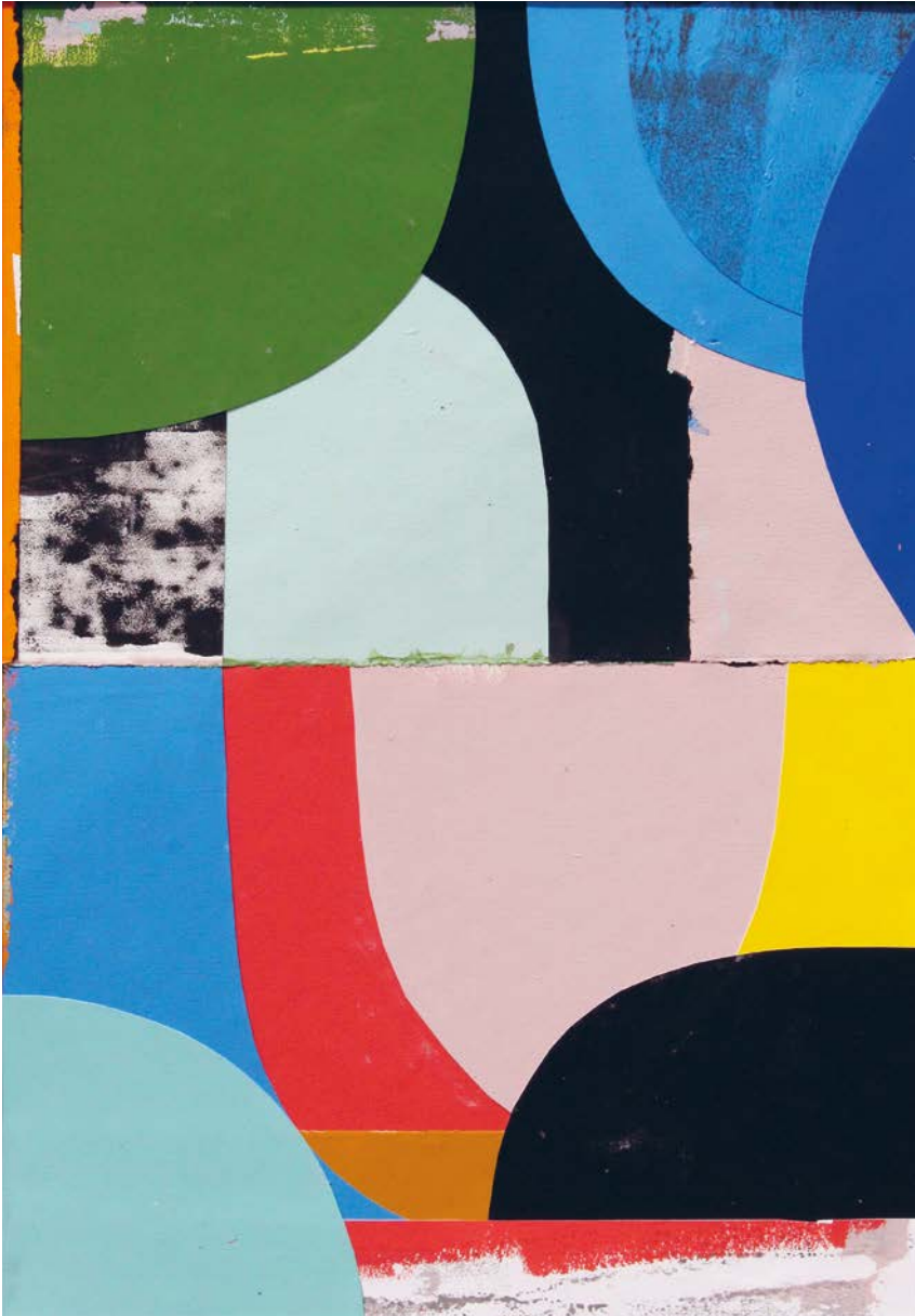
Joanne Hummel-Newell Evermore , 2018 Water-based ink on watercolour paper 112 × 76.5 cm