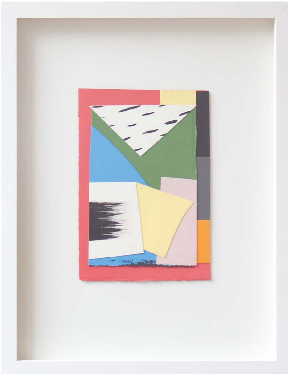
Joanne Hummel-Newell Recreation , 2017 Water-based and ink collage on watercolour paper 37 × 47 cm