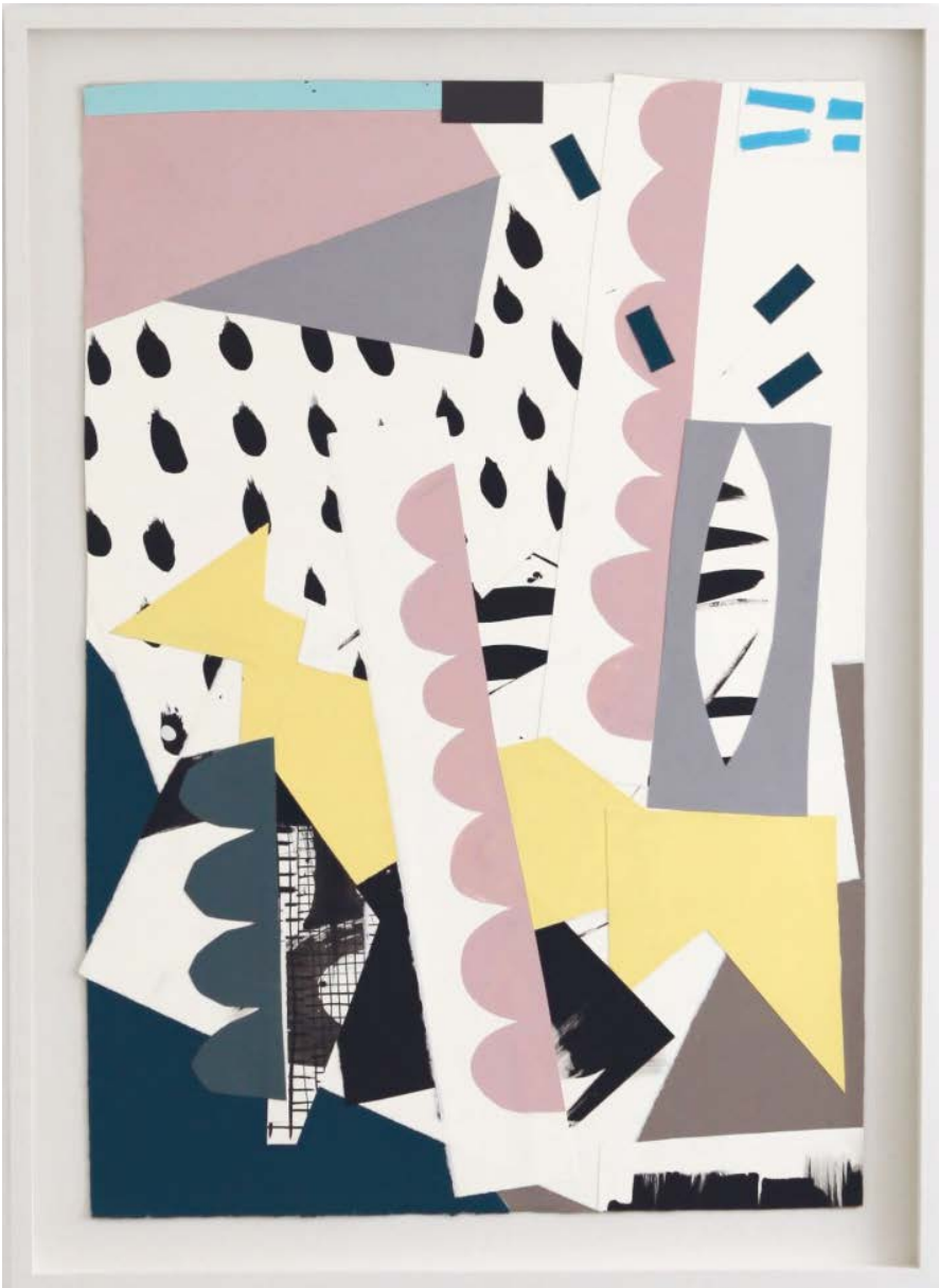
Joanne Hummel-Newell Vanilla, 2017 Household and ink collage on watercolour paper 122 × 88 × 5 CM