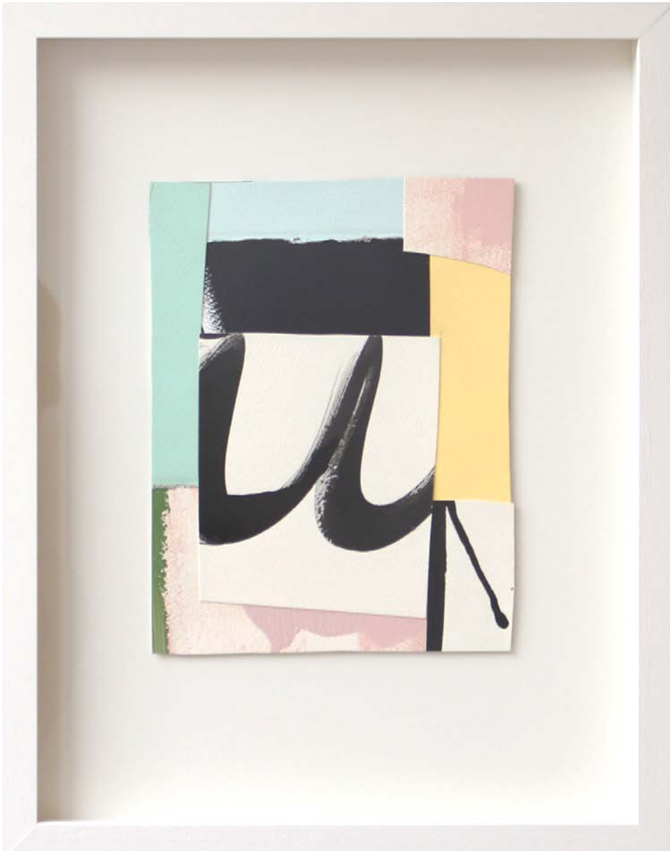
Joanne Hummel-Newell Inside , 2017 Water-based and ink collage on watercolour paper 37 x 47 cm