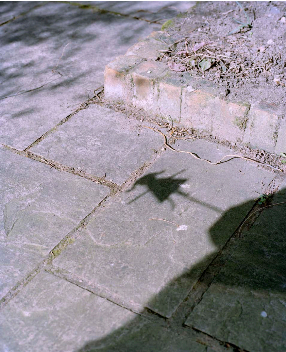
Hayleigh Longman The shed was our spaceship, (untitled 01), 2018 C-Type print mounted on 3mm dibond with batten fixings Edition 1 of 5 +1AP 51 × 41 cm