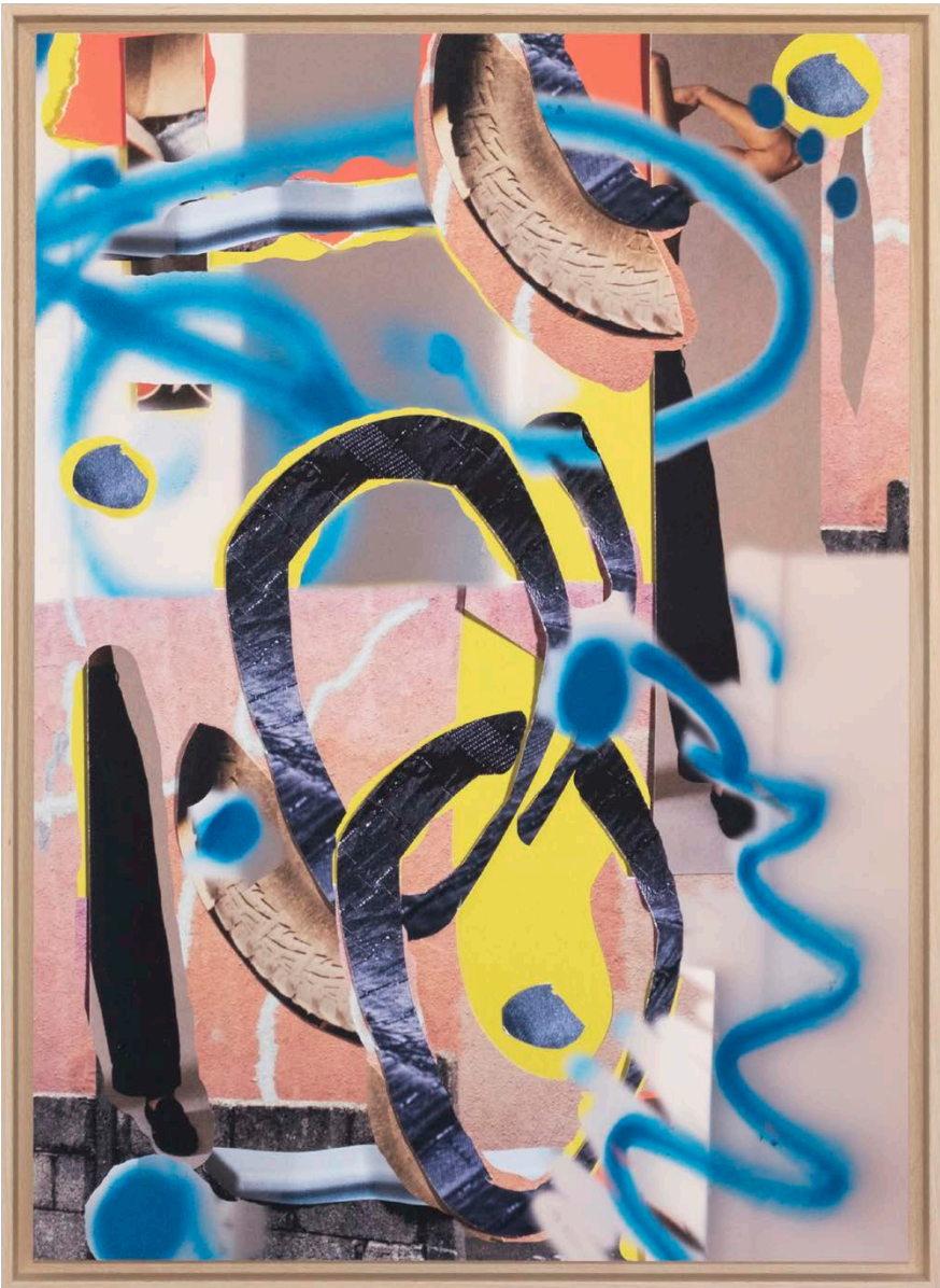
Ibrahim Azab FOPDTMM_#37 , 2020 Digital print on German Etching paper mounted on Aluminium Edition 1 of 5 +1AP 70 × 50 cm (framed)