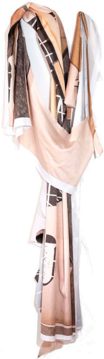
Ibrahim Azab FOPDTMM_#30 , 2019 Ripped synthetic printed silk Unique Edition 175 × 150 cm