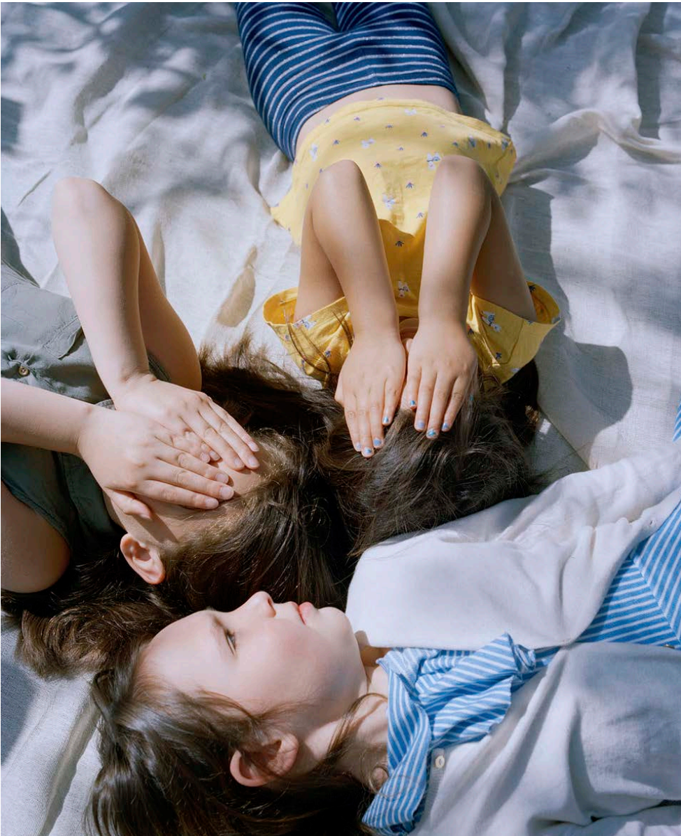
Hayleigh Longman The shed was our spaceship, (untitled 04) , 2018 C-Type print mounted on 3mm dibond with batten fixings Edition 1 of 3 +1AP 73 × 55 cm