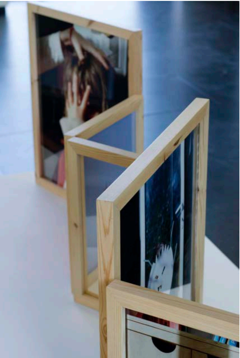
Alternate view of Play to the pieces