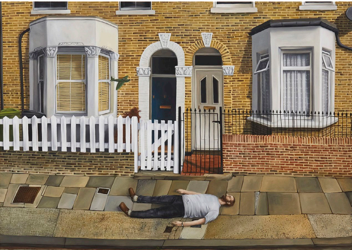
Northway Road, 2022