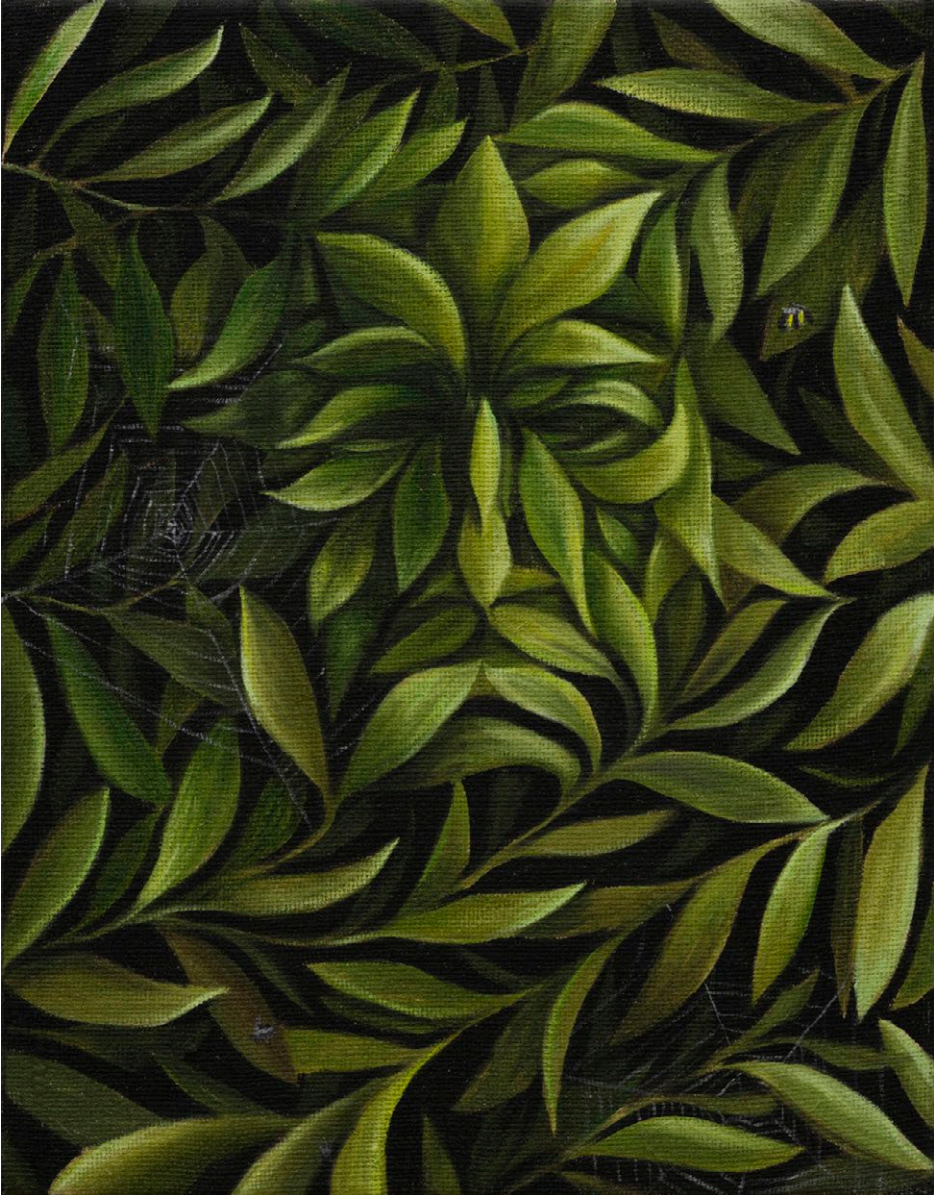
Green man, 2023 Oil on jute 46 × 36 × 2.5 cm