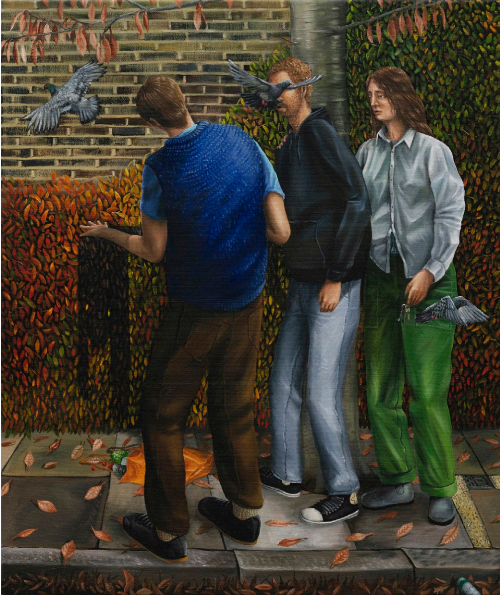
Display , 2023 Oil on jute 95 × 80 × 2.5 cm