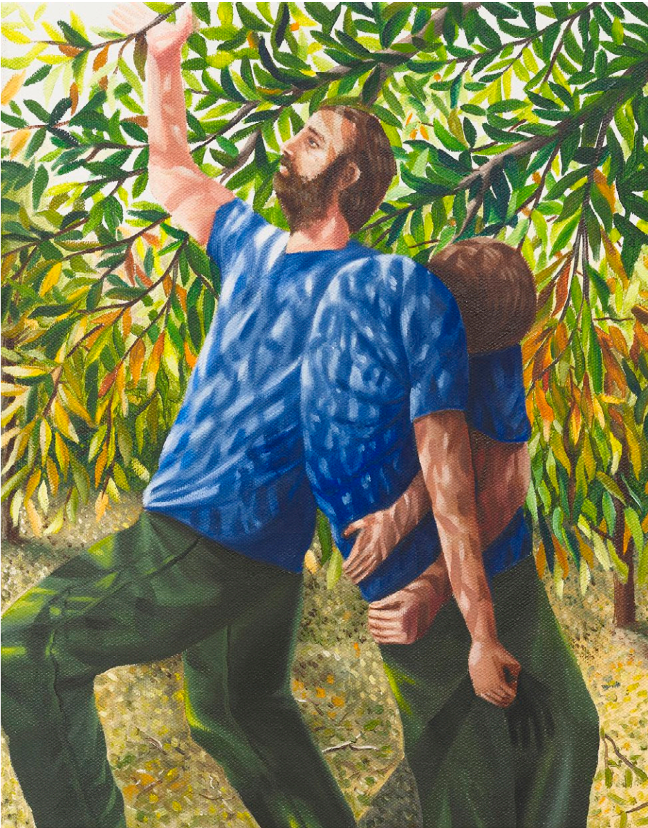
Come On, 2022 Oil on canvas 36 × 28 × 2.5 cm