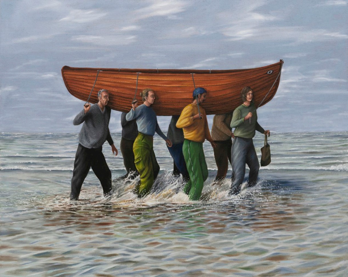
Onwards, 2023 Oil on jute 120 × 150 × 3.5 cm