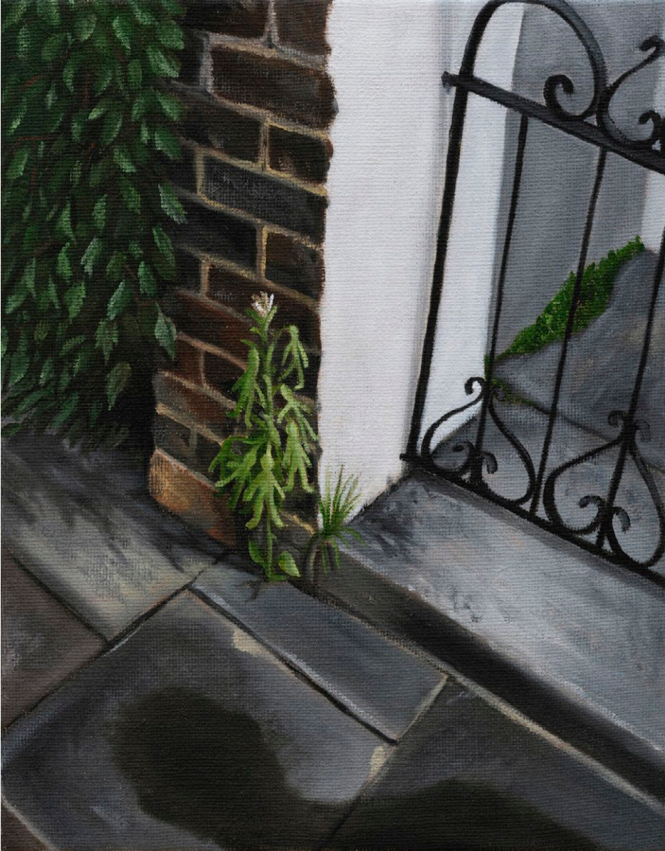
Weed, 2023 Oil on jute 46 × 36 × 2.5 cm