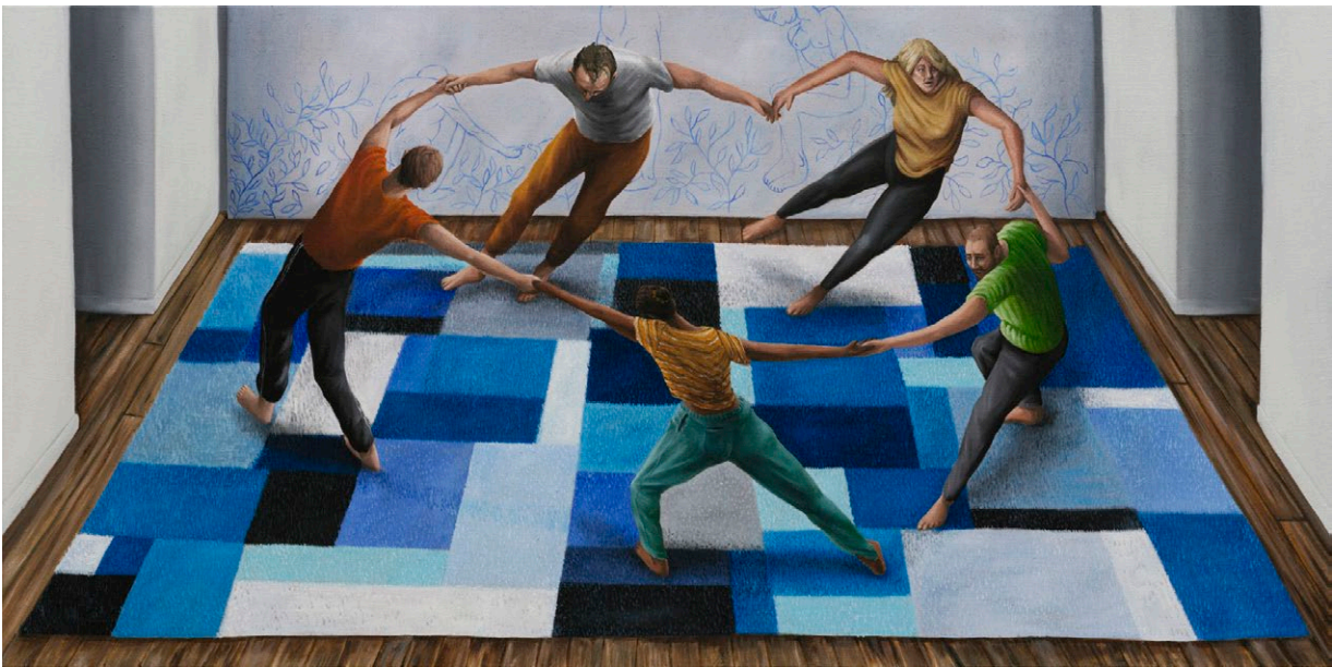
The Dance , 2023 Oil on jute 100 × 200 × 4.5 cm