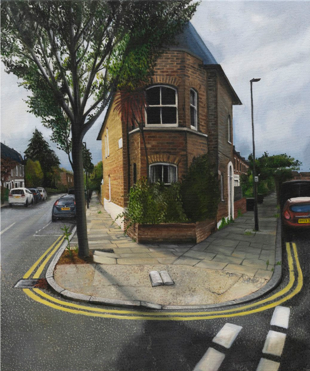
Book , 2023 Oil on jute 95 × 80 × 2.5 cm