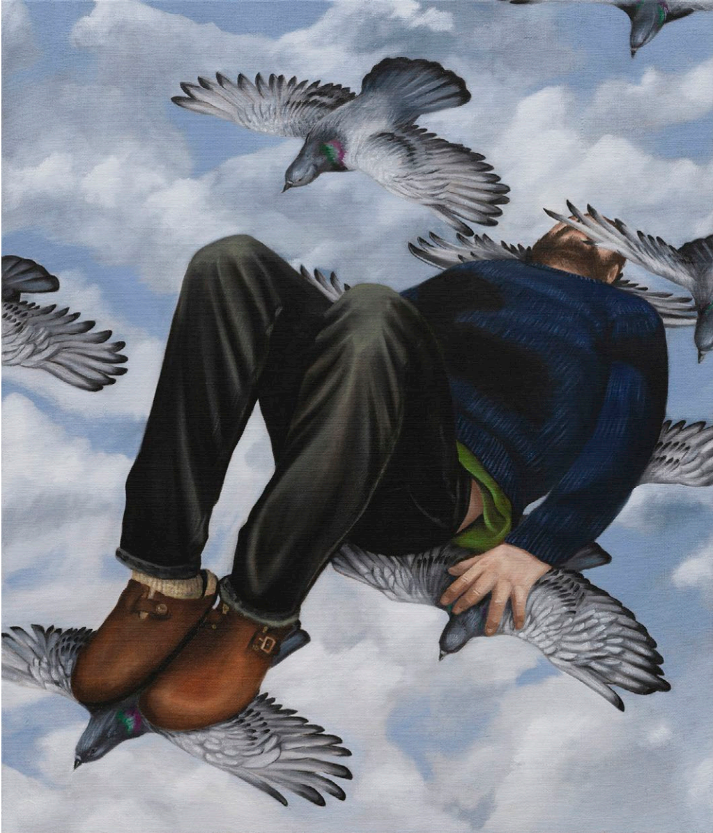
Flight , 2023 Oil on jute 100 × 85 × 3.5 cm