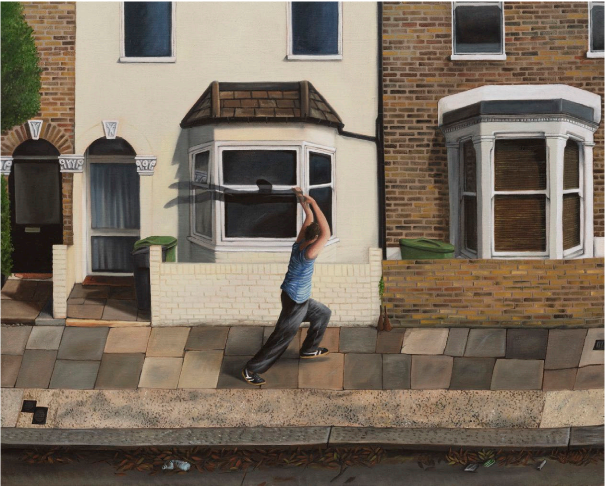
Release, 2023 Oil on jute 120 × 150 × 3.5 cm