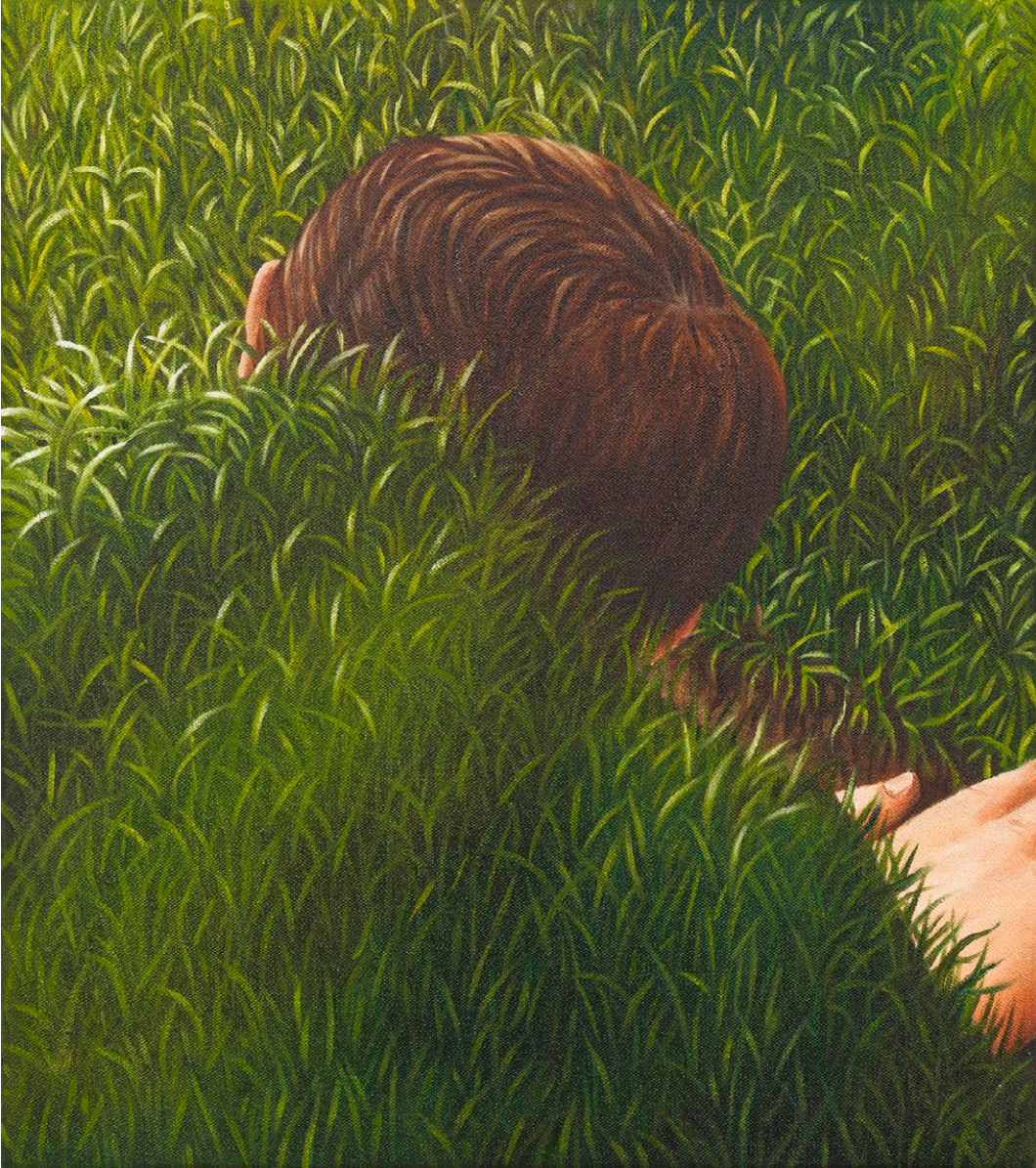
Waking , 2022 Oil on canvas 40 × 35 × 2.5 cm