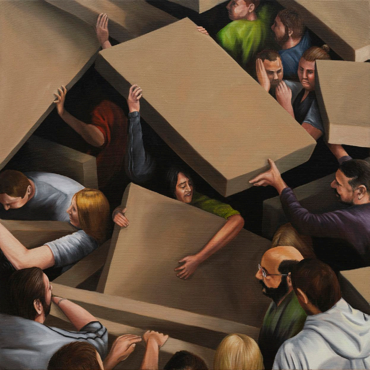
Baggage , 2023 Oil on jute 100 × 100 × 2.5 cm