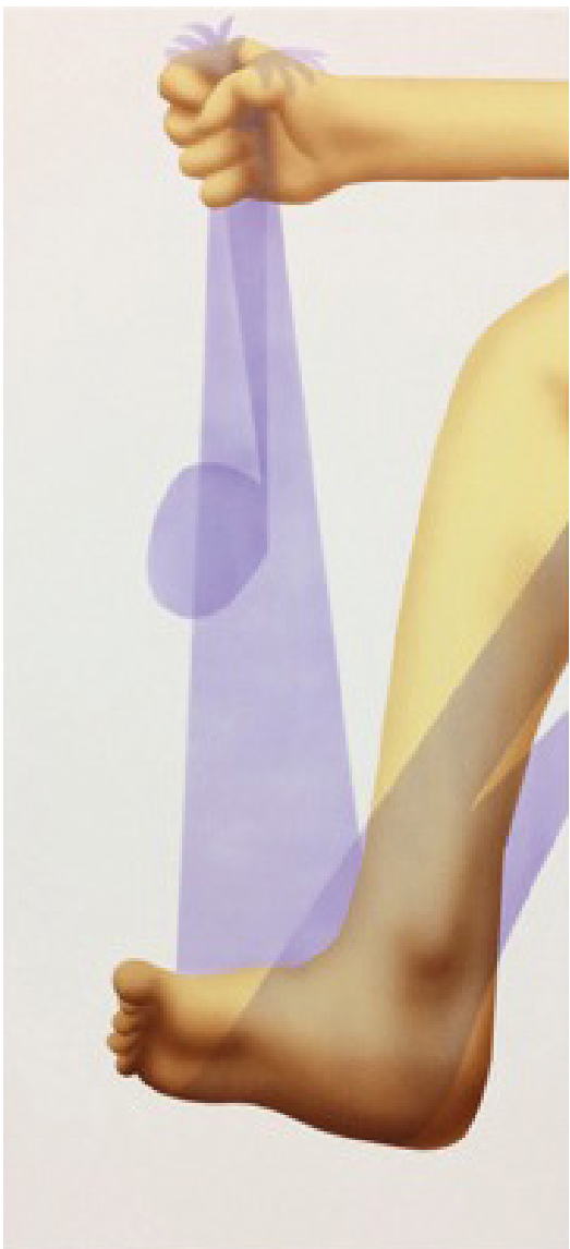
Stretch , 2019 Acrylic on canvas 35 × 75 cm