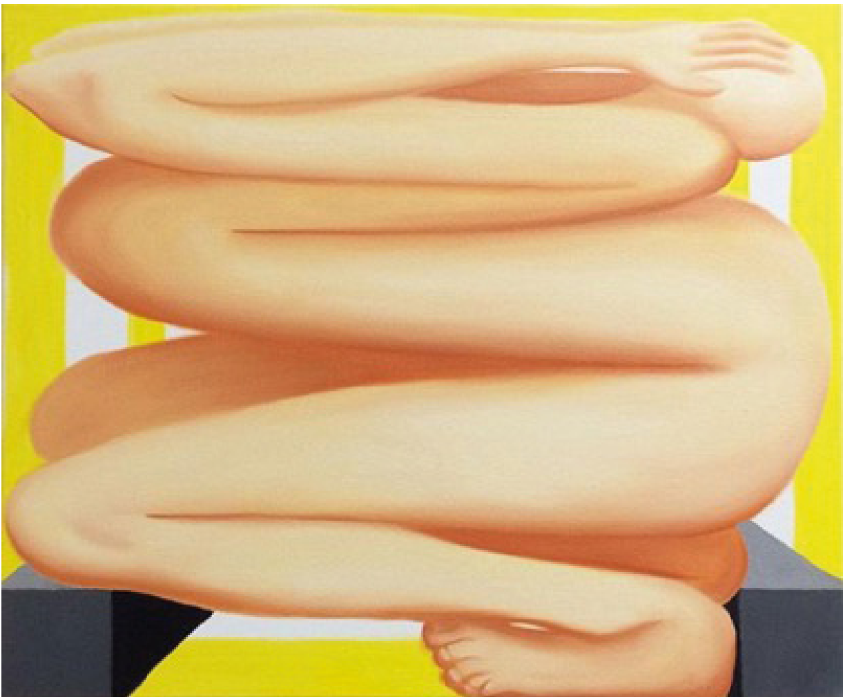
Untitled , 2018 Acrylic and oil on canvas 51 × 61 cm