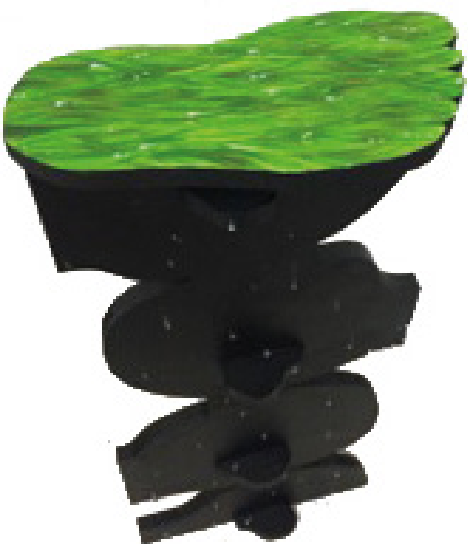
Damp Grass, 2019 Acrylic on wood 74 x 31 x 15 cm