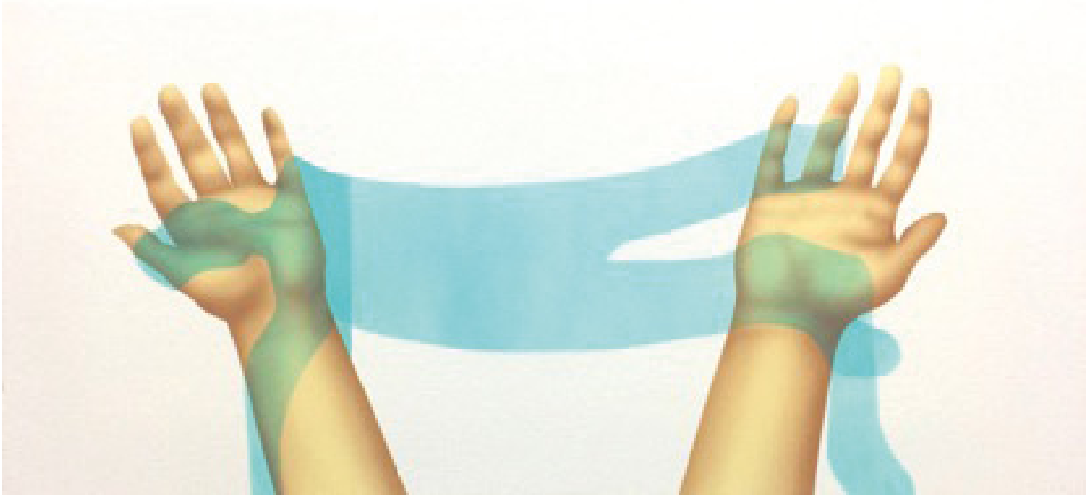
Cradle , 2019 Acrylic on canvas 35 x 75 cm