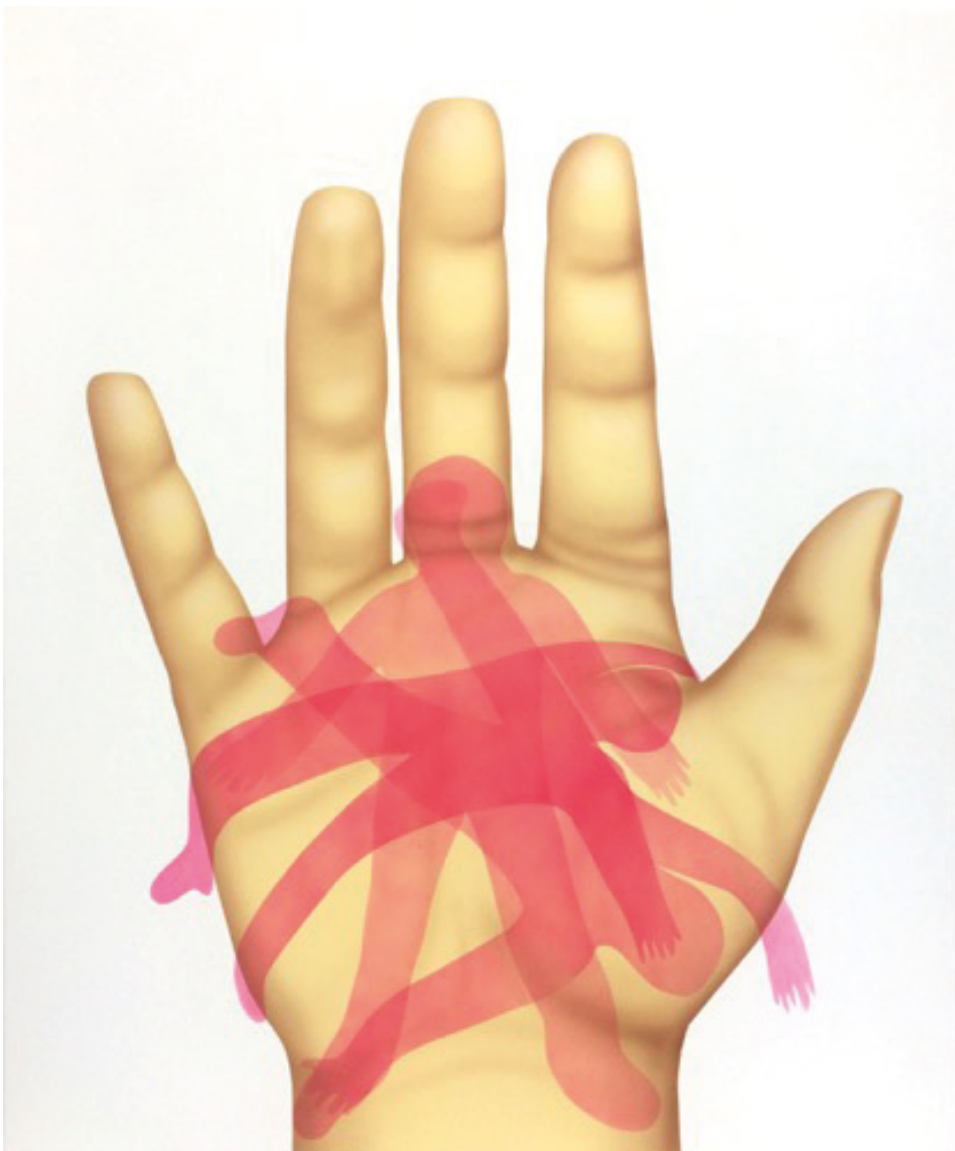
Handful , 2019 Acrylic on canvas 100 × 120 cm