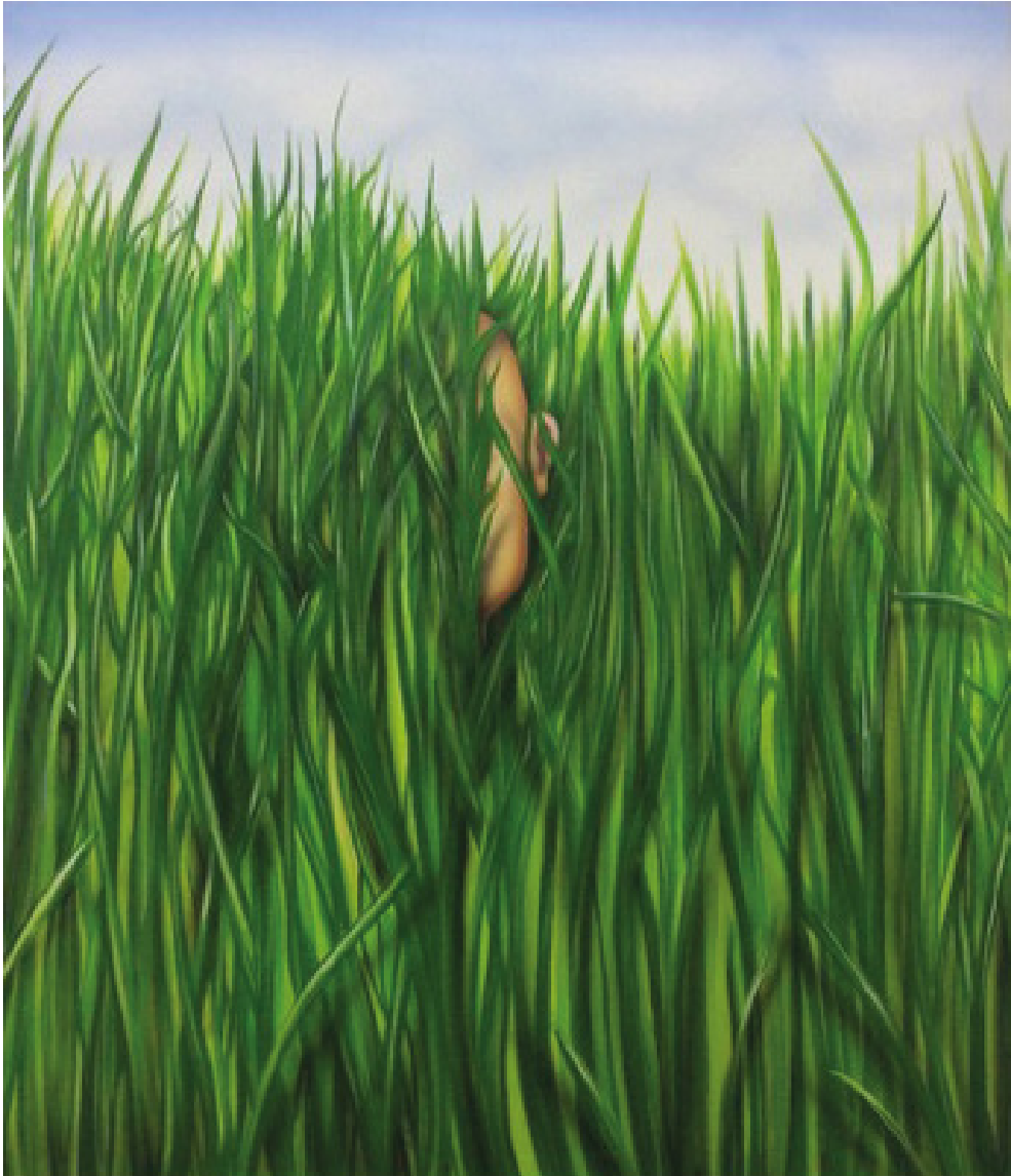
In Grass , 2019 Acrylic on canvas 107 × 92 cm