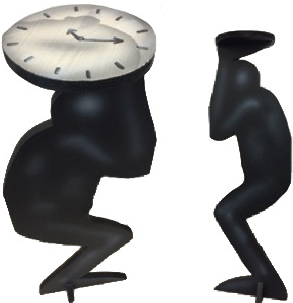
Time , 2019 Acrylic on wood 92 × 21 × 19 cm