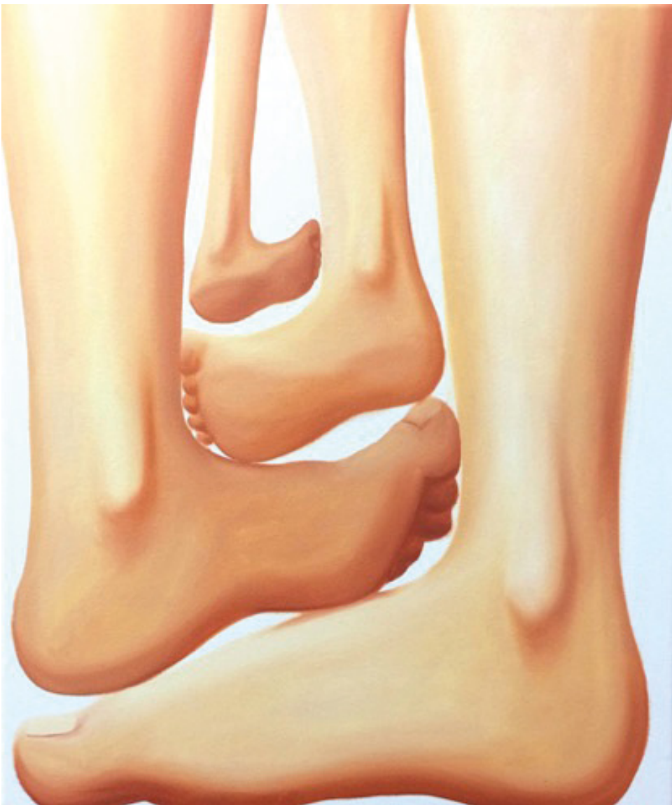
Feet , 2018 Oil on canvas 51 × 61 cm