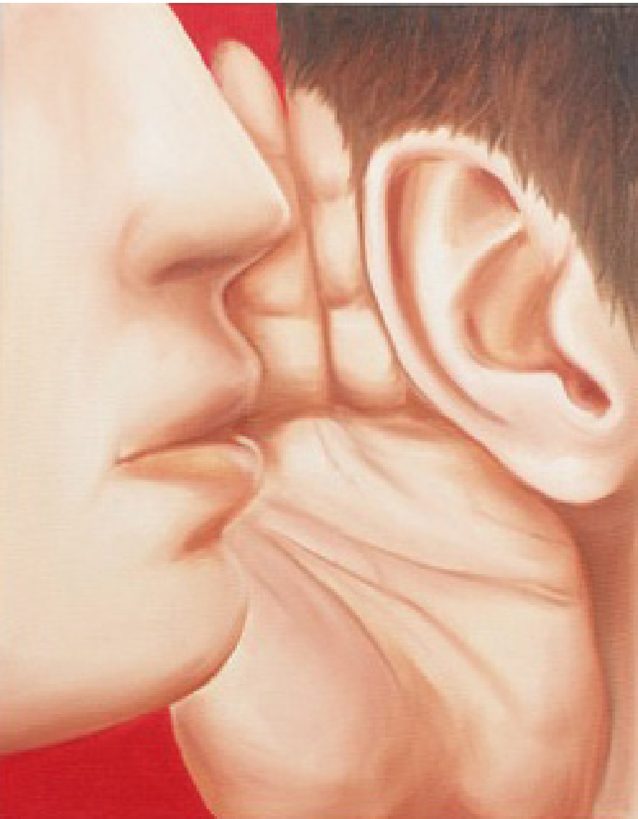
Whisper , 2019 Oil on canvas 28 x 36 cm