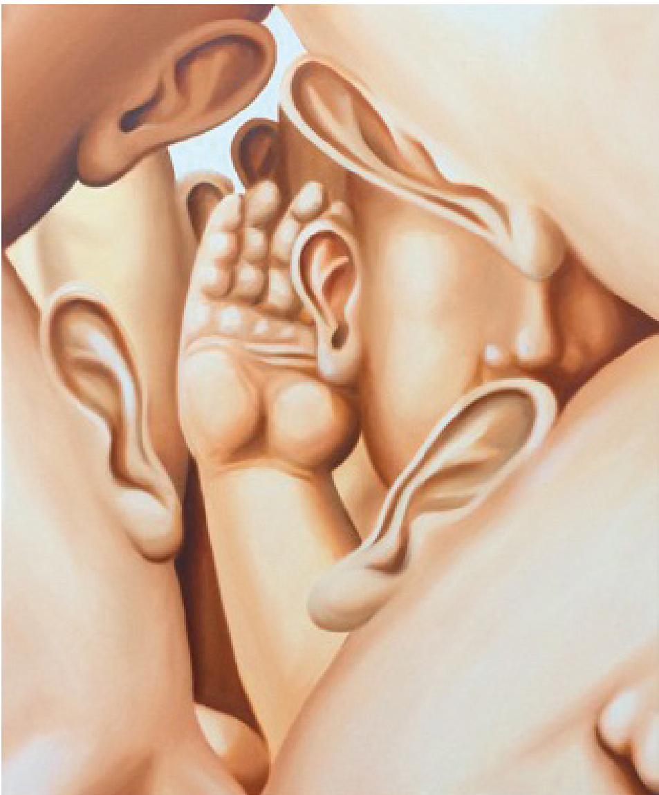
Listeners , 2019 Oil on canvas 51 × 61 cm