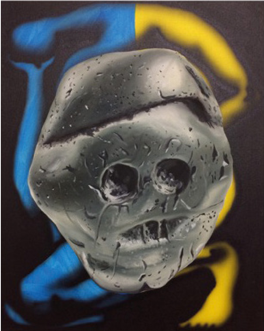
Pebblehead , 2018 Acrylic and oil on canvas 62 × 77 cm