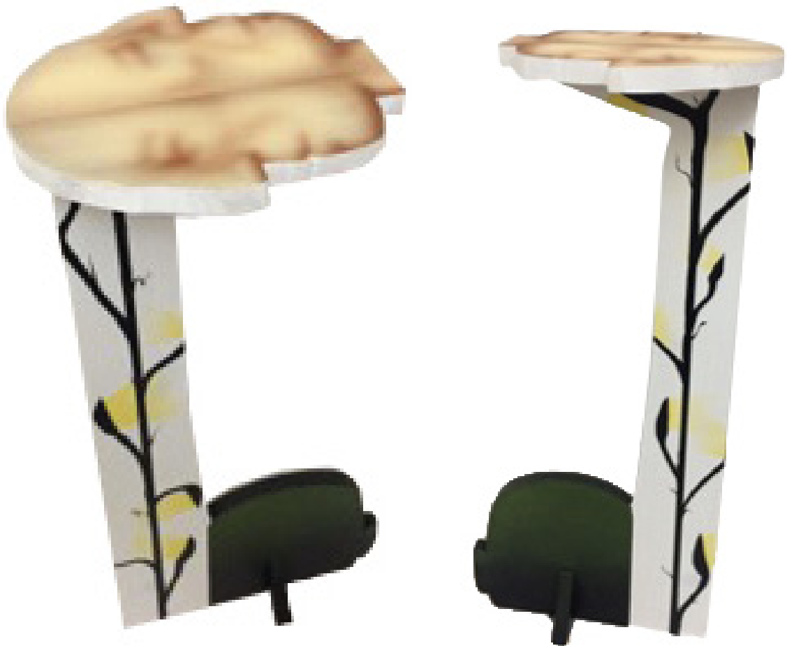
Light plant / Janiform, 2019 Acrylic on wood 69.5 × 24.5 × 22 cm