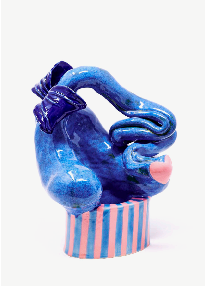
Squeeze Me Tightly , 2022 Ceramic glazed stoneware 25 × 21 × 22 cm