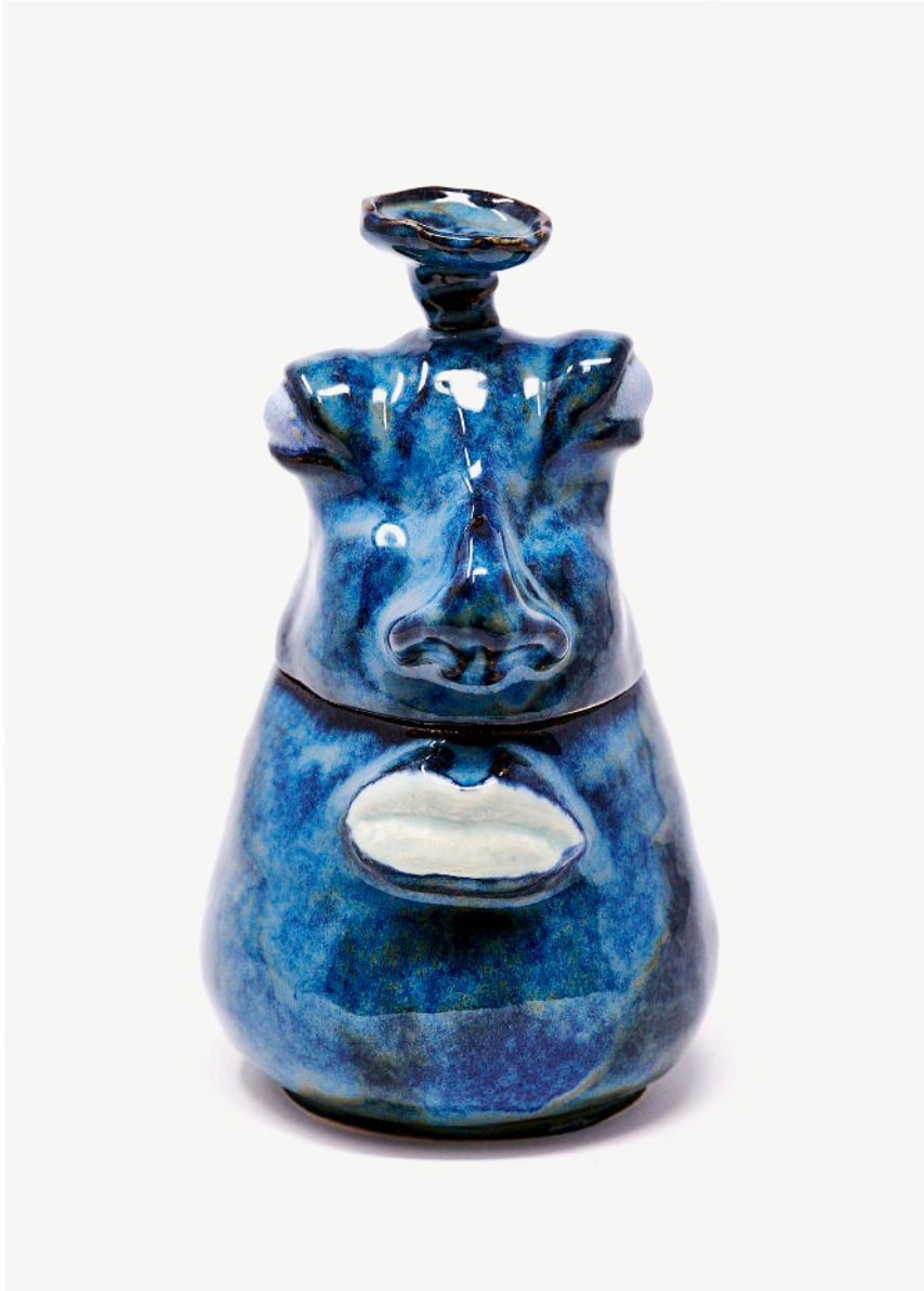
Napoleon's Jar, 2022 Ceramic glazed stoneware 17 x 33 cm (h x circumference)