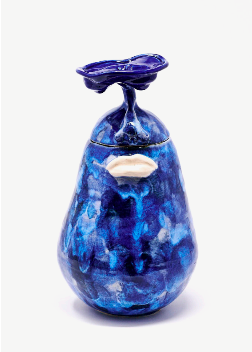
Light Headed, 2022 Ceramic glazed stoneware 27 x 49.5 cm (h x circumference)