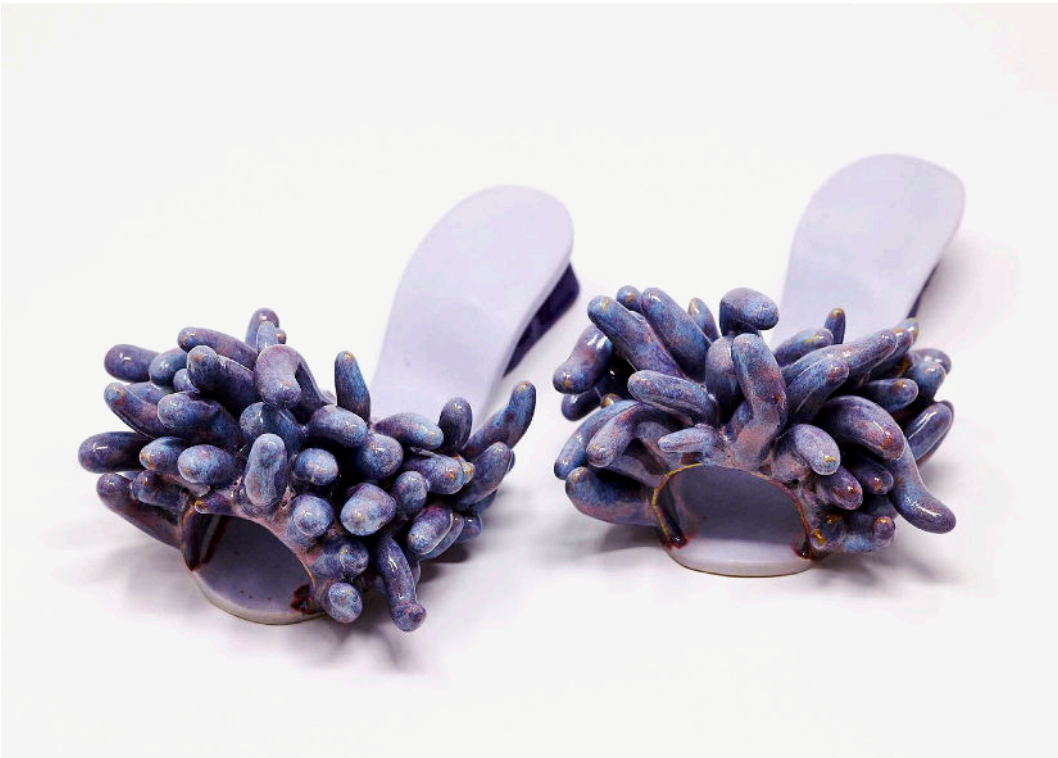
Repeat Steps, 2022 Ceramic glazed stoneware 10 × 13 × 21 cm