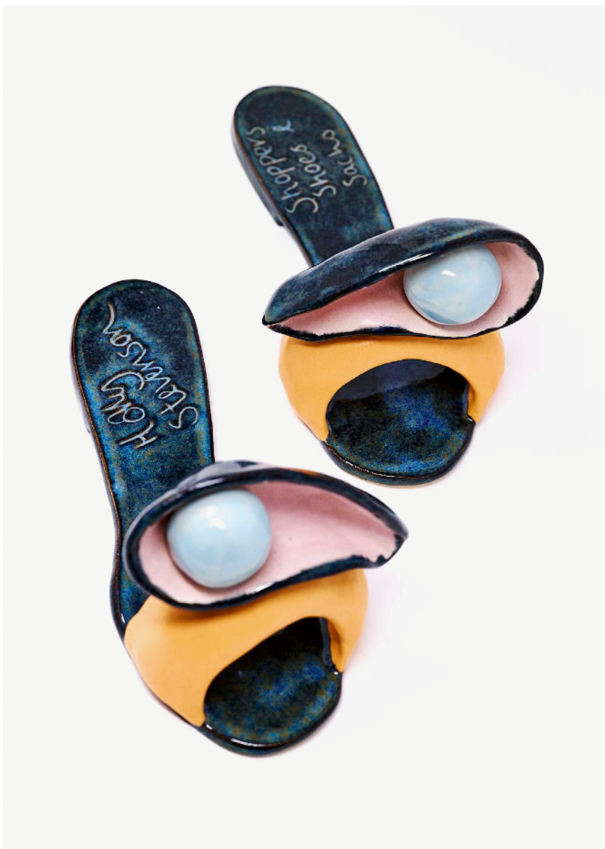
Shell-eye-ders , 2022 Ceramic glazed stoneware 9 × 10 × 22 cm