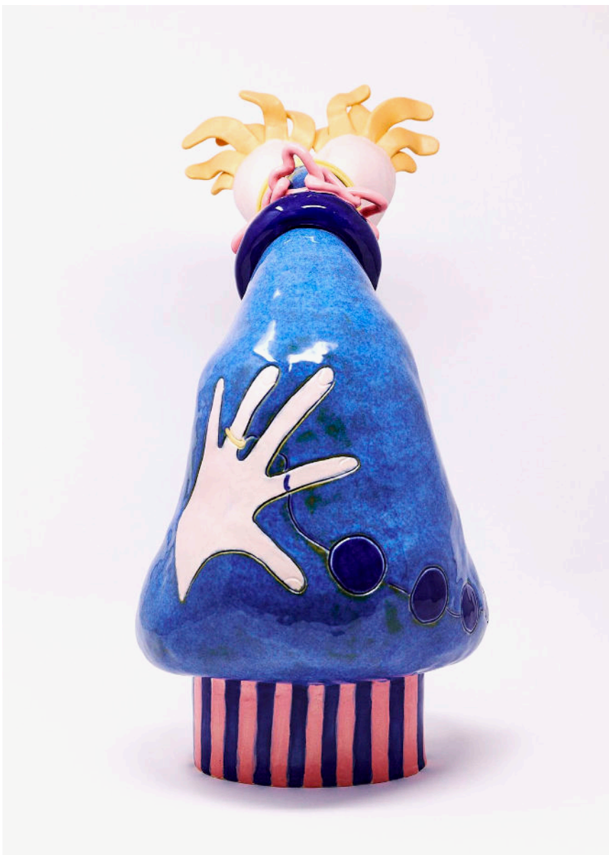
Dear Flaming Heart , 2022 Ceramic glazed stoneware 37 x 20 x 30 cm