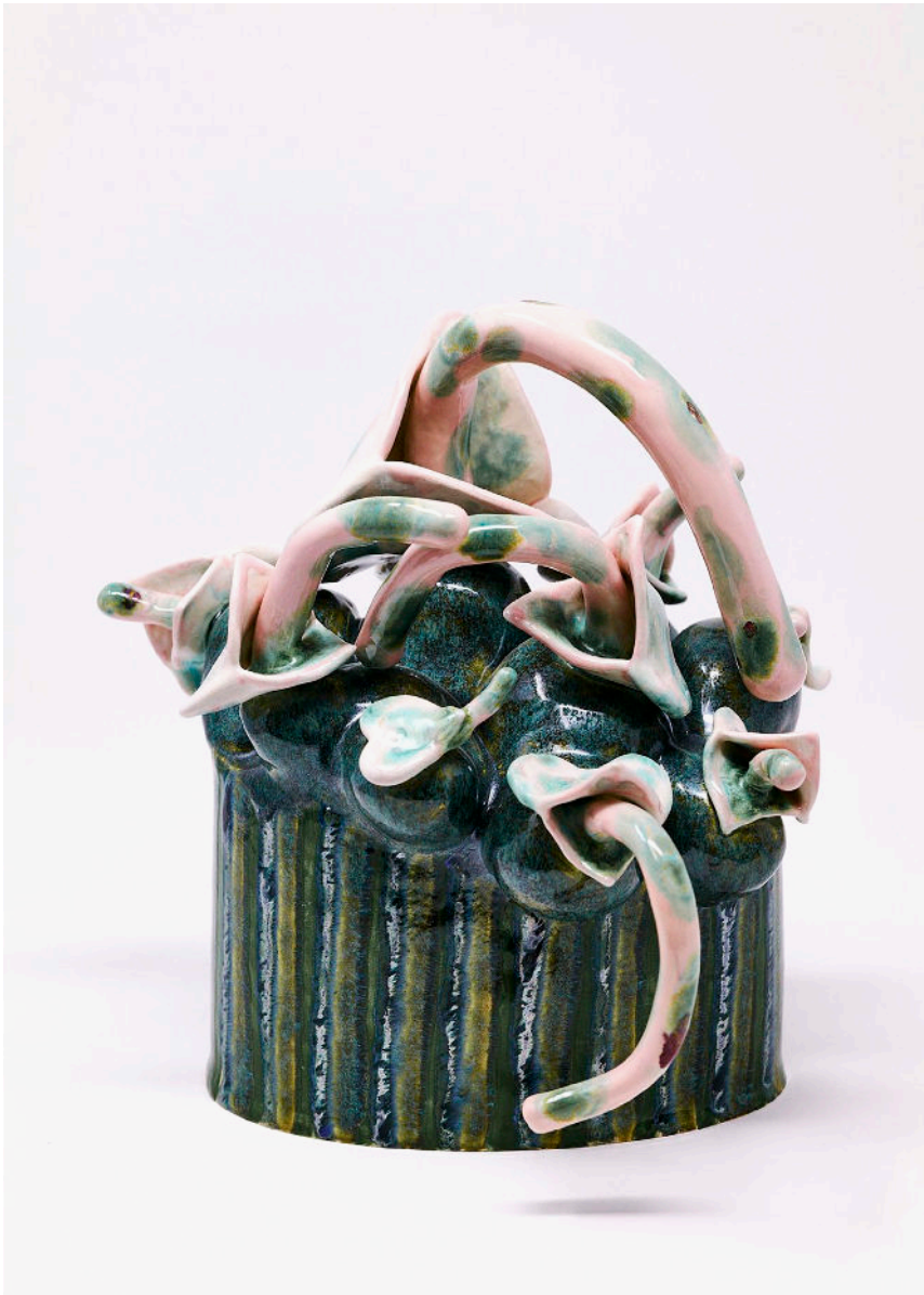
Best Wishes , 2019-20 Ceramic glazed stoneware 24 × 17 × 20 cm