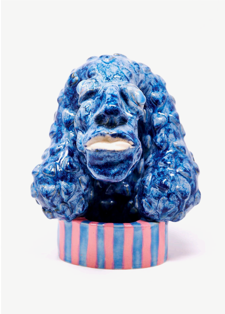
I Love this Old Cardigan, 2022 Ceramic glazed stoneware 20 × 17 × 19 cm