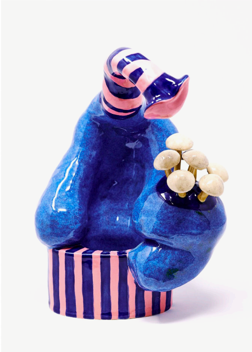
Sprung Sleeve , 2022 Ceramic glazed stoneware 28 × 20 × 21 cm