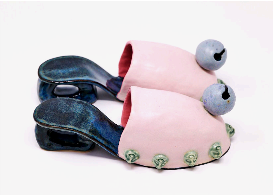
Ting-a-ling , 2022 Ceramic glazed stoneware 5.5 × 7 × 20.5 cm