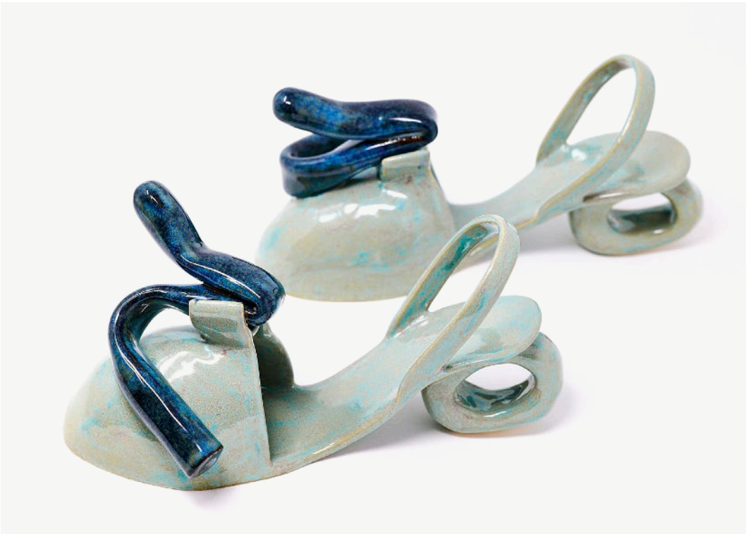
Buckled, 2022 Ceramic glazed stoneware 10 × 9.5 × 21 cm