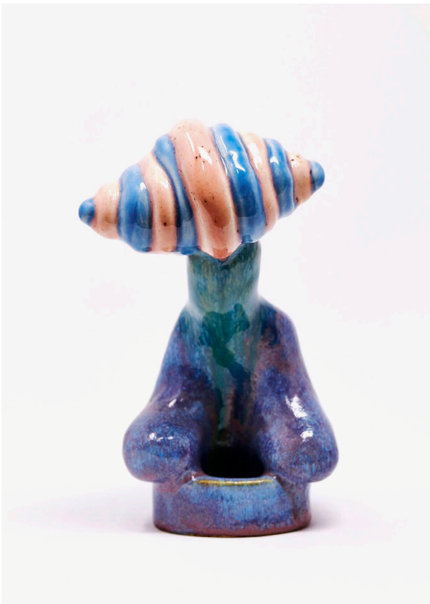
Maggot Head Maquette, 2022 Ceramic glazed stoneware 17 × 10 × 8 cm