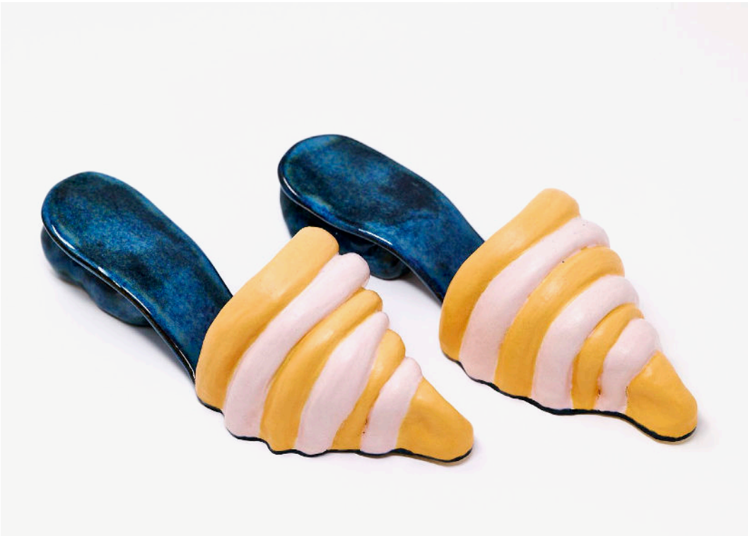
Pantofle, 2022 Ceramic glazed stoneware 7.5 × 9.5 × 22 cm