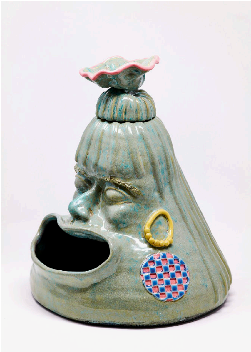
Stick , 2022 Ceramic glazed stoneware 32 x 87 cm (h x circumference)