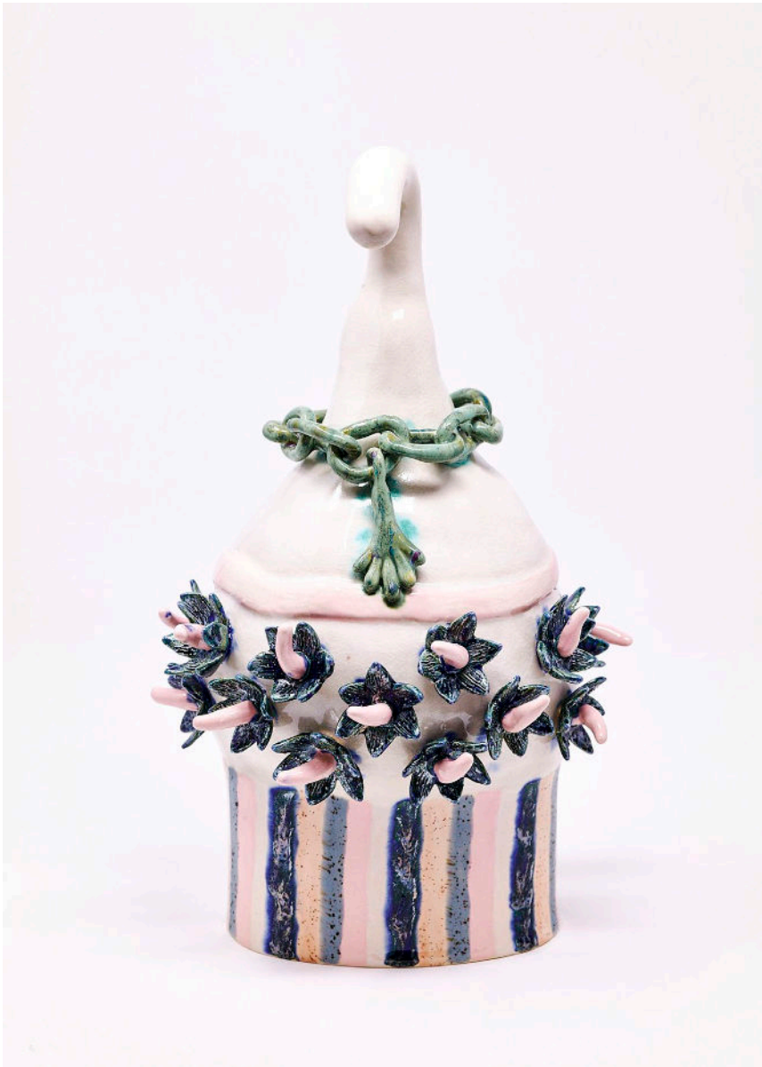
Bloom , 2020 Ceramic glazed stoneware 32 × 19 × 12 cm