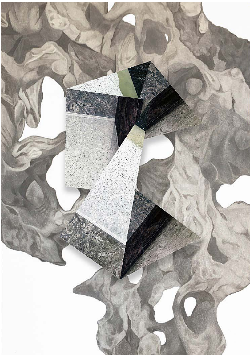
Untitled 03, from the series A Scholar's Rock, 2022

Hand-drawn coloured pencil drawing on matt paper, with collaged folded C-Type print 297 × 210 mm