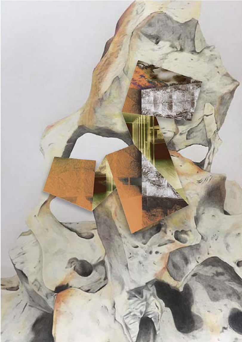
Untitled 06, from the series A Scholar's Rock, 2022

Hand-drawn coloured pencil drawing on matt paper, with collaged folded C-Type print 420 × 297 mm