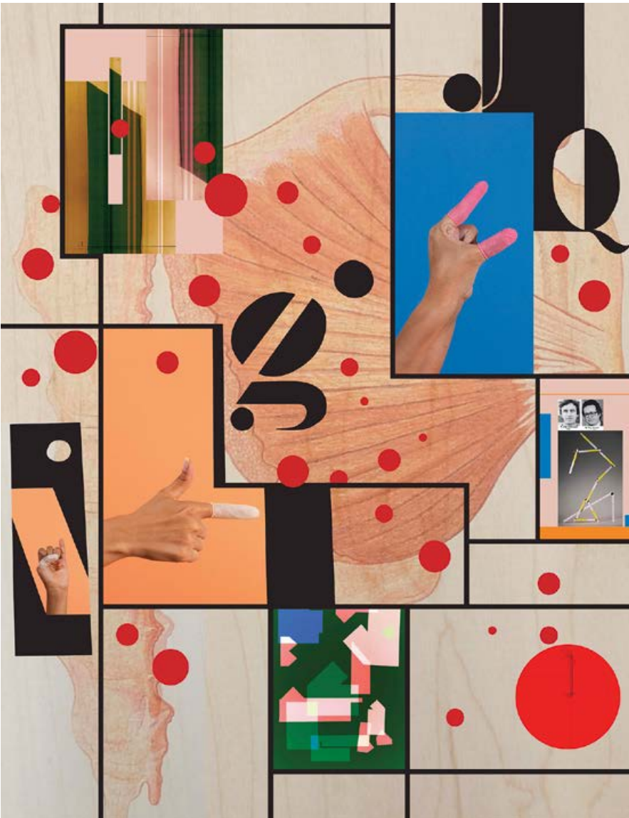
Untitled 02, from the series Tensed Muscles, 2021