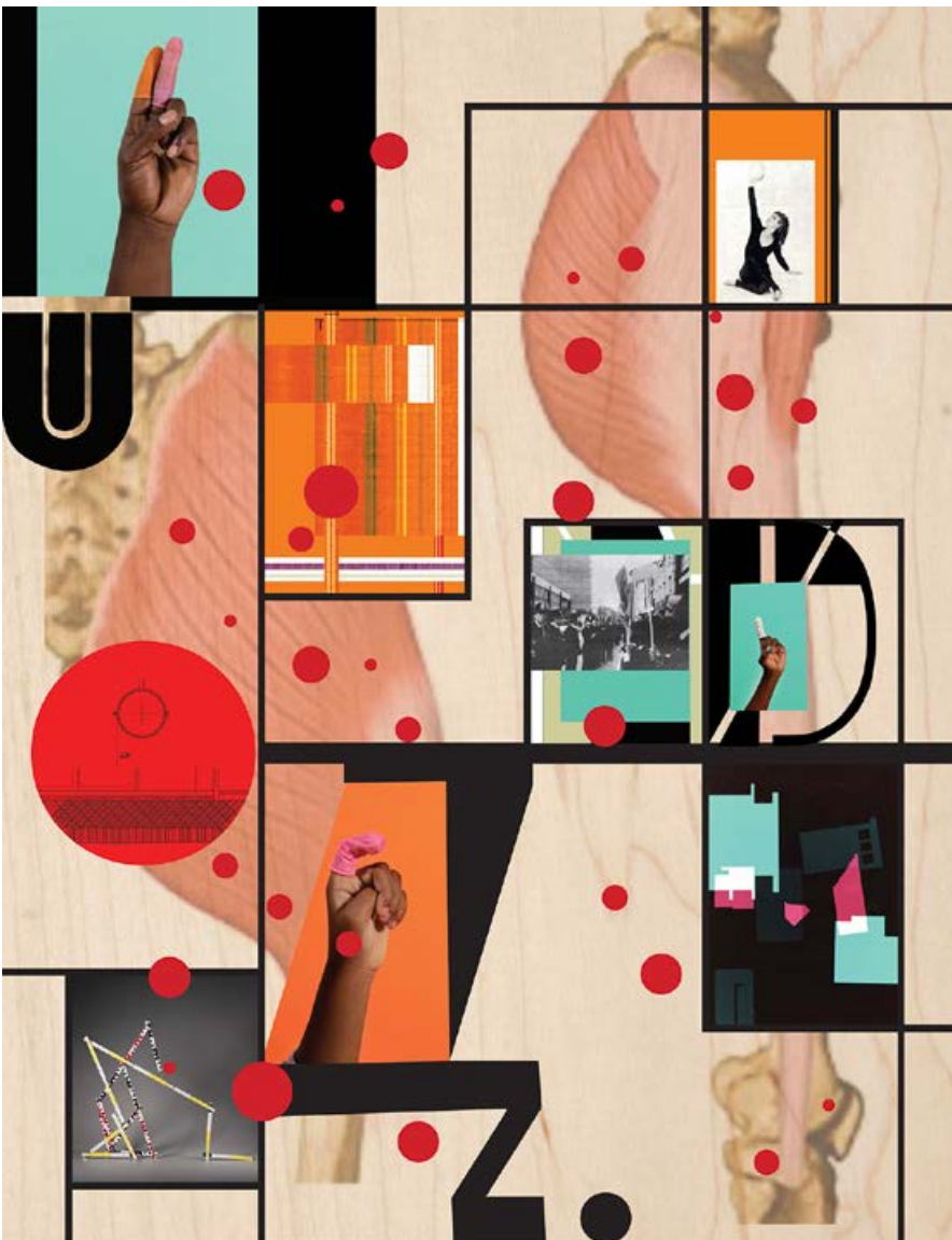
Untitled 05, from the series Tensed Muscles, 2021