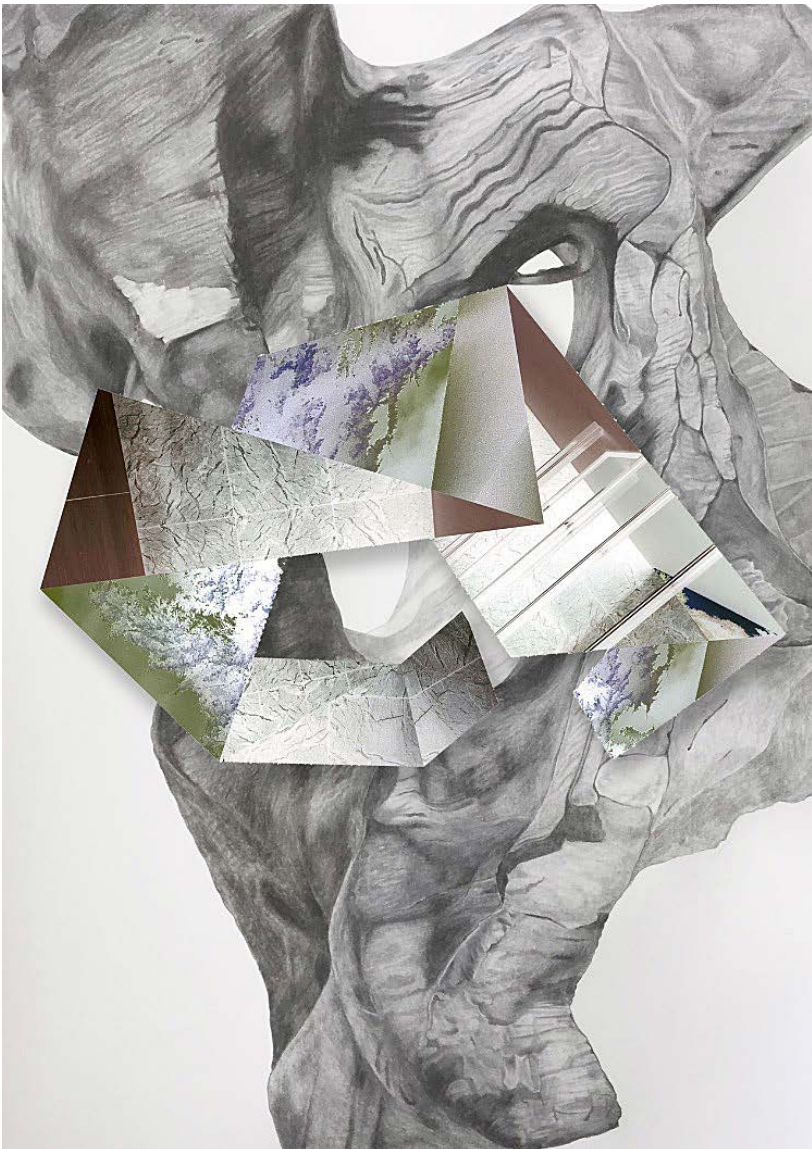
Untitled 02, from the series A Scholar's Rock, 2022

Hand-drawn coloured pencil drawing on matt paper, with collaged folded C-Type print