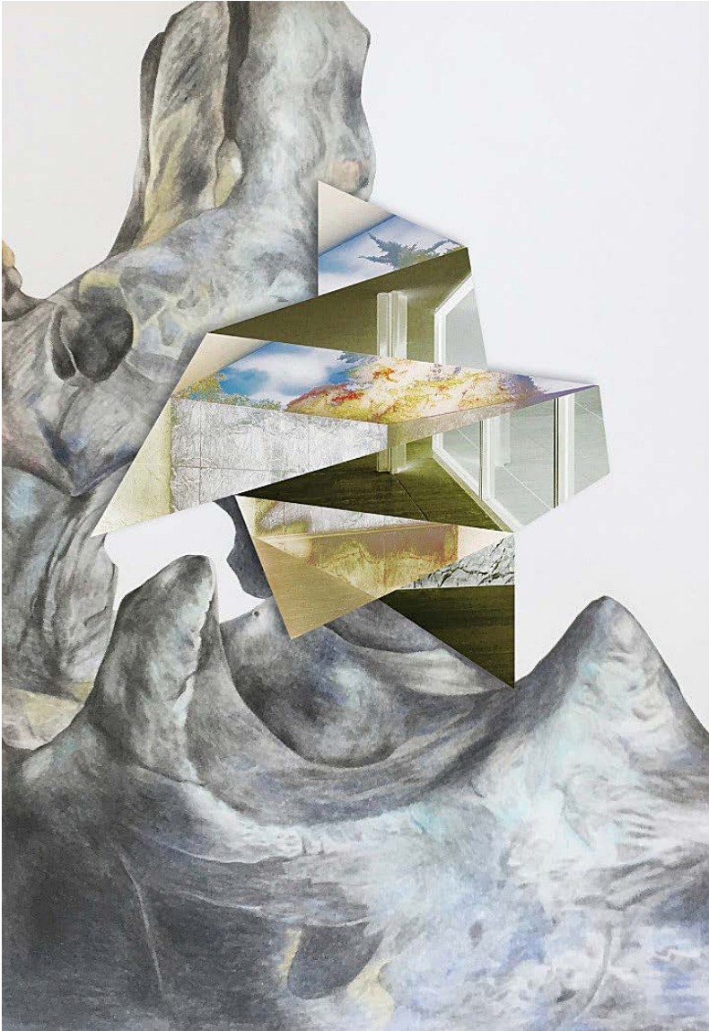
Untitled 05, from the series A Scholar's Rock, 2022

Hand-drawn coloured pencil drawing on matt paper, with collaged folded C-Type print 297 × 210 mm