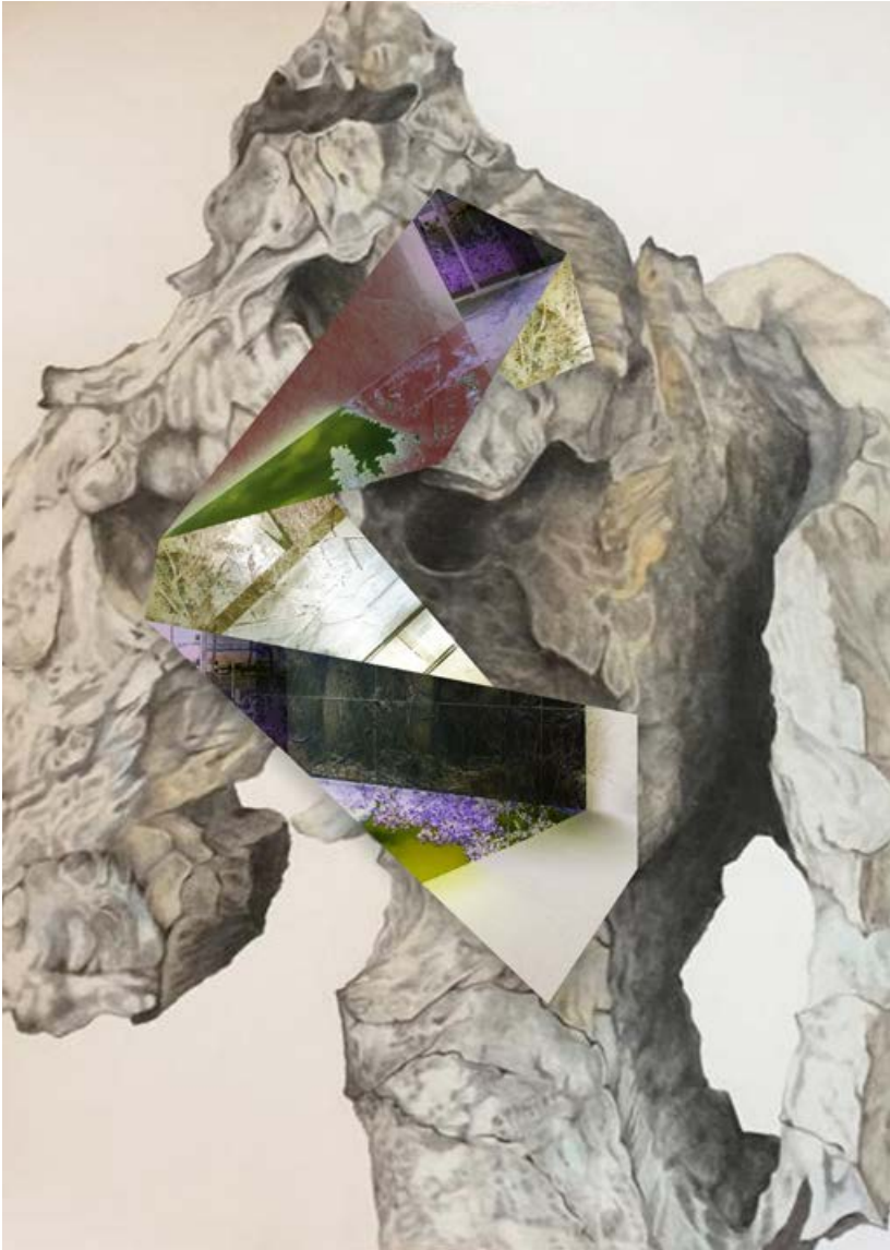
Untitled 07, from the series A Scholar's Rock, 2022

Hand-drawn coloured pencil drawing on matt paper, with collaged folded C-Type print 297 × 210 mm