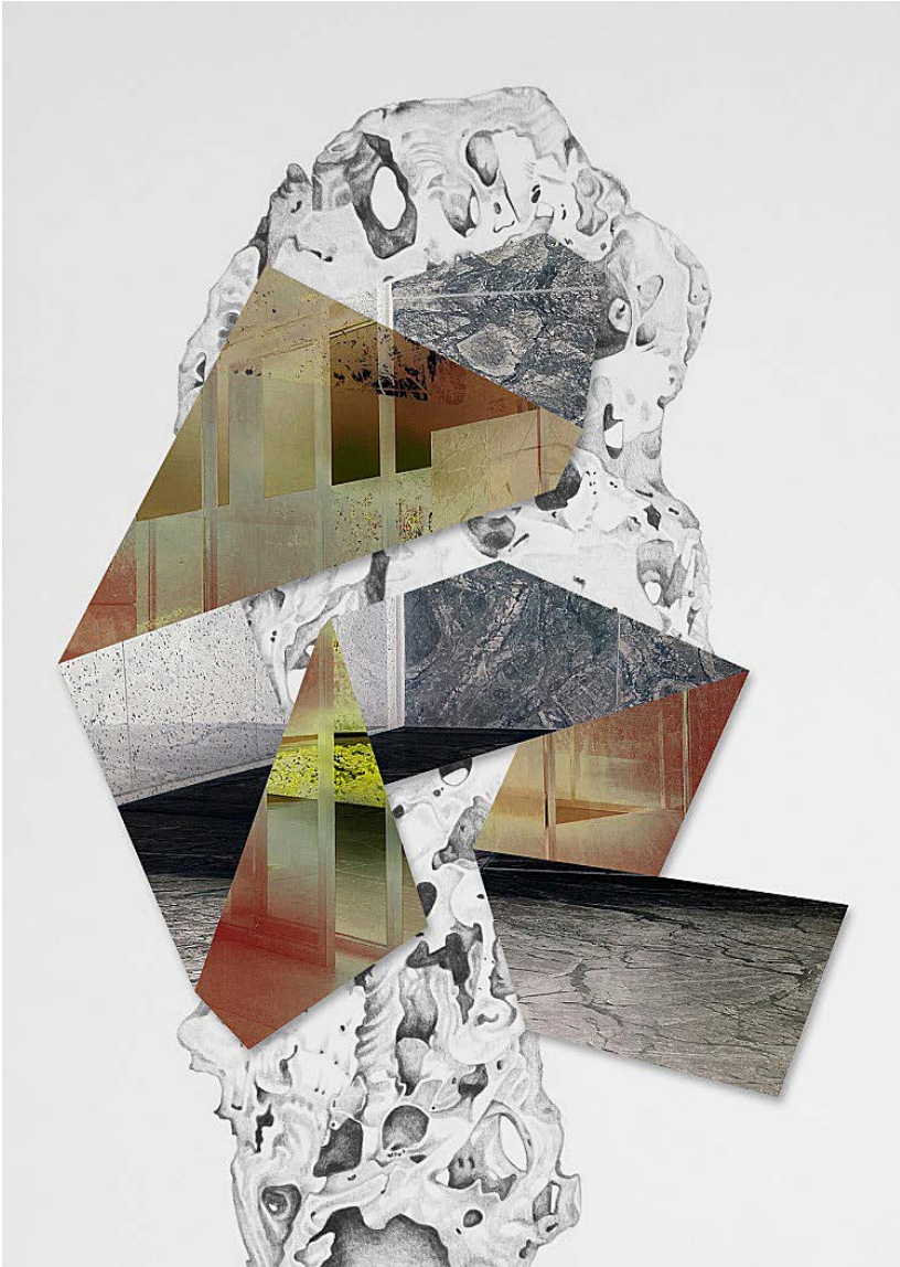
Untitled 04, from the series A Scholar's Rock, 2022

Hand-drawn coloured pencil drawing on matt paper, with collaged folded C-Type print 297 × 210 mm