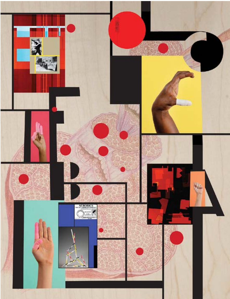
Untitled 01, from the series Tensed Muscles, 2021

Hand-drawn coloured pencil drawing on plywood, with collaged C-Type prints 1385 × 1065 mm Unique, with 1 AP