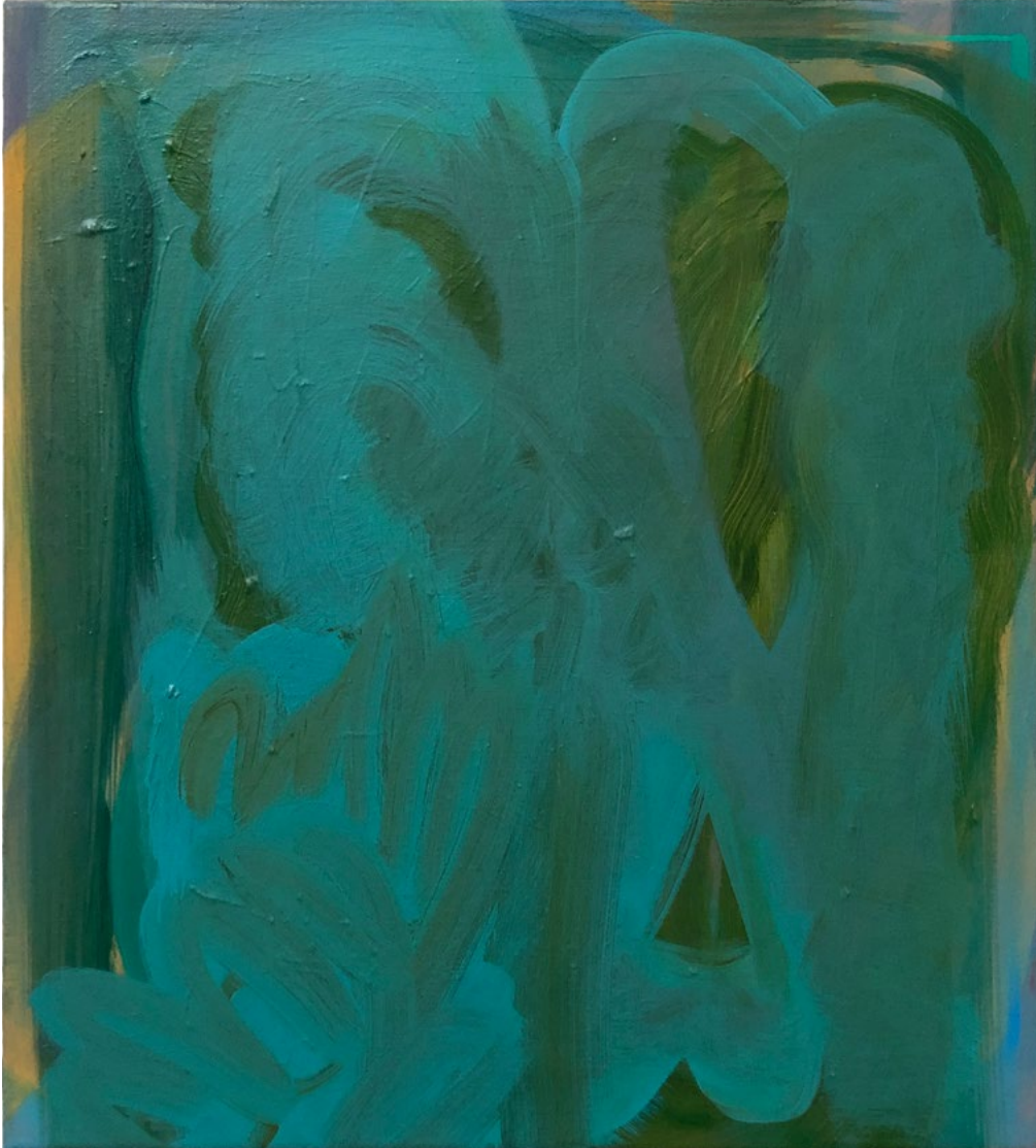
Sunyoung Hwang Seaweed , 2021 Acrylic and oil on canvas 61.5 × 56 cm