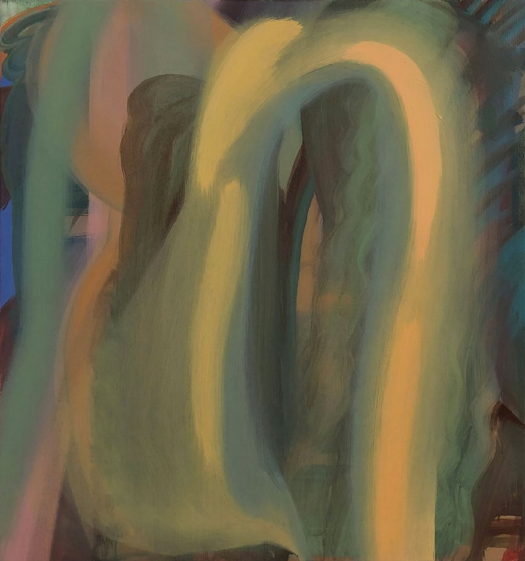
Sunyoung Hwang No Sugar for Me, Thanks , 2020 Acrylic and oil on canvas 71.5 × 66.5 cm