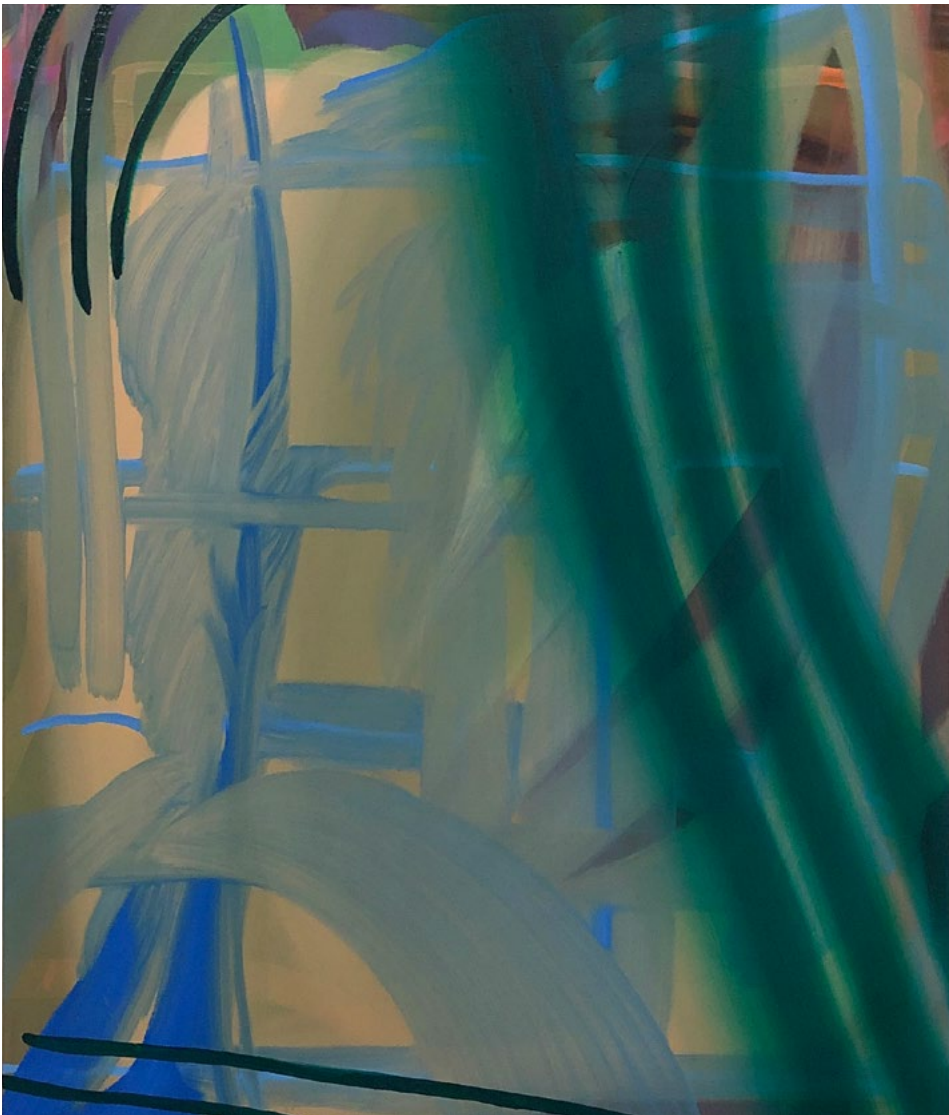
Sunyoung Hwang Her Window , 2020 Acrylic and oil on canvas 132.5 × 112 cm