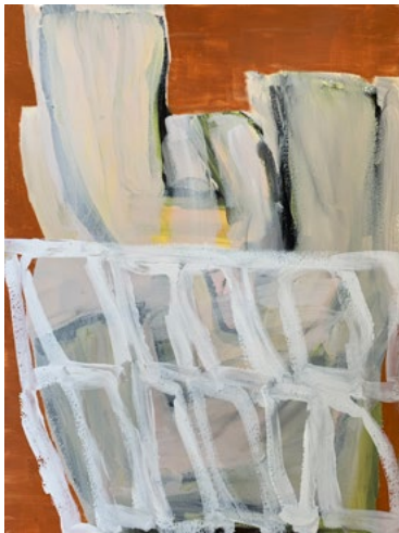
Henry Ward Three works on paper exhibited framed, 2018–2021 Acrylic on 300gsm paper 42 × 30 cm each approx.