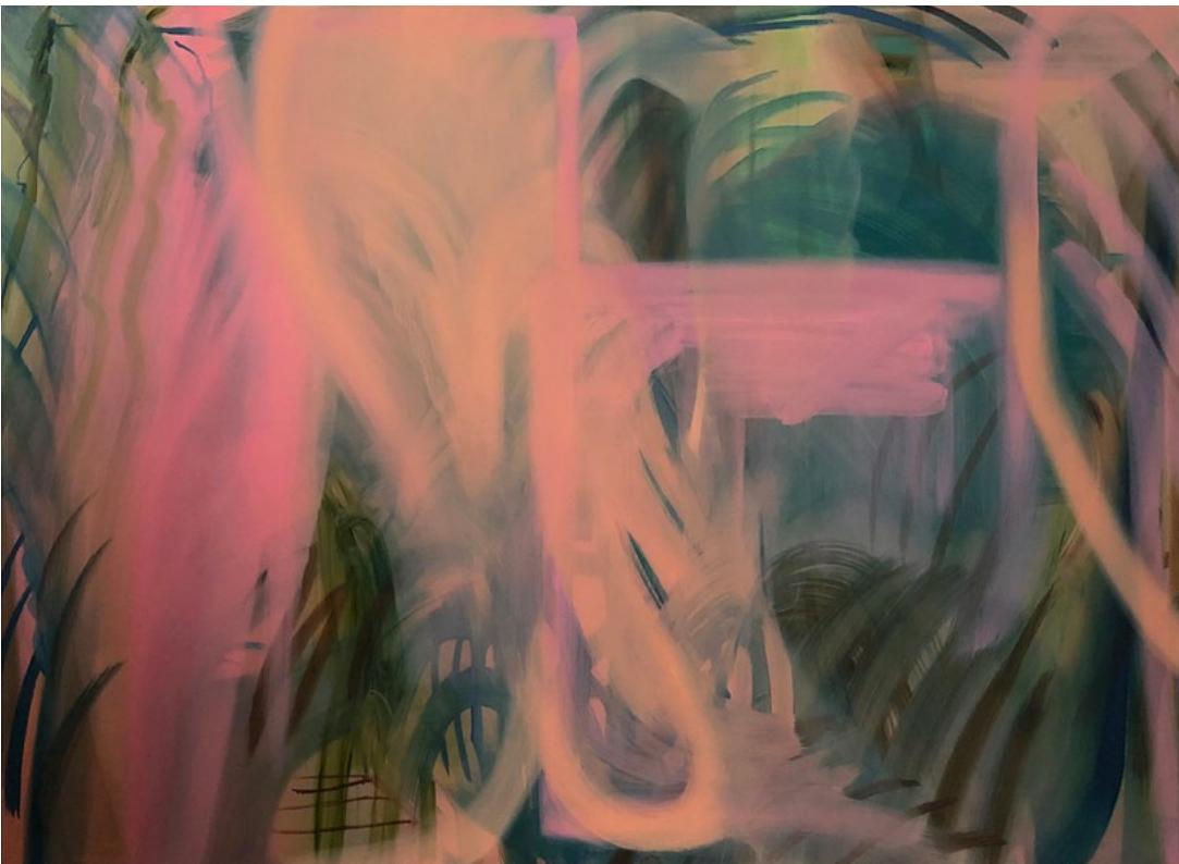
Sunyoung Hwang Swimming Backwards , 2021 Acrylic and oil on canvas 150 × 205 cm