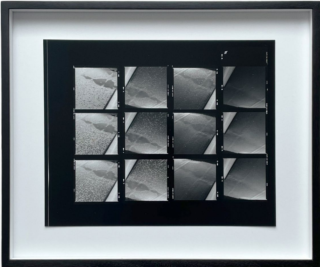
Rooftop Looking, 2021 Contact sheet (black and white darkroom print) 25 × 35 cm (framed) Edition of 5