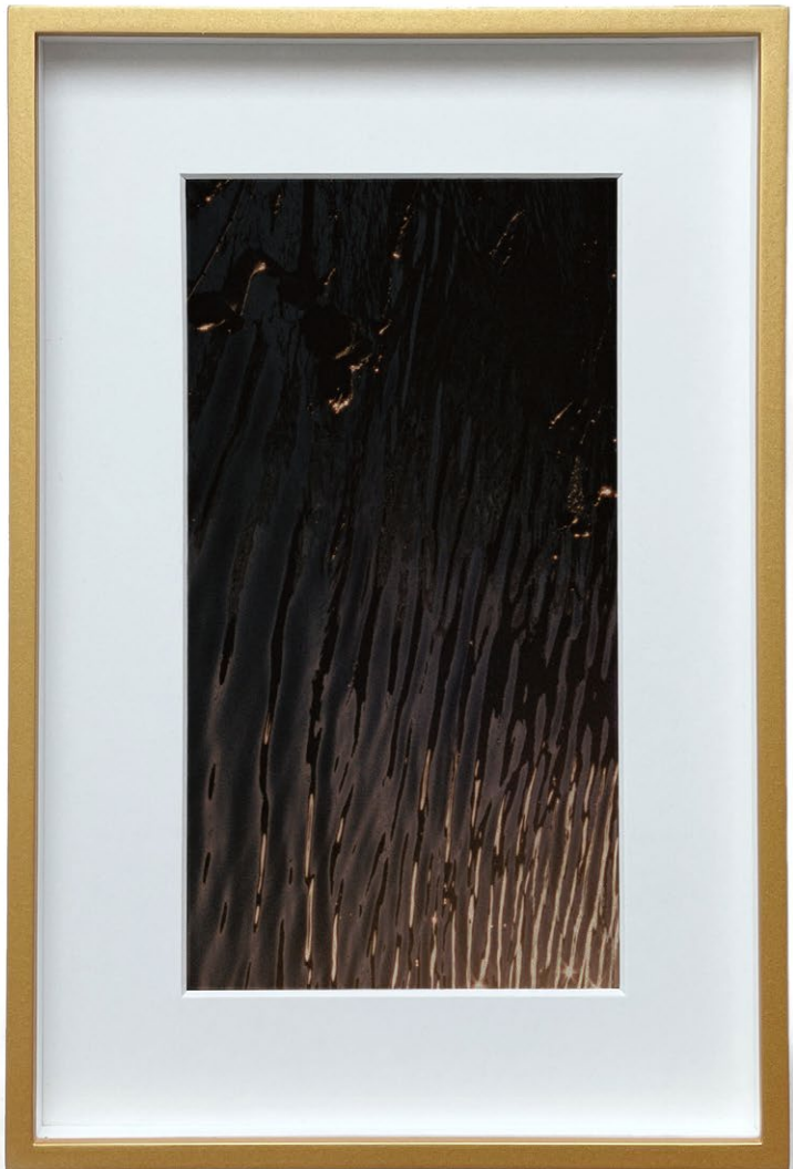
Yorkshire Nocturne, 2021 Unique colour photograph 30 × 20 cm (framed)