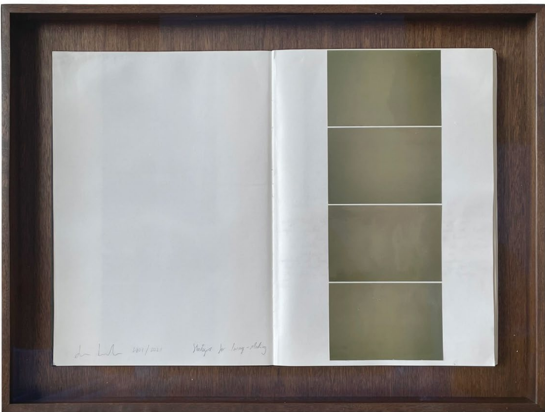
Strategies for Image Making, 2001 / 2021