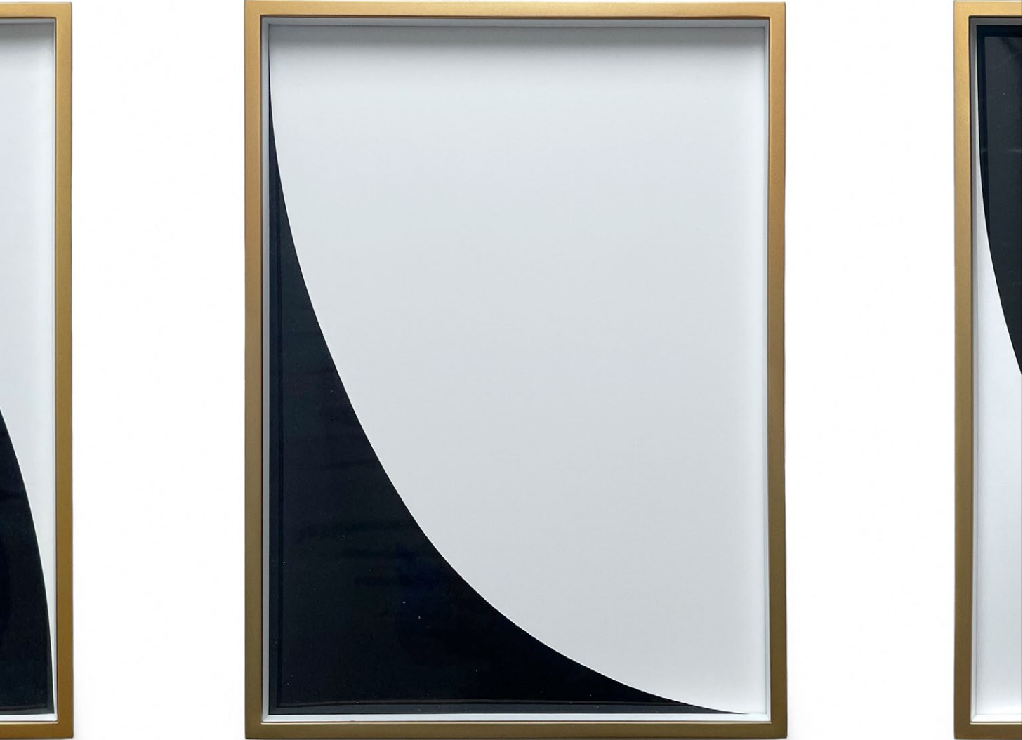
Nocturne #2, 2021 Unique colour photograph 33 × 45 cm (framed)