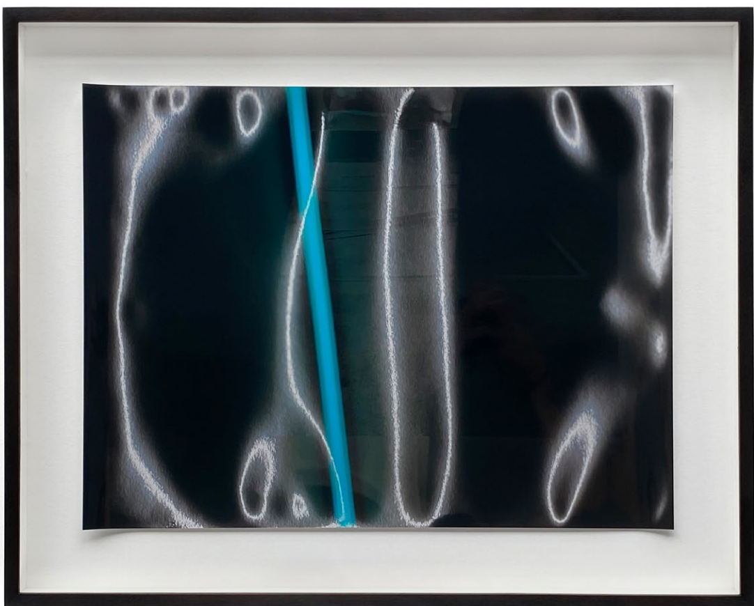
Bathers , 2021 Colour photograph 40 × 50 cm (framed) Edition of 10