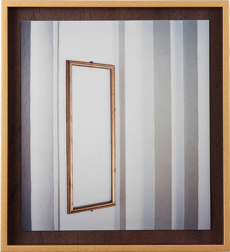
Rosso Teatro , 2014 Colour photograph 32 × 32 cm (framed) Edition 4 of 5