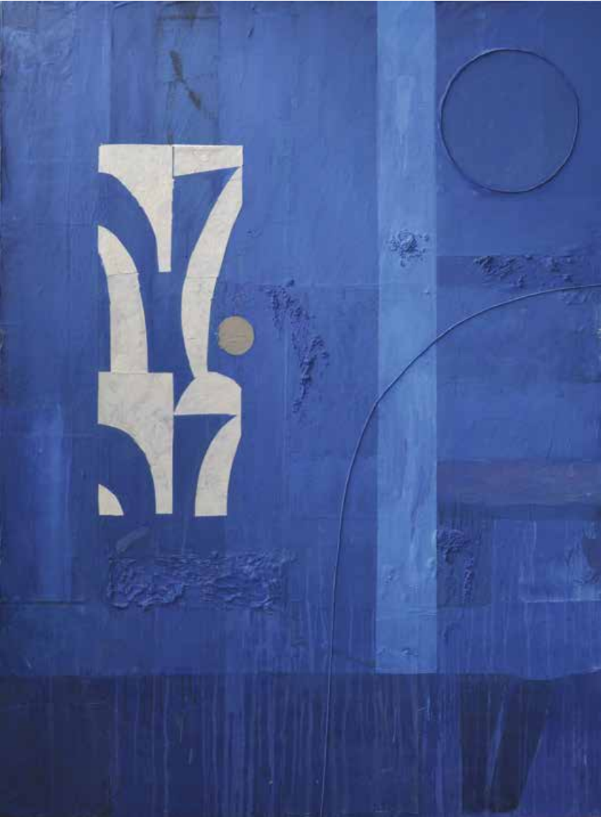
Nick Jensen Tranquillize , 2017 Mixed media on canvas 140 × 190 cm