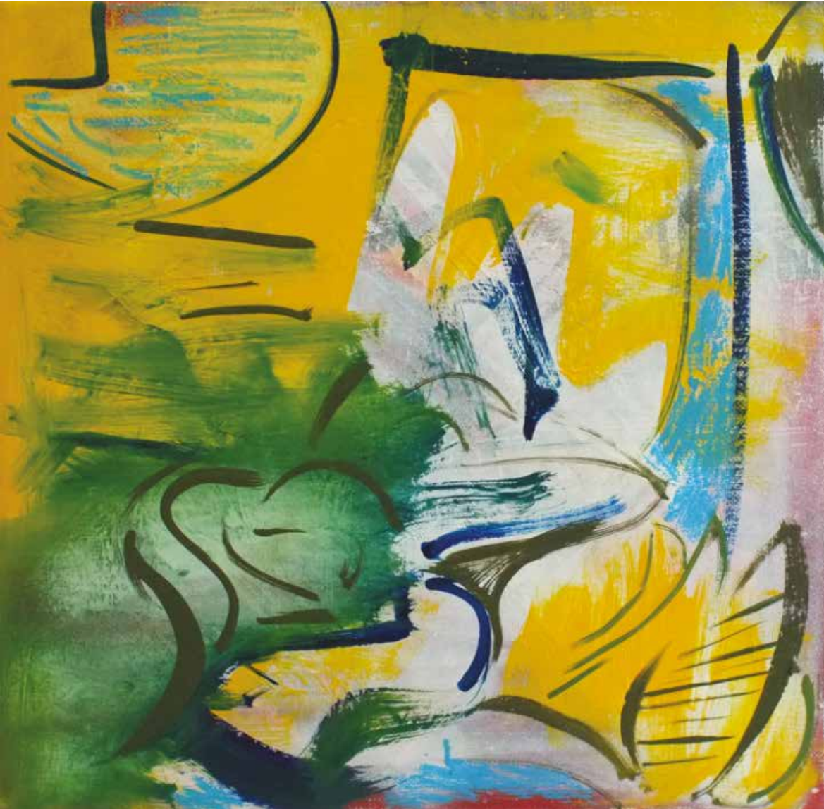
Adam Hedley The Beeches , 2017 Oil, spray paint and oil stick on canvas 30 × 30 cm