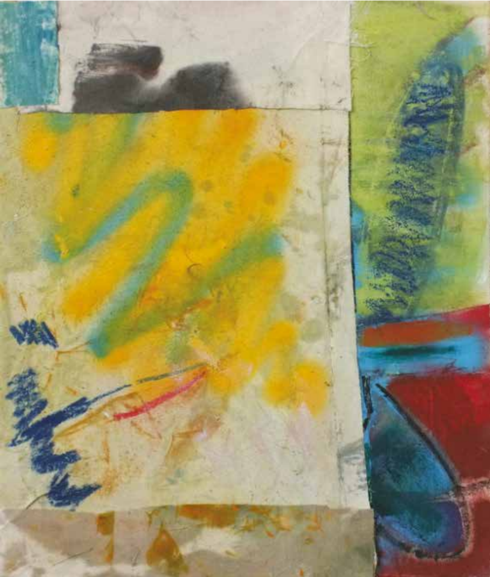
Adam Hedley Endless things Growing , 2017 Oil, spray paint and collaged calico on board 38 × 31.5 cm