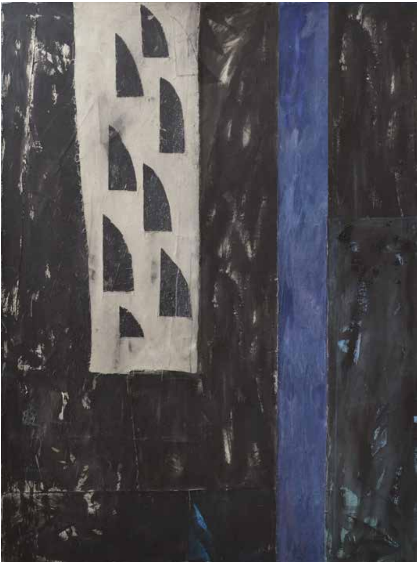
Nick Jensen Turns on the Tarmac , 2017 Mixed media on canvas 140 × 190 cm