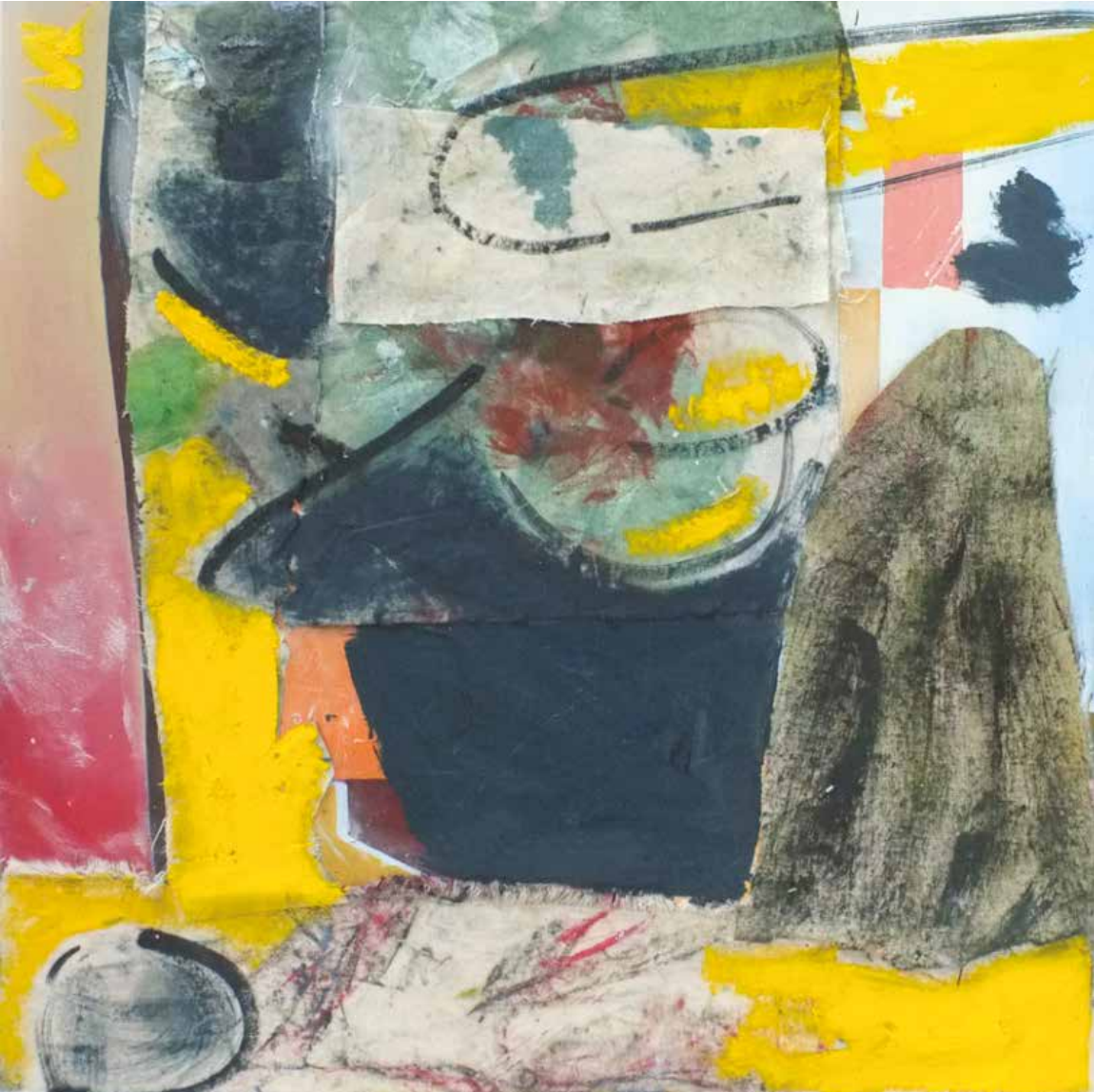
Adam Hedley Druids Rock , 2017 Oil and collaged calico on board 30 x 30 cm