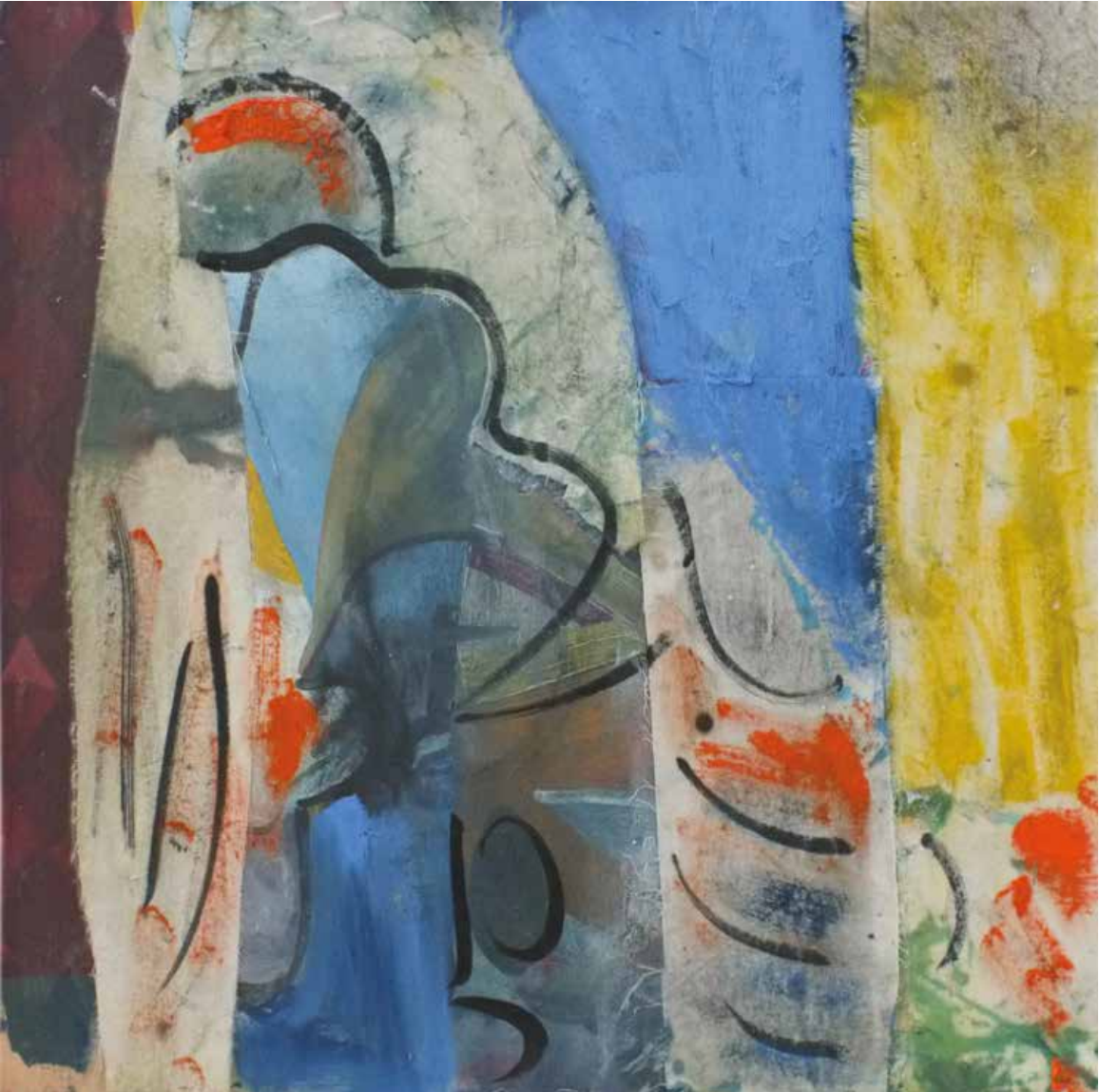
Adam Hedley Talkin' like you , 2017 Oil, spray paint and collaged calico on board 30 x 30 cm