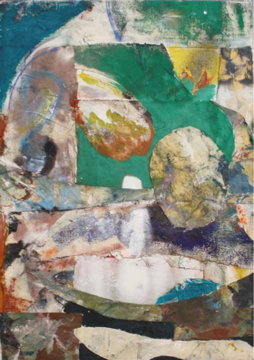
Adam Hedley Waterwheel , 2017 Oil, spray paint, oil stick and calico on plywood 42 x 30 cm