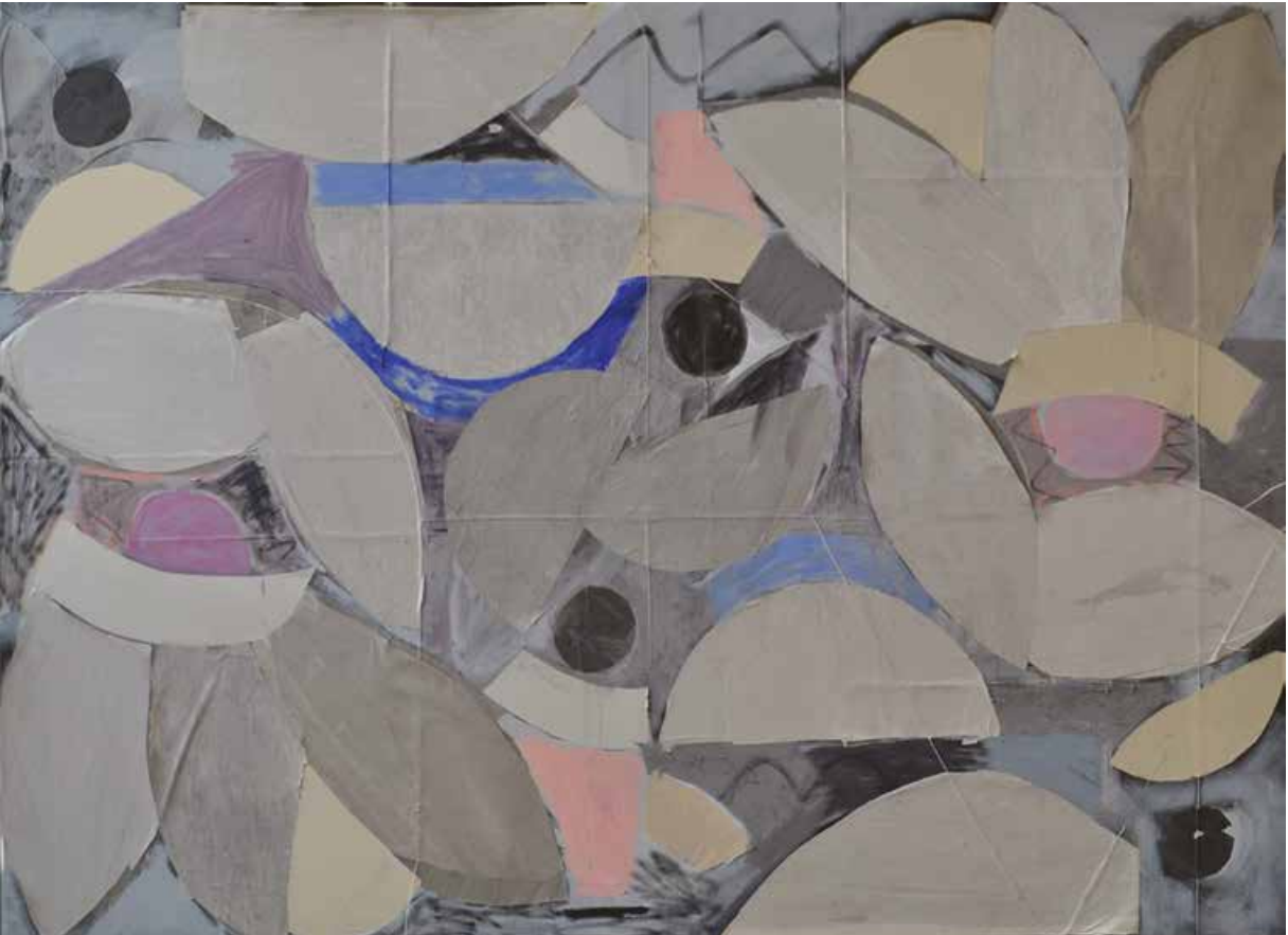
Nick Jensen Mirror Image , 2016 Mixed media on canvas 205 × 150 cm