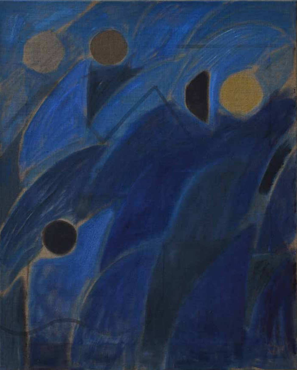
Nick Jensen Twilight , 2016 Oil, ink and crayon on unprimed linen 65 x 85 cm