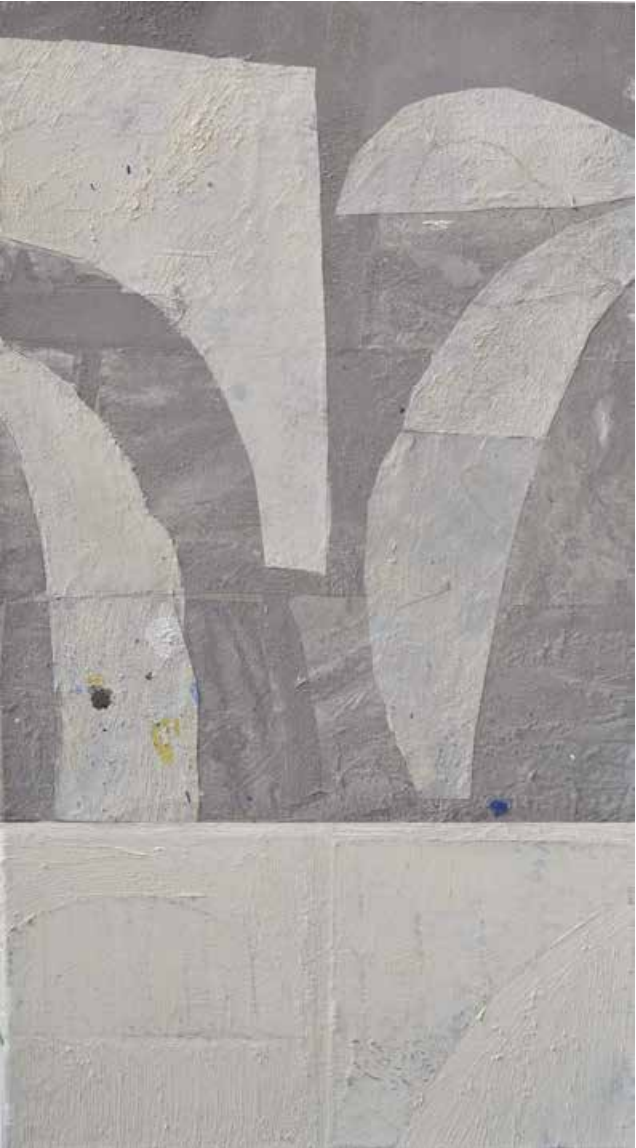
Nick Jensen Bleached out , 2017 Mixed media on canvas 35 × 61 cm