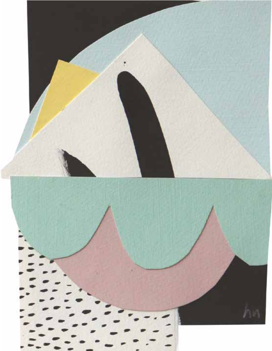
Joanne Hummel-Newell Moon Speak , 2017 Indian Ink and waterbased on St Cuthbert's Mill Waterford Saunders watercolour paper 37 × 47 cm