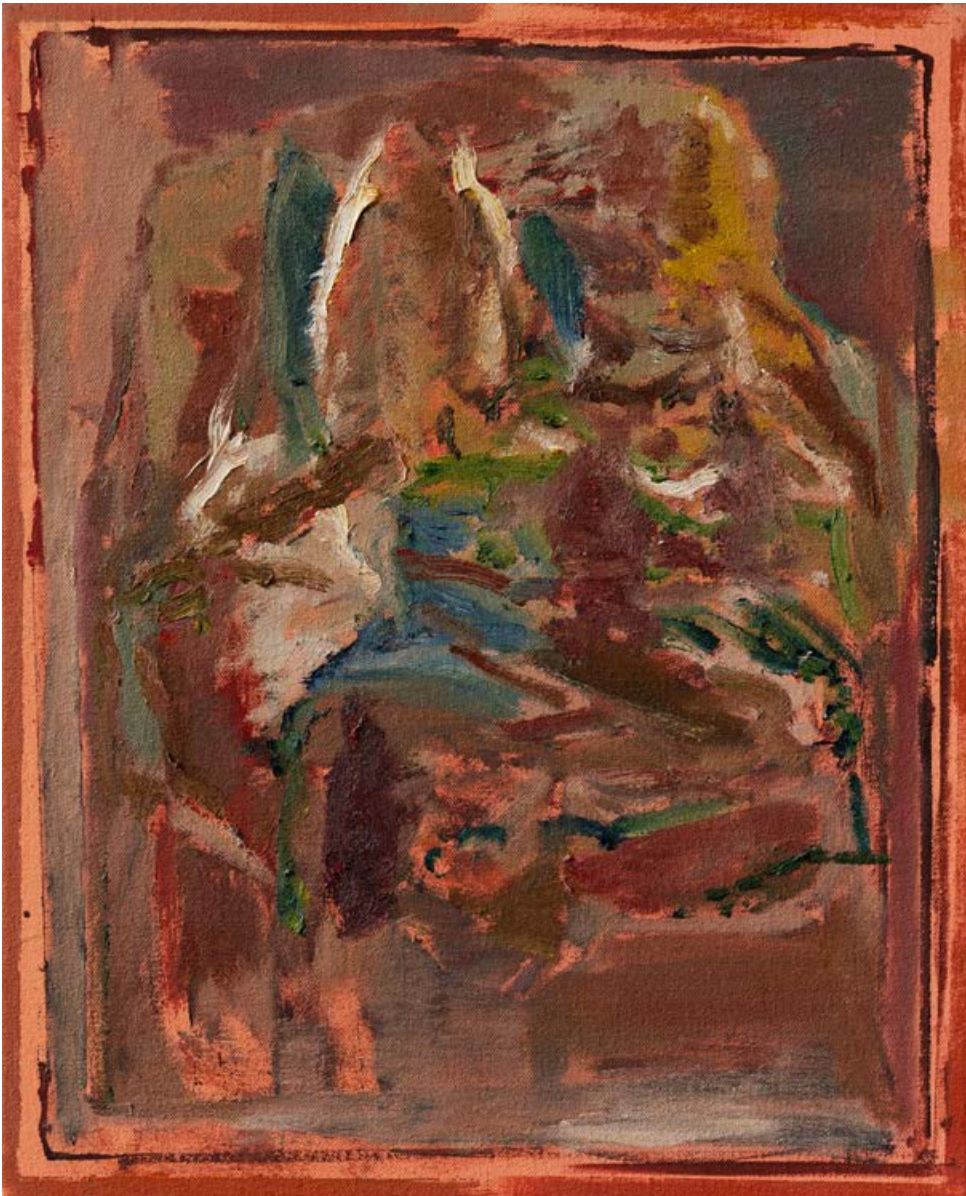
Untitled, 2023 Oil on canvas 50 × 40.5 cm