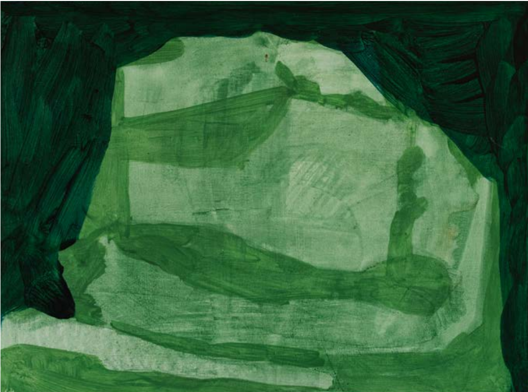
Lime Jelly , 2023 Acrylic on board 23 × 30 cm (25.2 × 33.7 cm framed)