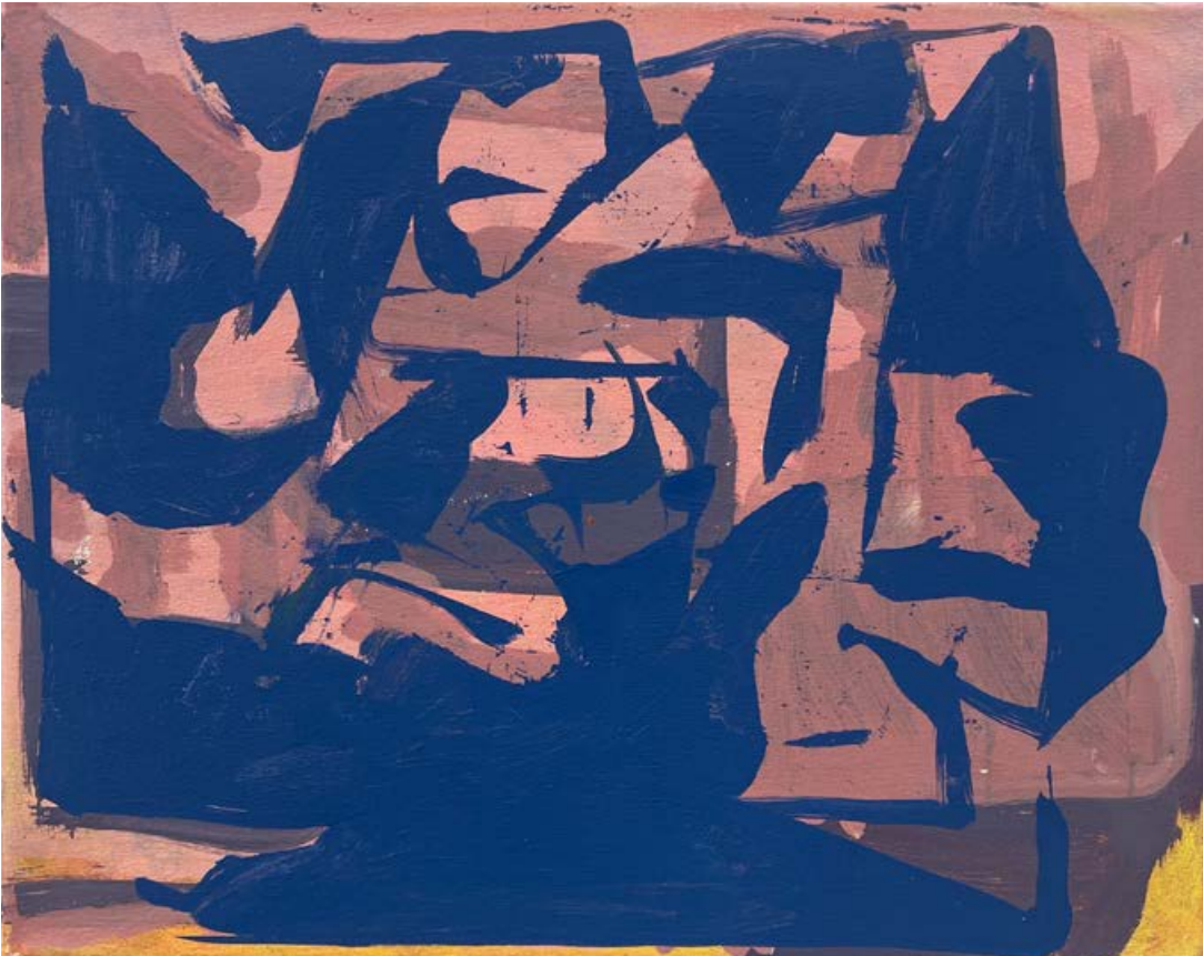
Detailed Explanation , 2017