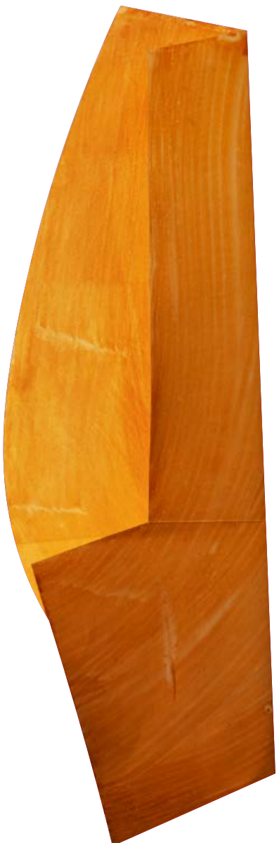
Untitled, 2022 Acrylic on paper 77 × 25 cm