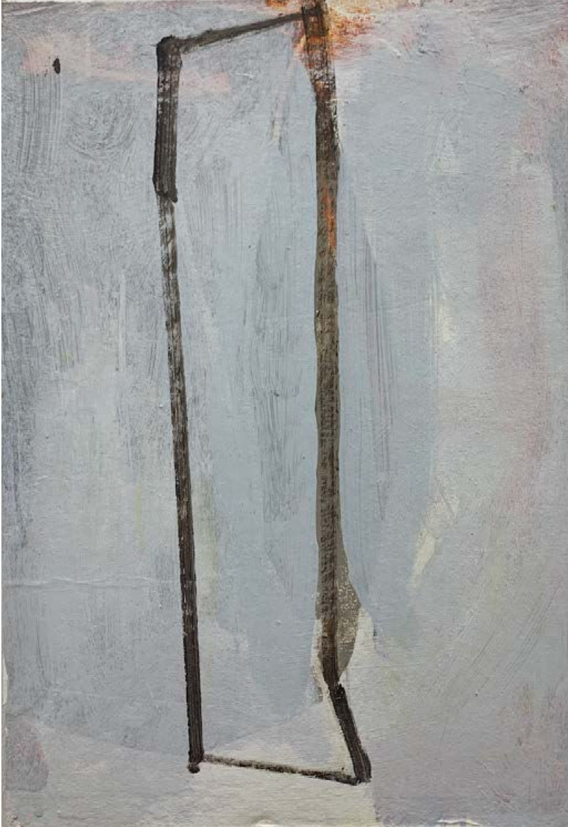
Untitled, 2012 Acrylic on gessoed card 30 × 20.5 cm