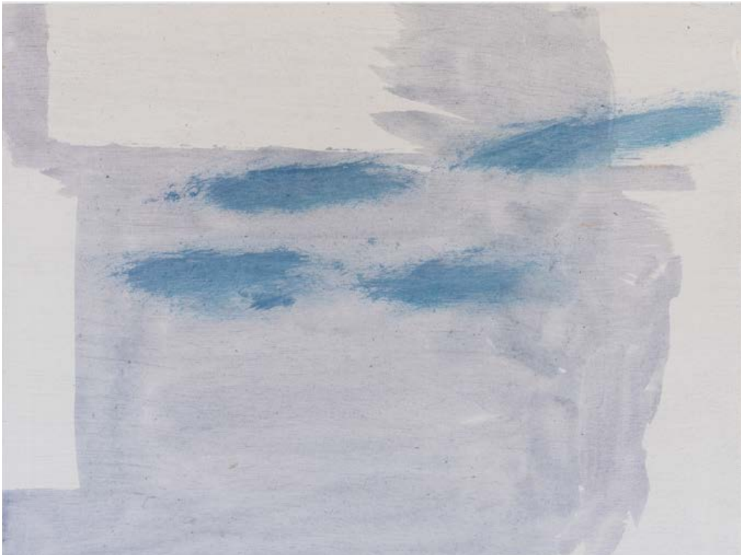
knock , 2023 Acrylic on board 23 × 30 cm (25.2 × 33.7 cm framed)