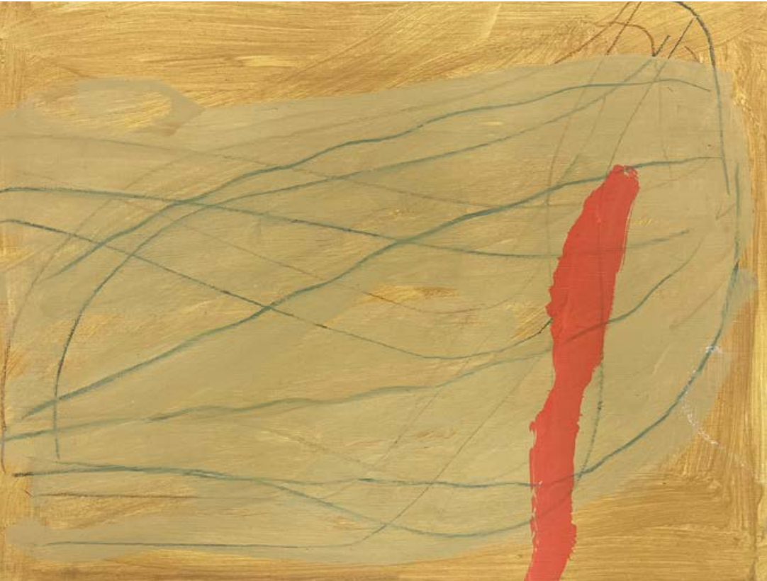
Bloooff , 2023 Acrylic and graphite on board 23 × 30 cm (25.2 × 33.7 cm framed)