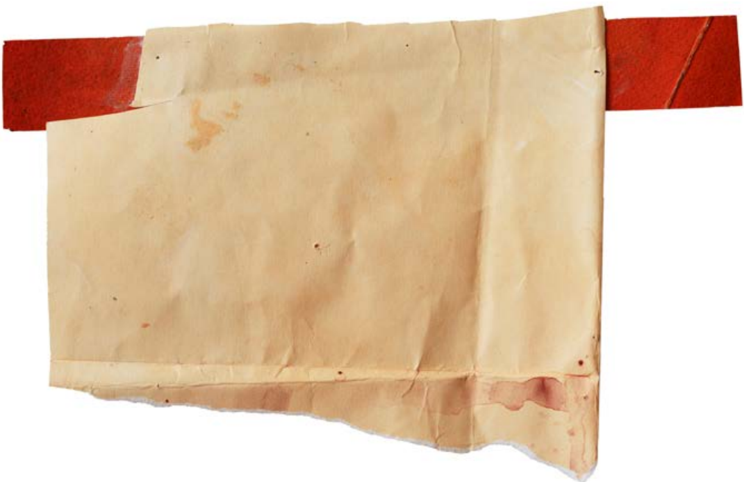
Untitled, 2023 Watercolour on paper 19 × 29 cm