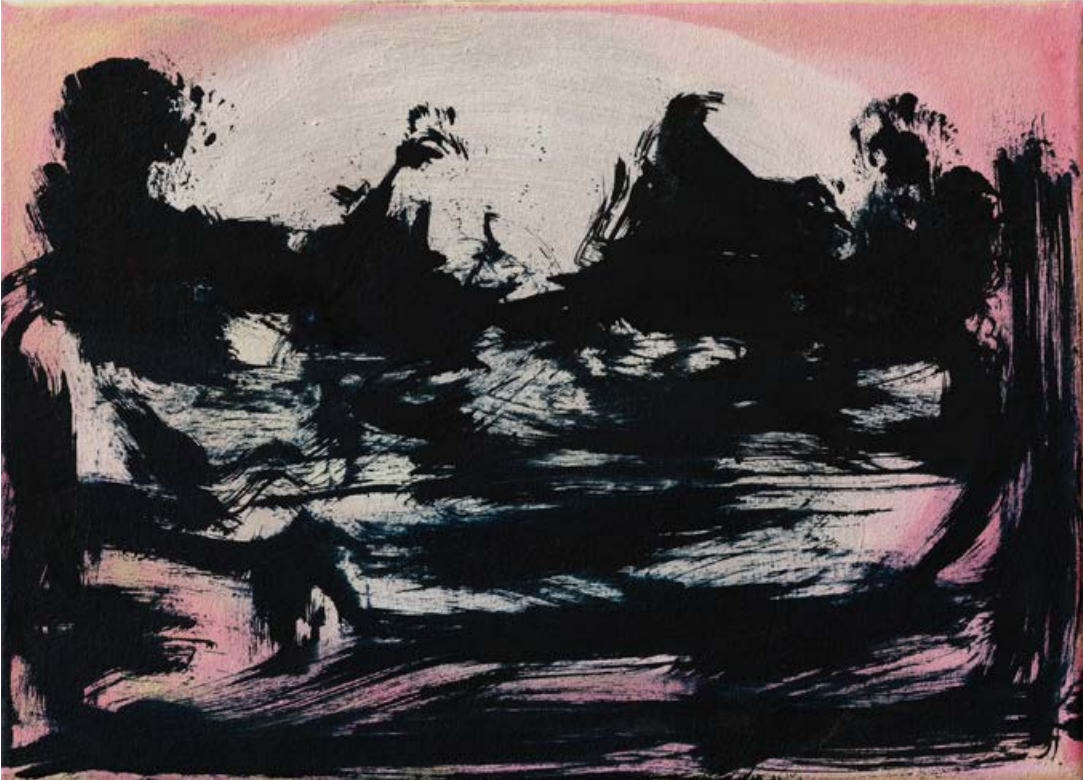
Gathering , 2021 Oil on canvas 25.5 × 35.5 cm