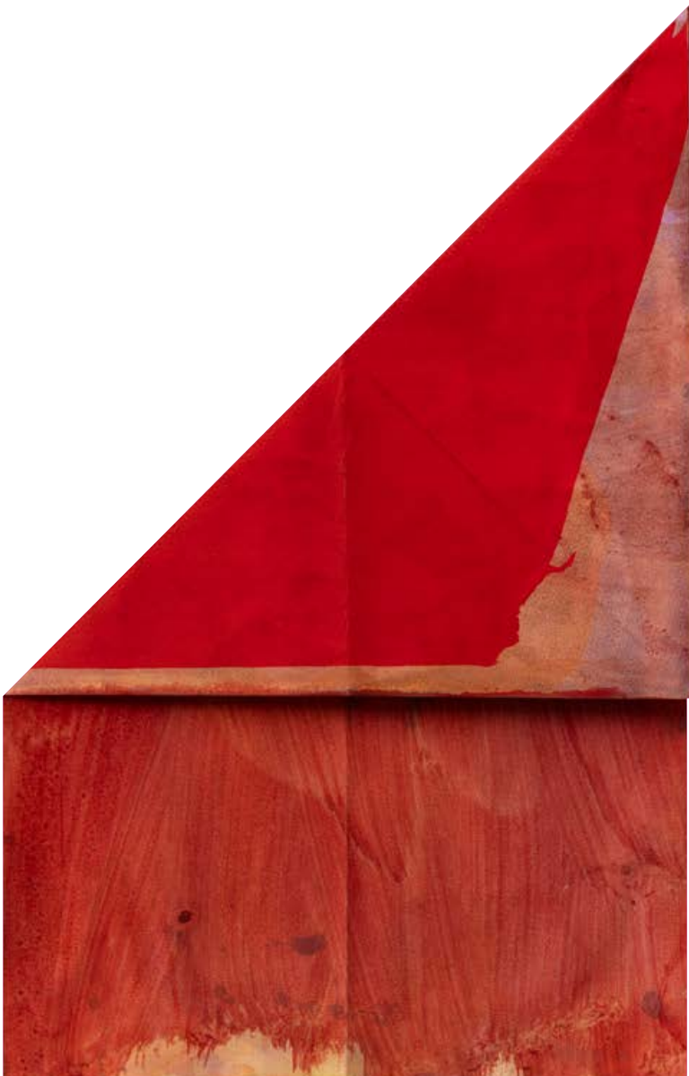
Untitled, 2023 Shellac on paper 56 × 36 cm