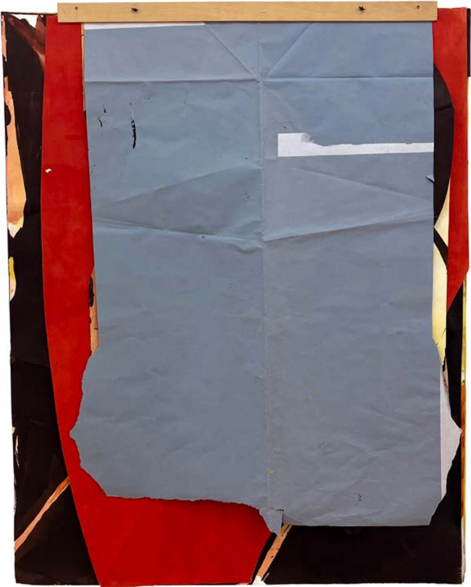
Untitled, 2019-2023 Acrylic, shellac ink, on paper 156 × 123 cm