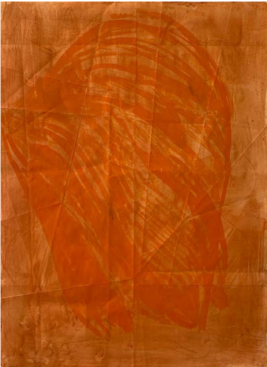
Untitled, 2012 Acrylic on paper 113.5 × 83 cm