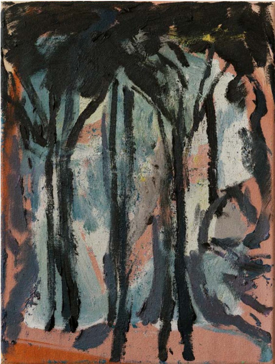
The Divide , 2023 Oil on canvas 41 x 31 cm