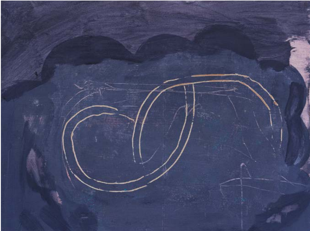
Sleep Map, 2023 Acrylic on board 23 × 30 cm (25.2 × 33.7 cm framed)