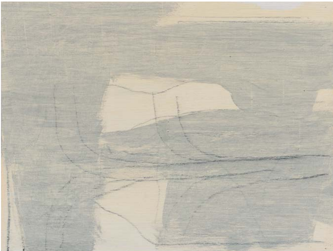
Breath, 2023 Acrylic on board 23 × 30 cm (25.2 × 33.7 cm framed)