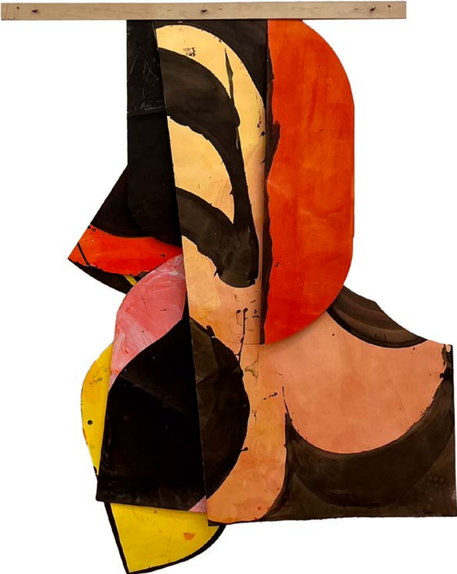
Untitled, 2019-2023 Acrylic, shellac ink, on paper 171 × 120 cm