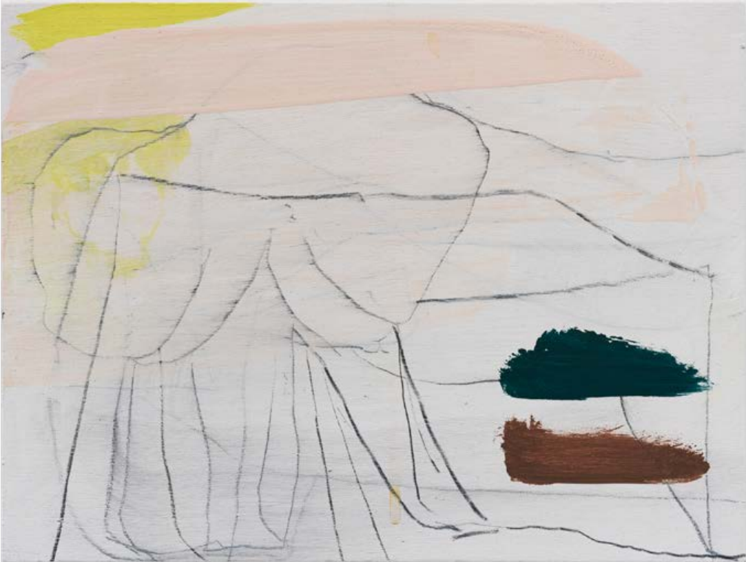
Pair Island, 2023 Acrylic on board 23 × 30 cm (25.2 × 33.7 cm framed)