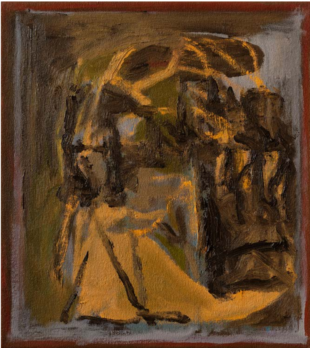
Untitled, 2023 Oil on canvas 40.5 × 36 cm