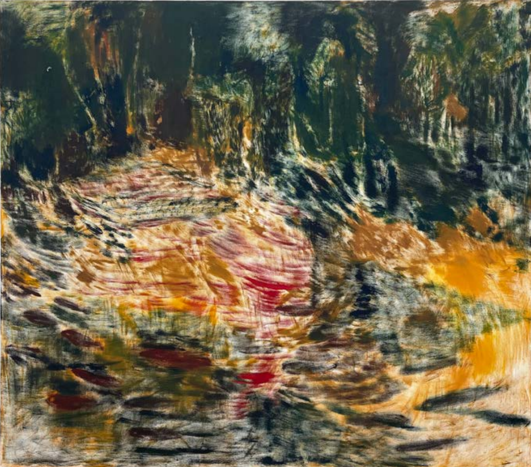
Walking, 2021 Oil on canvas 160 x 180 cm