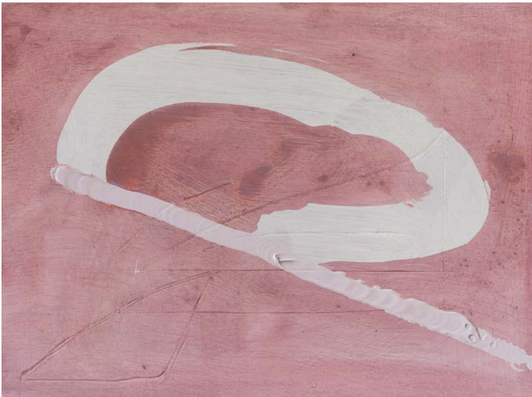
Wand in Pink, 2023 Acrylic on board 23 × 30 cm (25.2 × 33.7 cm framed)