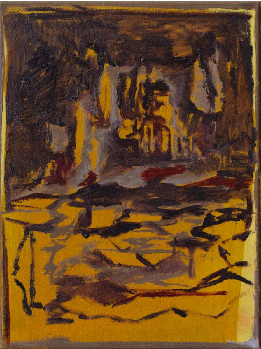
say the least among the few , 2021