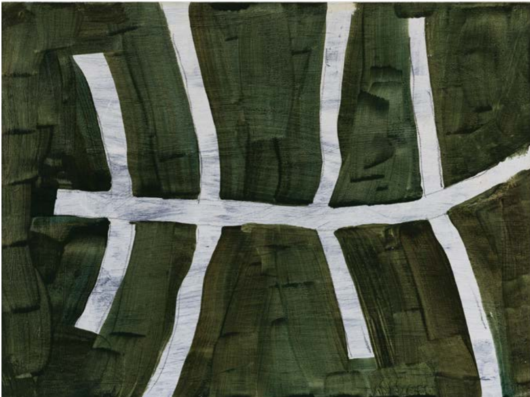
Bone Charm , 2023 Acrylic on board 23 × 30 cm (25.2 × 33.7 cm framed)