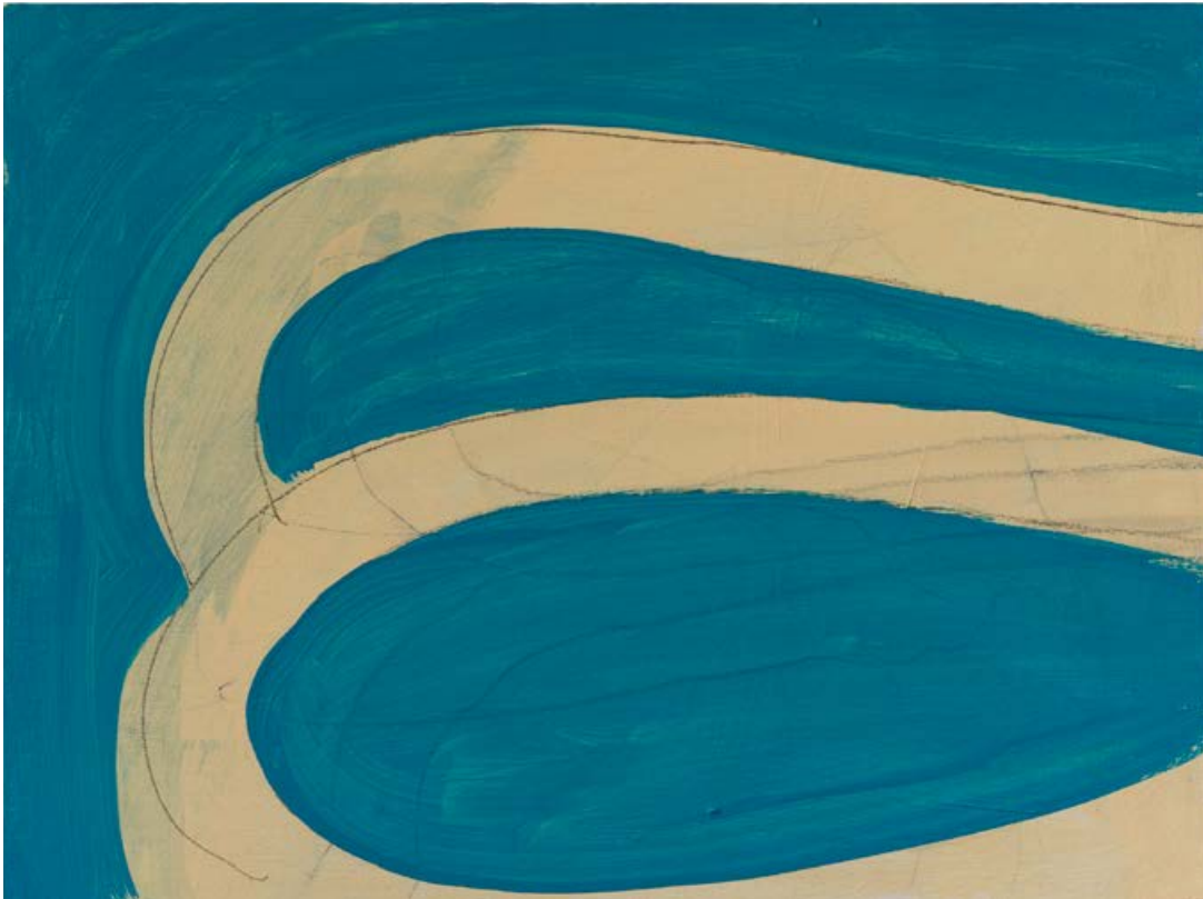
Satisfied , 2023 Acrylic on board and graphite 23 × 30 cm (25.2 × 33.7 cm framed)