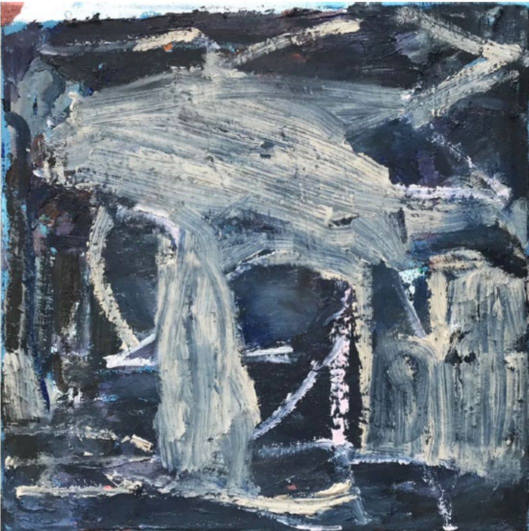
Night Garden (Gate) , 2019 Oil on canvas 46 × 46 cm