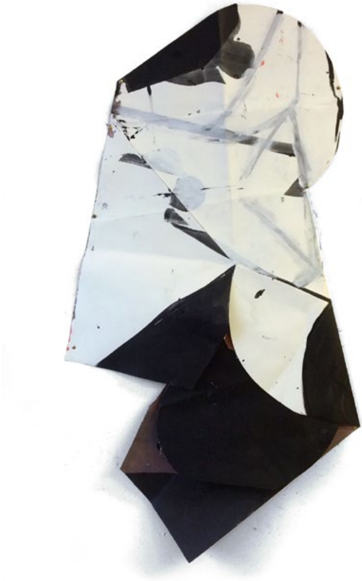
Folded Drawing 1, 2019 Acrylic and ink on paper 160 × 90 cm