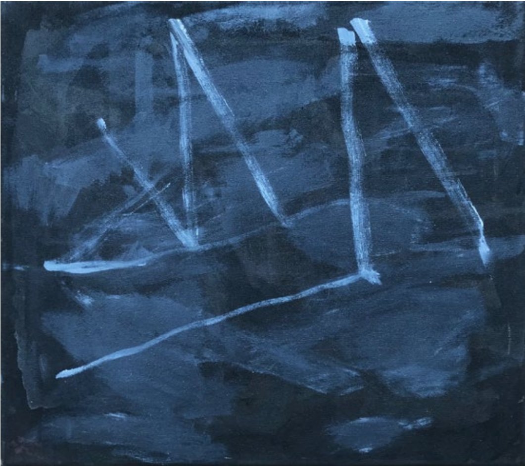
Night Garden (Submerged) , 2019 Acrylic on canvas 40.9 × 46.2 cm