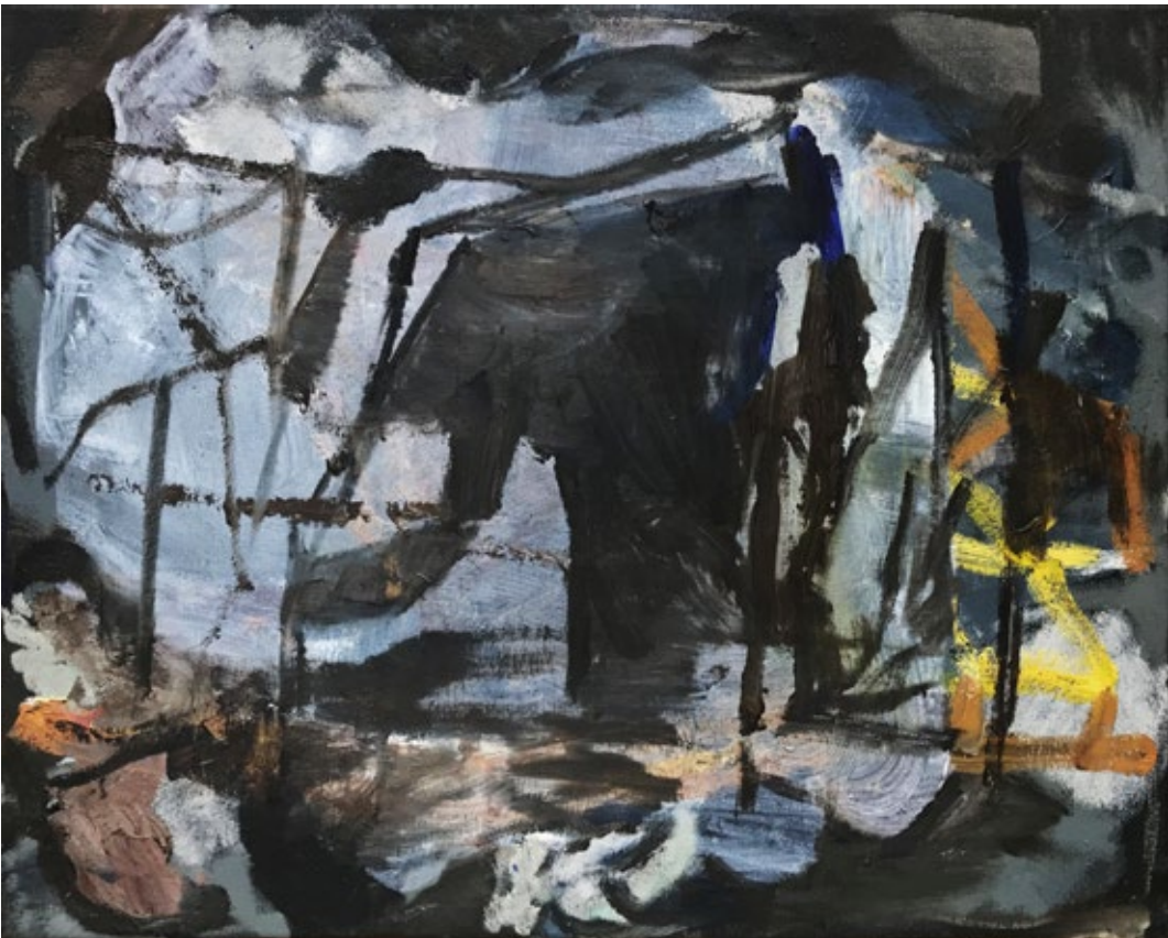
Night Garden (Angel) , 2019 Oil on canvas 41 × 51.2 cm