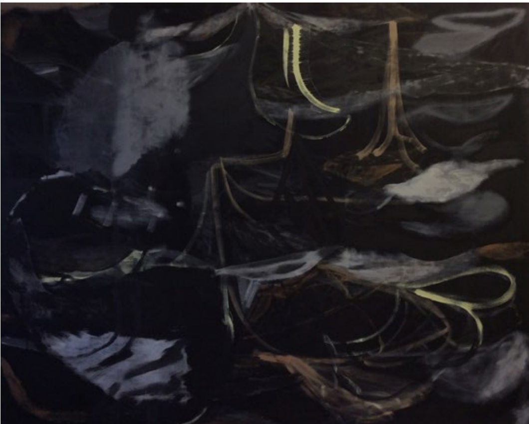
Night Garden (Birds) , 2018 Oil on canvas 210 × 170 cm