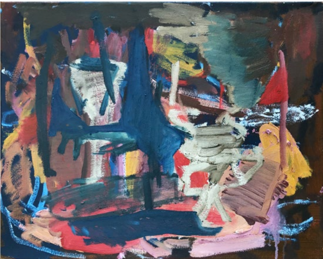
3 Scoops, 2019 Oil on canvas 41 x 51 cm