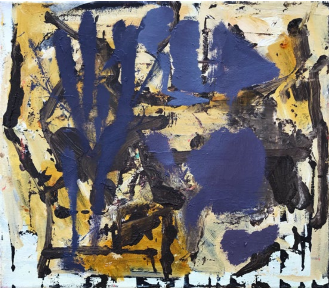
Night Garden (Lavender) , 2018 Oil on canvas 35 × 40 cm