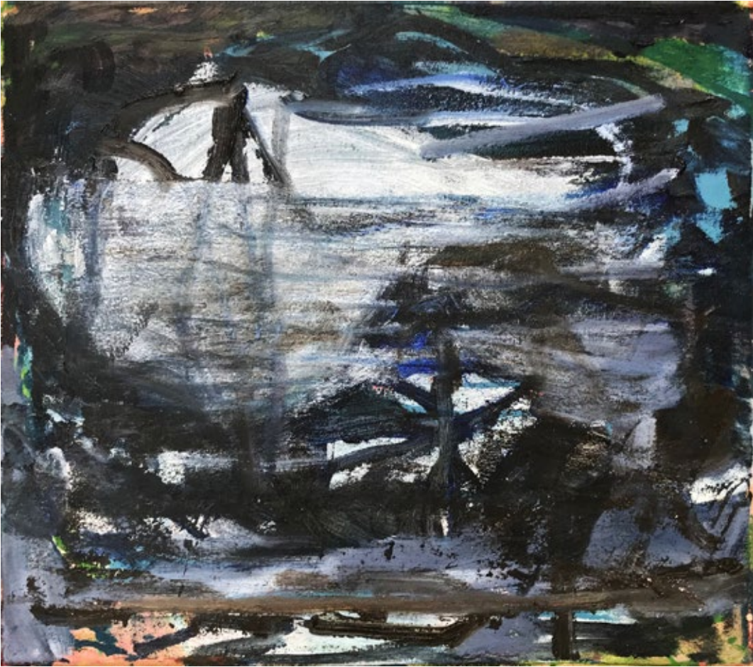
Night Garden (Two Worlds) , 2019 Oil on canvas 41 × 45.7 cm