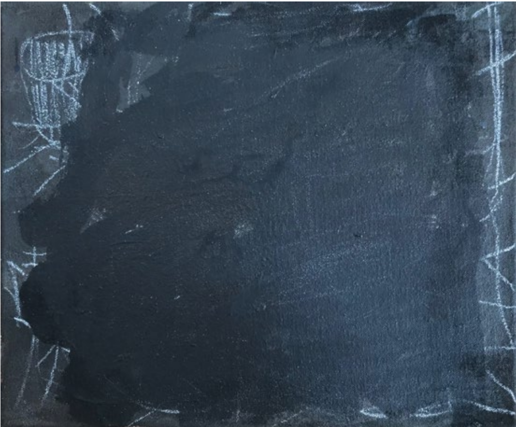
Night Garden (Ground) , 2019 Acrylic over ink and chinagraph pencil on canvas 25.5 × 30.6 cm