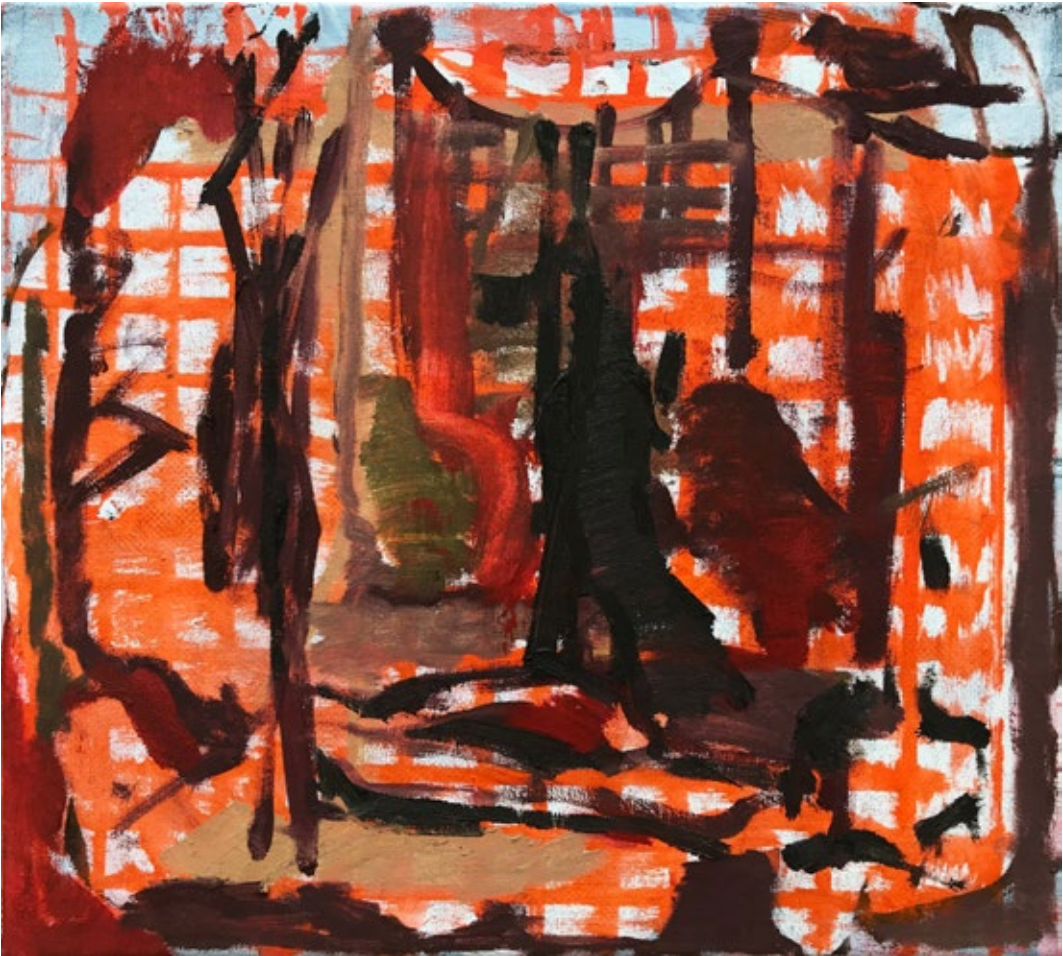
Lion Tamer, 2018 Oil on canvas 46.2 × 51 cm