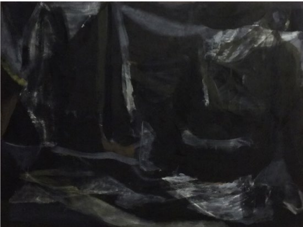
Night Garden , 2018 Oil on canvas 132 x 100 cm