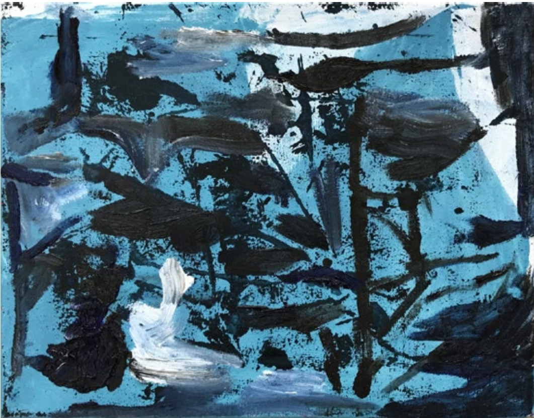
Night Garden (Early Hours) , 2019 Oil on canvas 35.9 × 46 cm