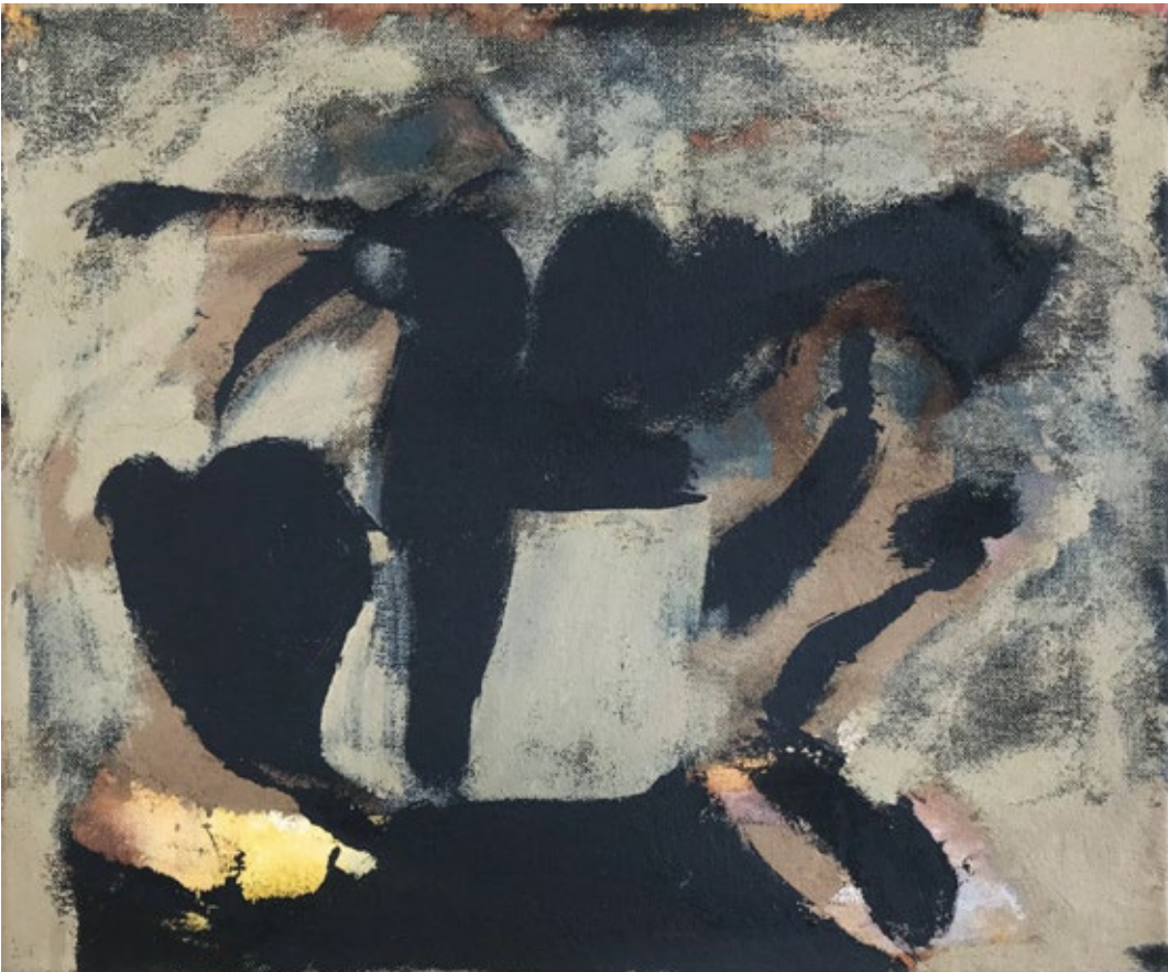
Life Amongst the Chimney Pots , 2018