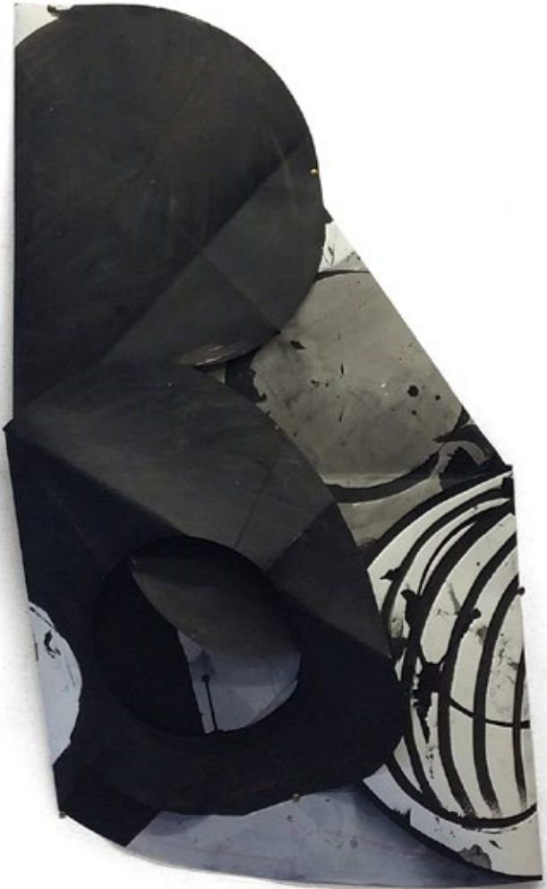
Folded Drawing 2, 2019 Ink on paper 130 x 79 cm