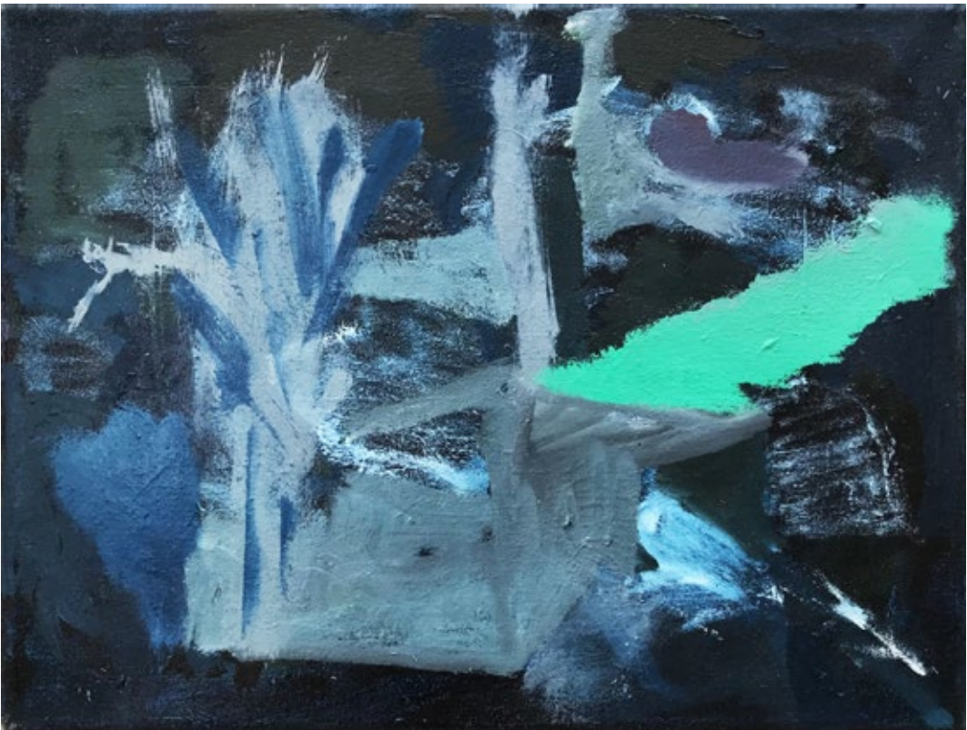
Night Garden, 2019 Oil on canvas 31 x 40.9 cm