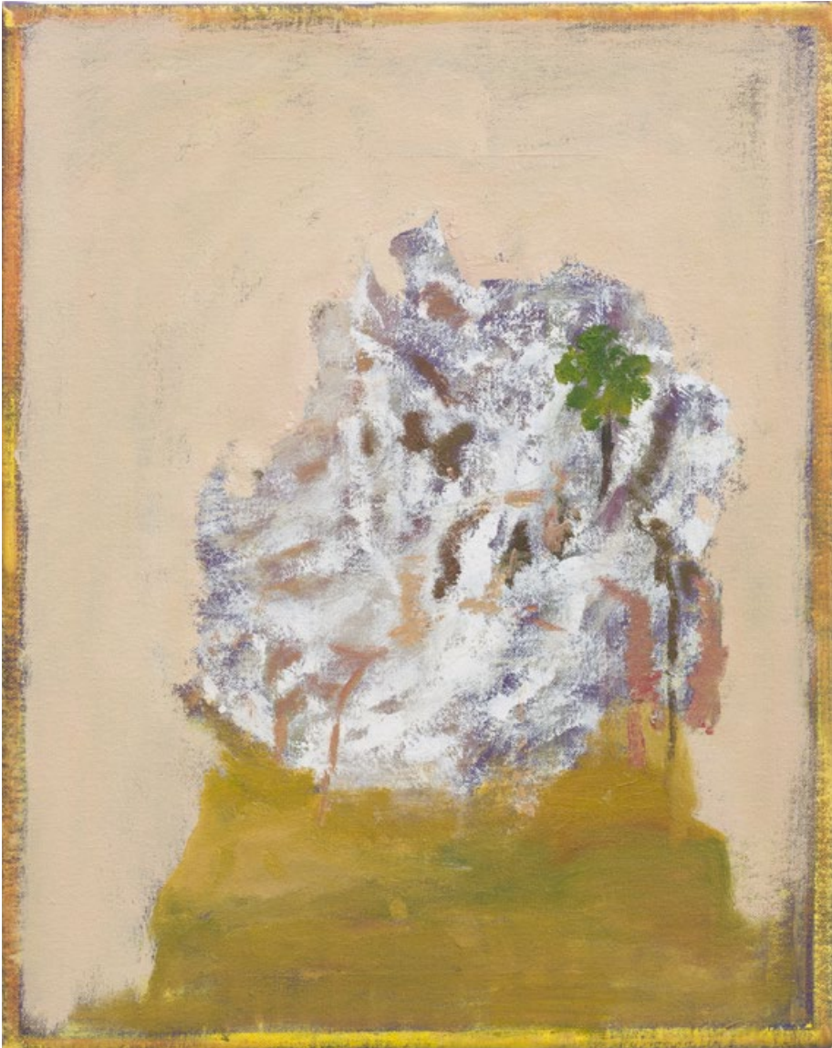
HOME, Learning, 2021