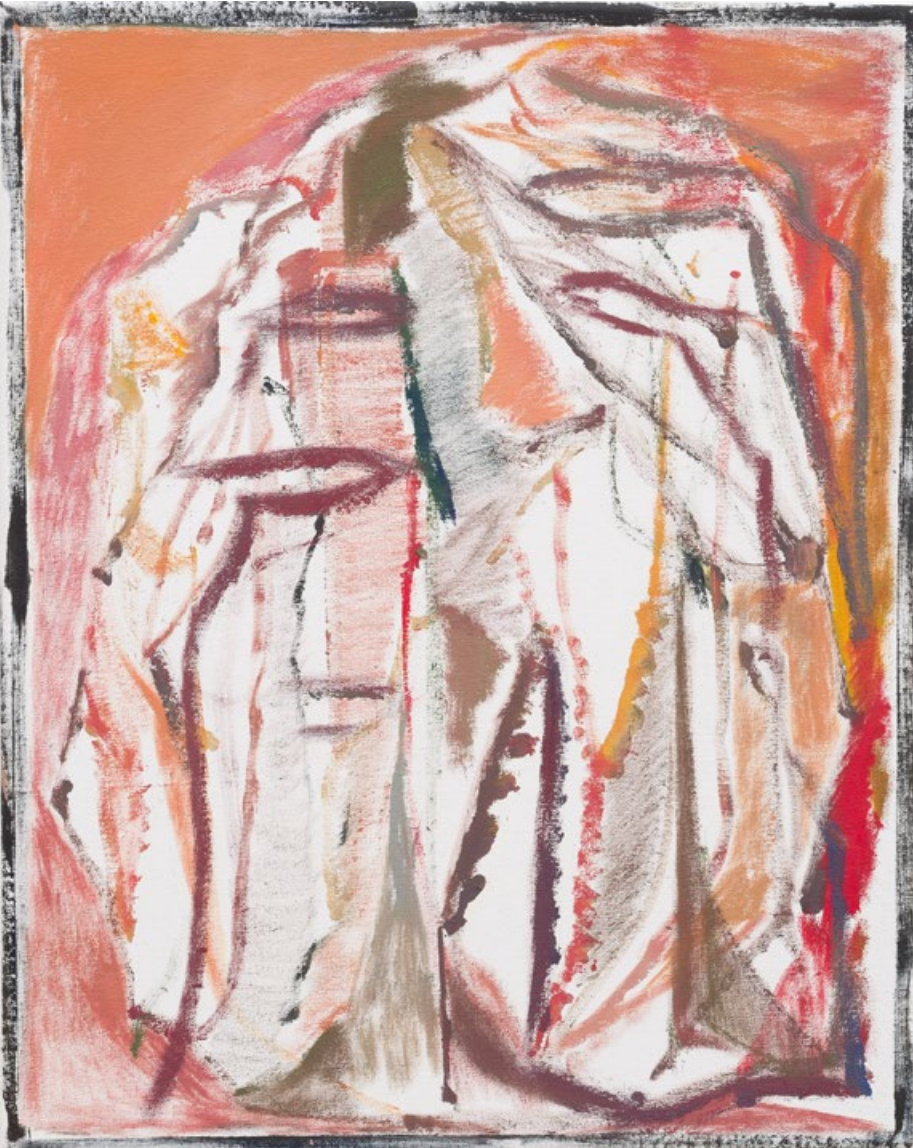
1st Mountain, 2020