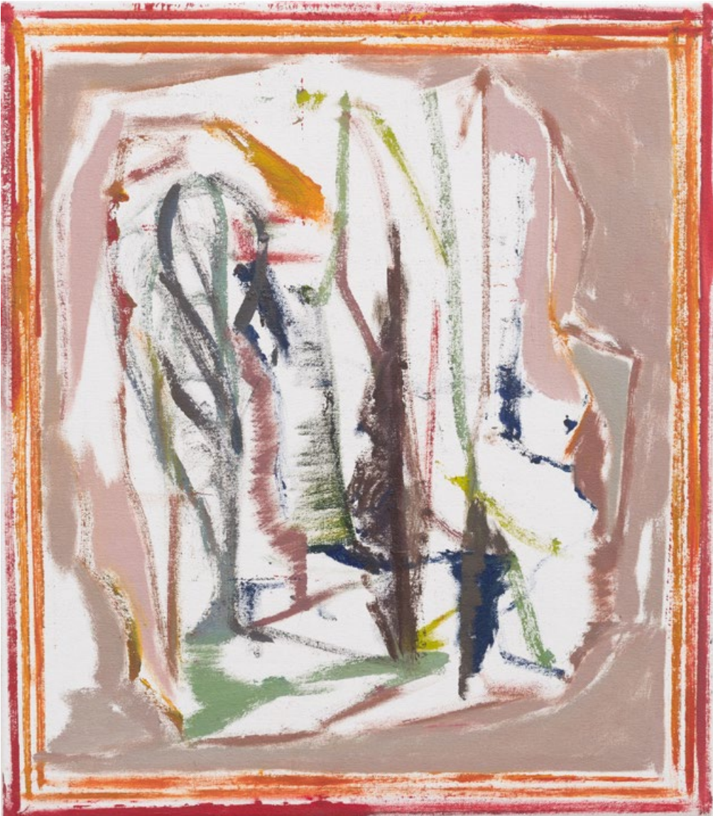
Folded Hill, 2020