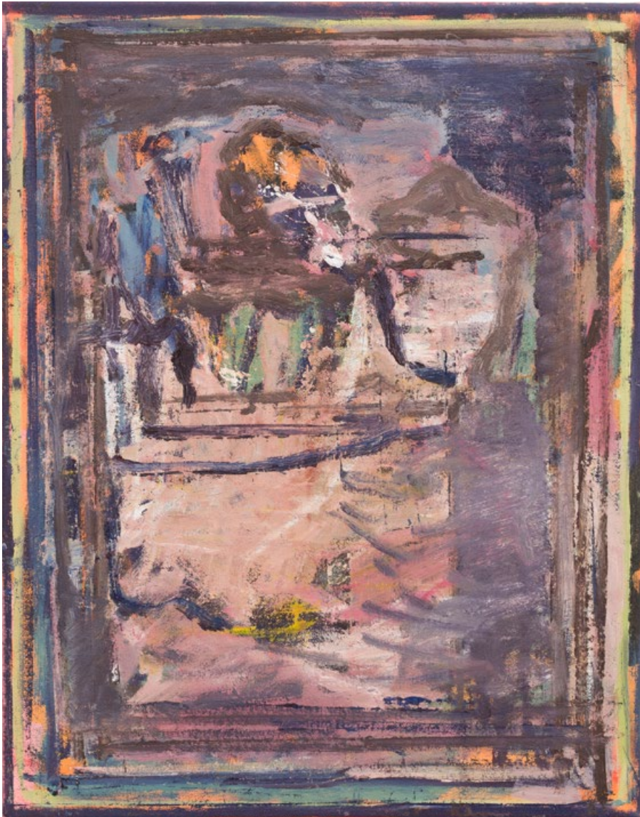
Night Garden, 2020