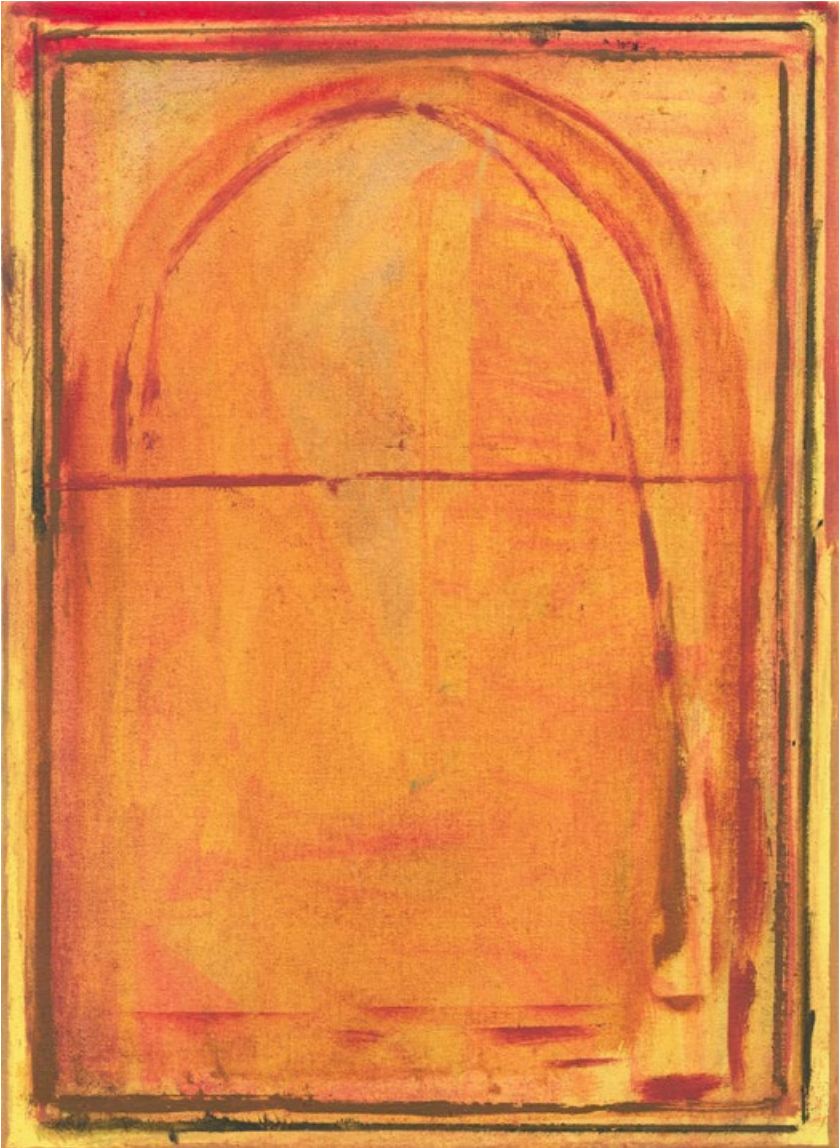
Set, 2020 Oil on canvas 55 × 44.2 cm