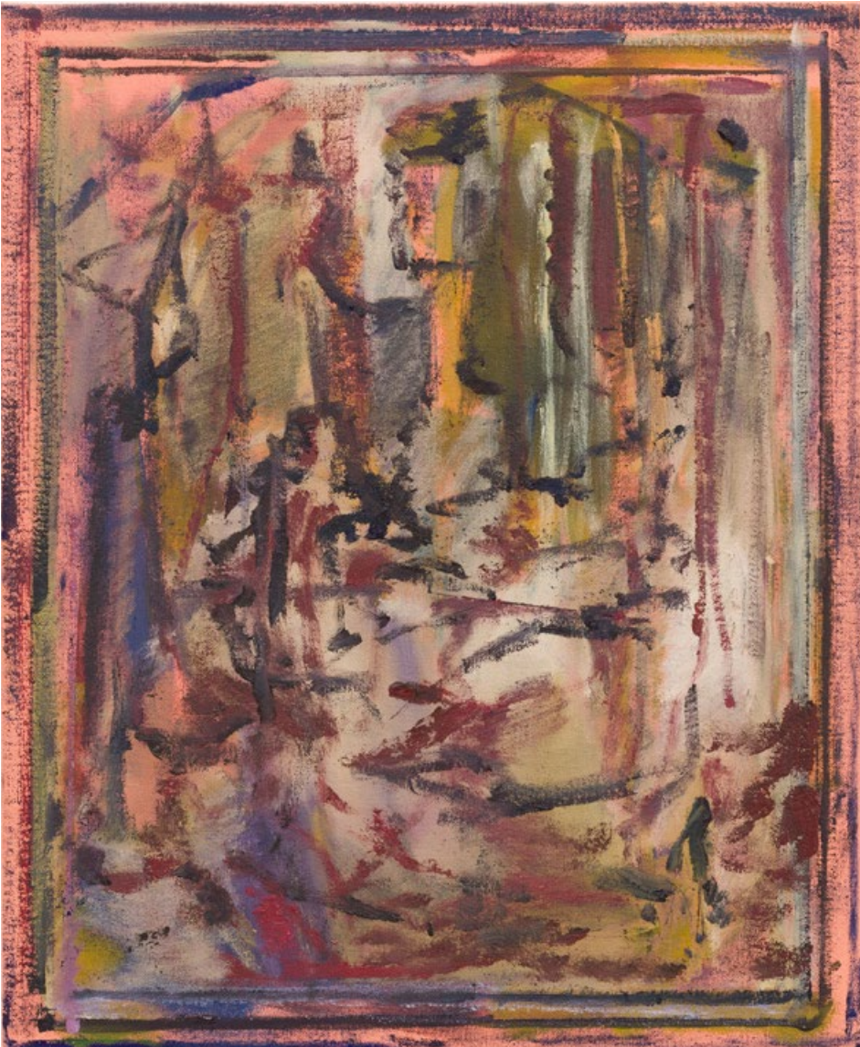
In The Woodland , 2020