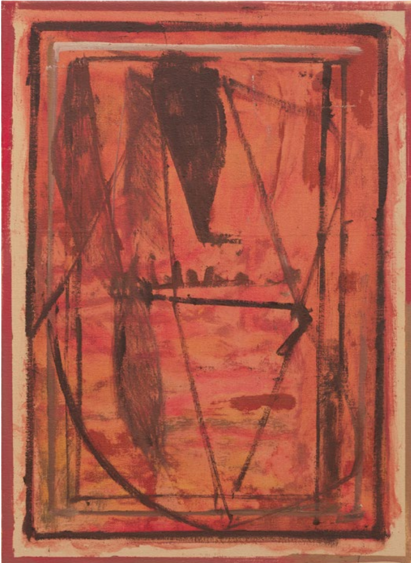
Brancusi Museum, 2020