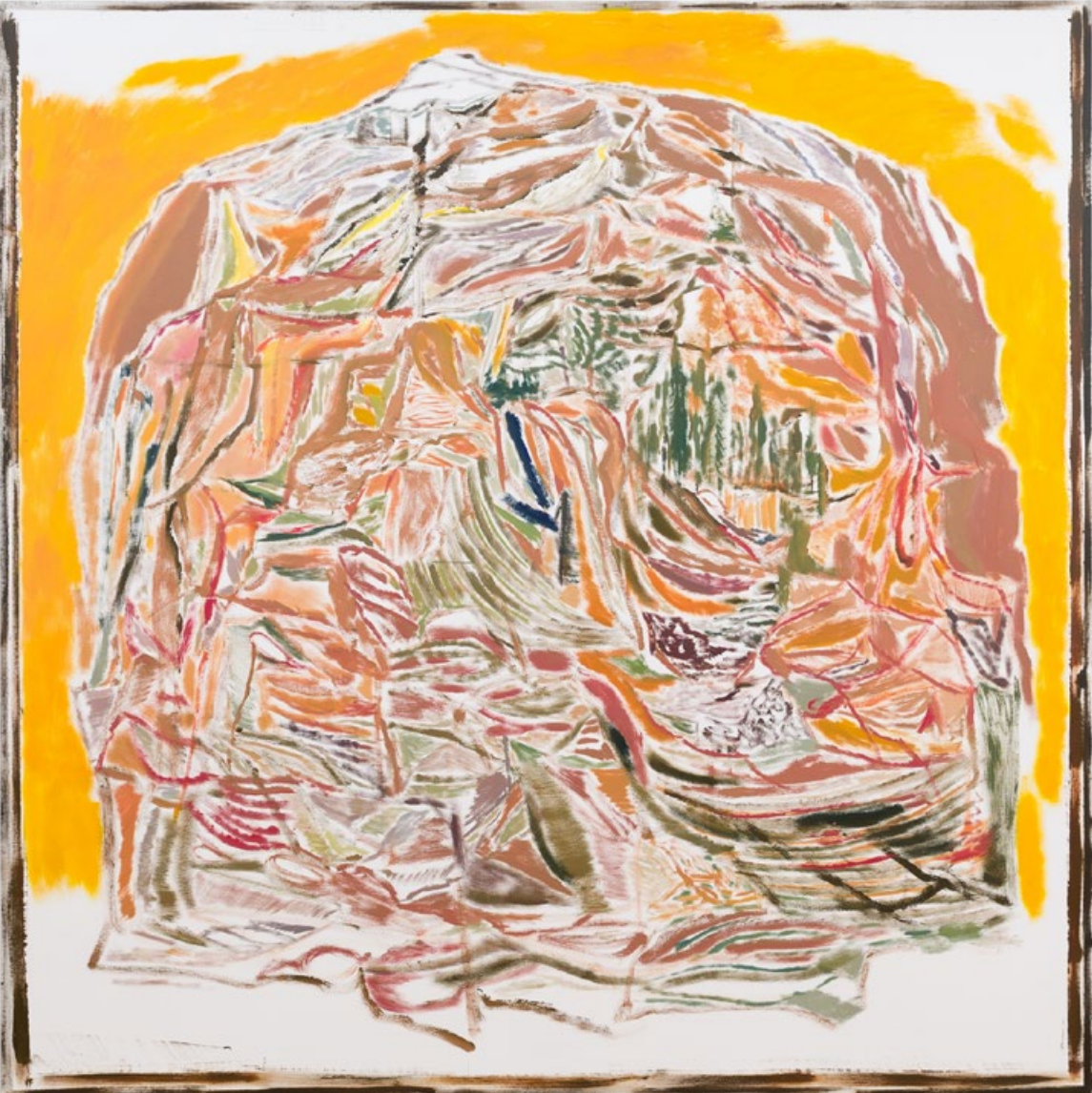
Mountain Yellow , 2021