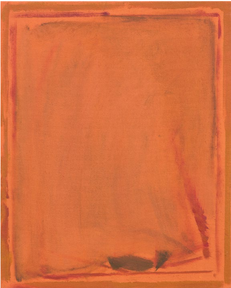
Orange dancing shoes, 2020