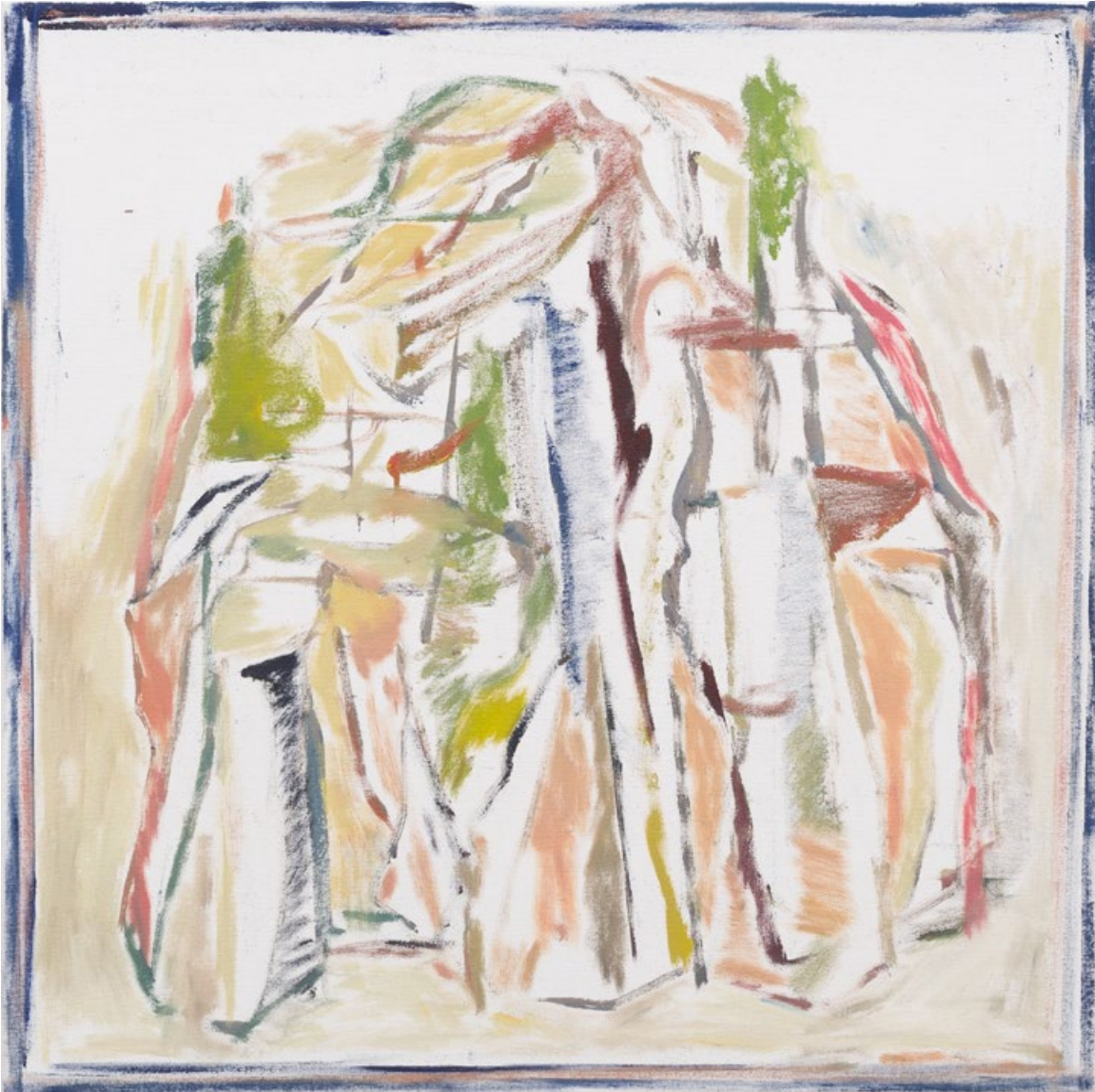
Mountain Garden, 2020