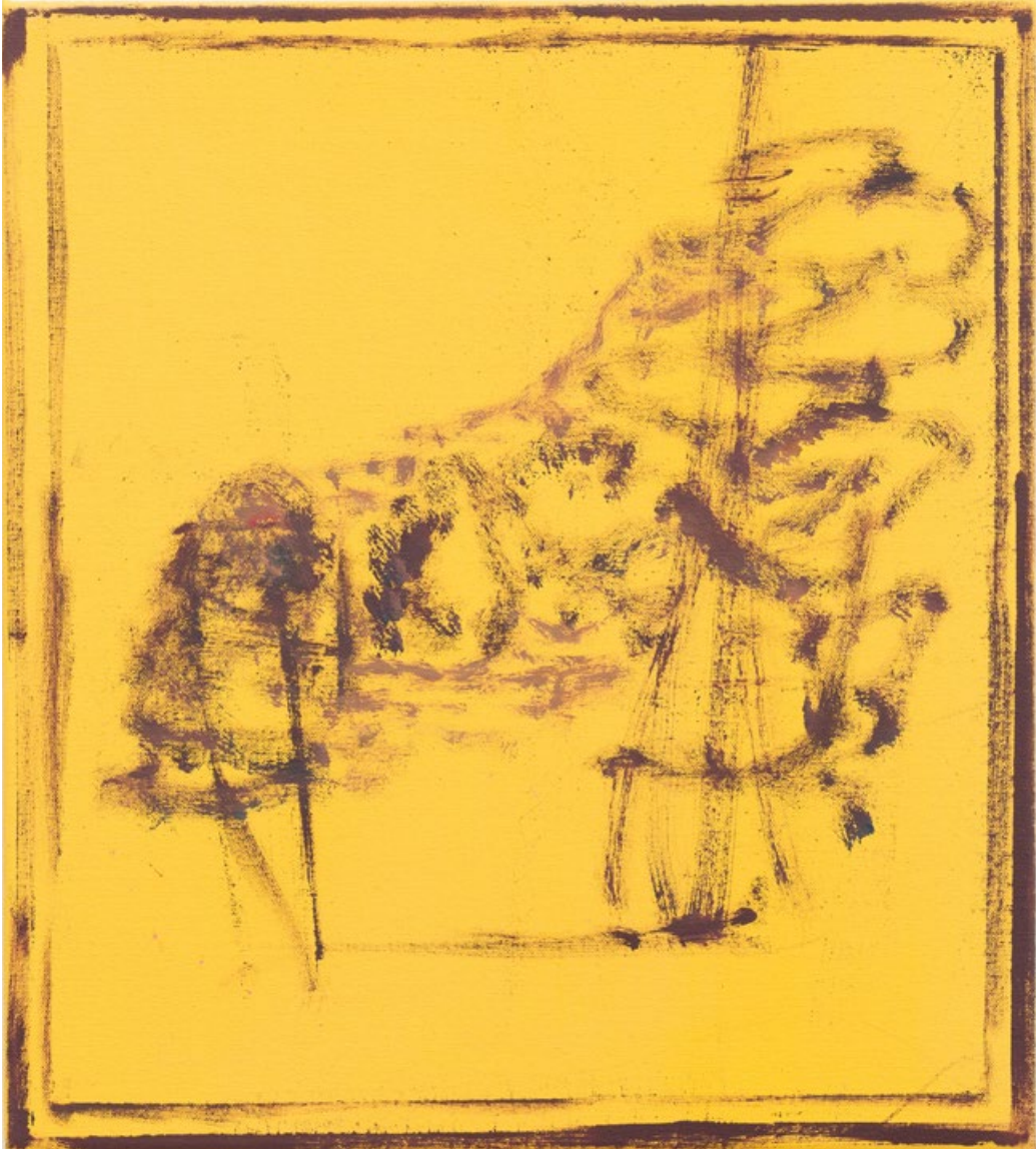
Night Garden , 2020