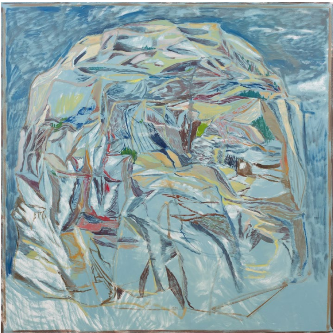
Mountain, 2021 Oil on canvas 220 × 220 cm