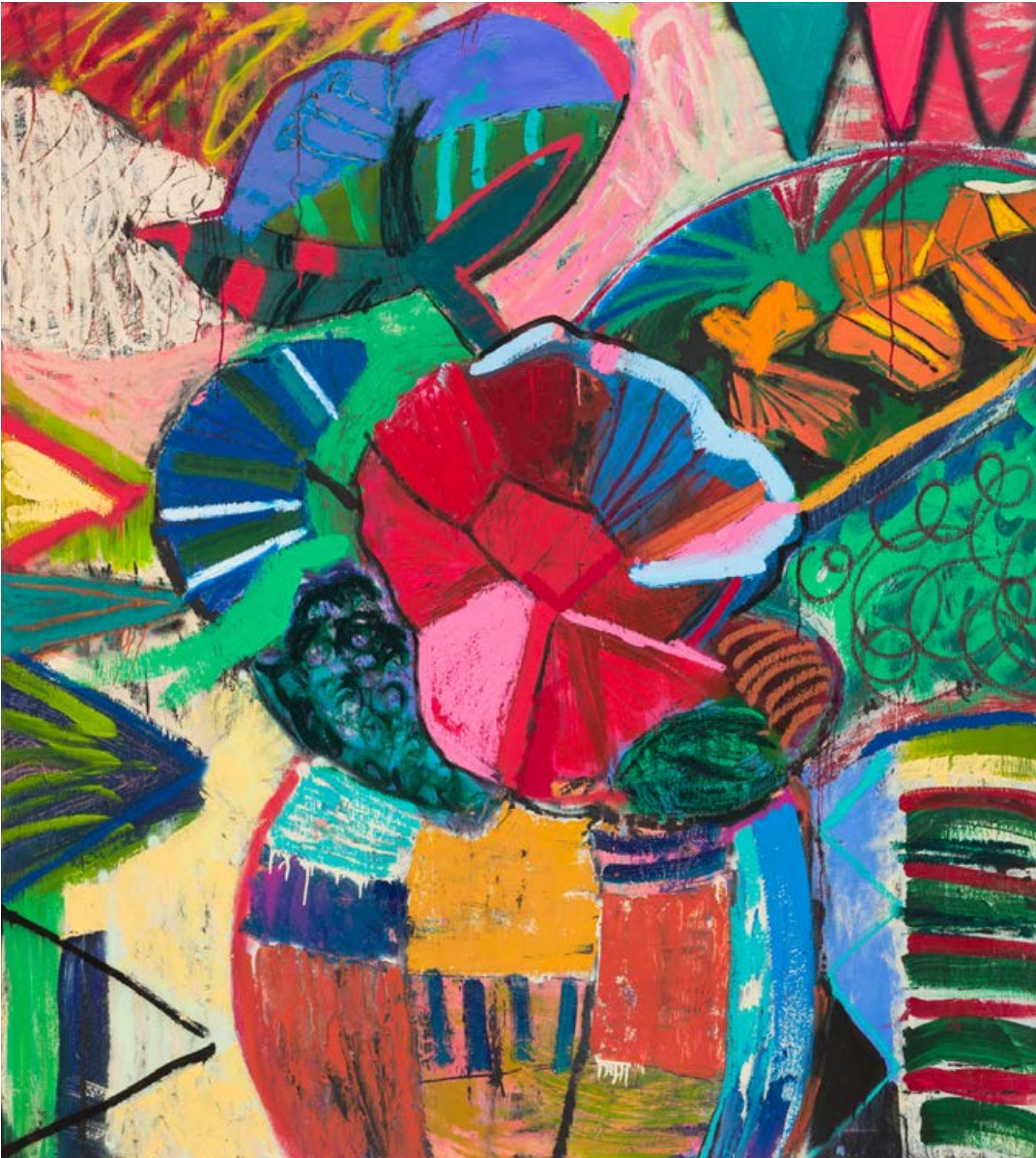
Rose Electra Harris Just like honey , 2022 Acrylic, spray paint, charcoal, oil stick and pigment stick on canvas 200 × 180 cm