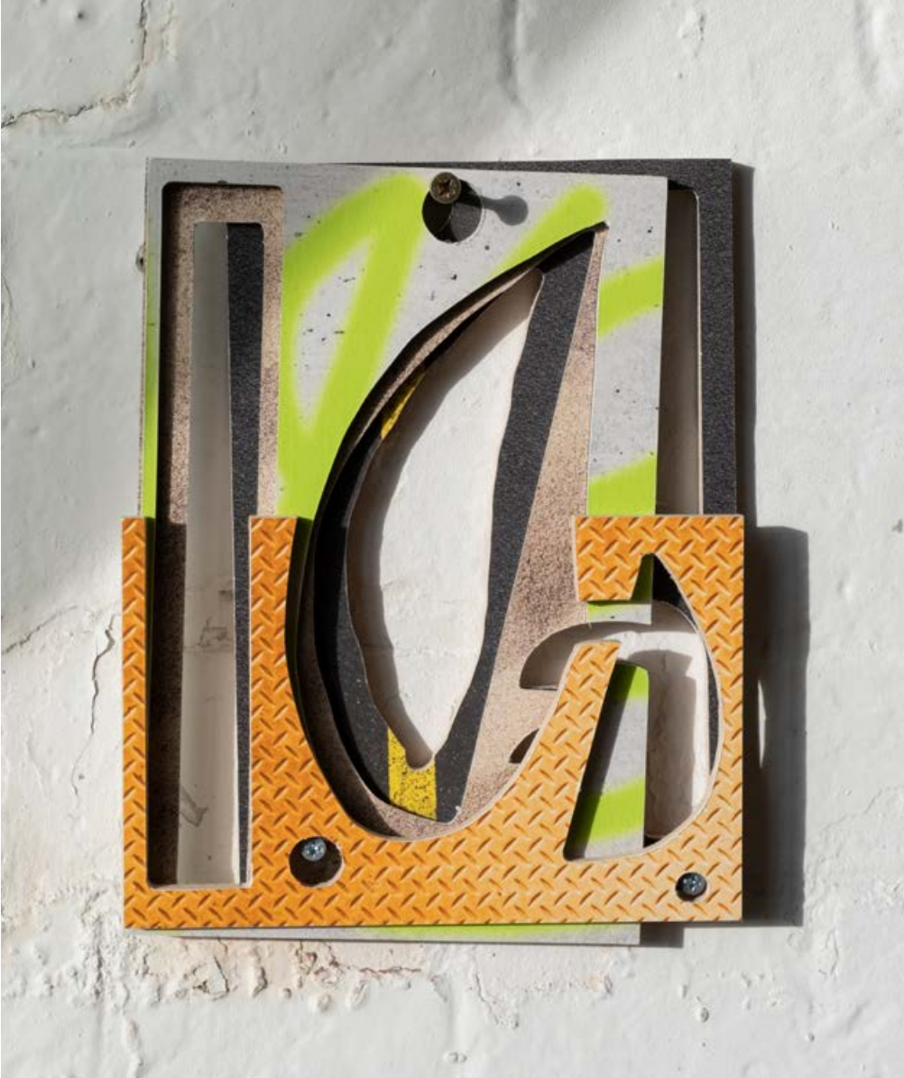
Ibrahim Azab ATIS-MI2A.ZIP , 2021 Glicee print, wood, Aluminium 20 × 25 cm Edition of 5 + 1AP