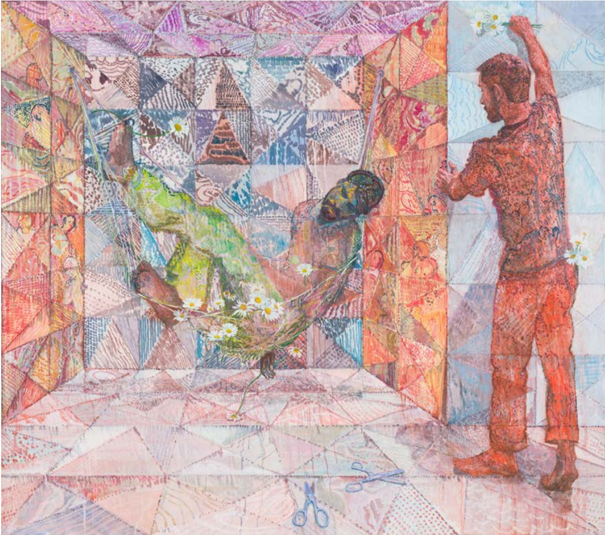
Joshua Raz Caught Napping/Picking up Daisies, 2019 Oil on canvas 180 × 160 cm