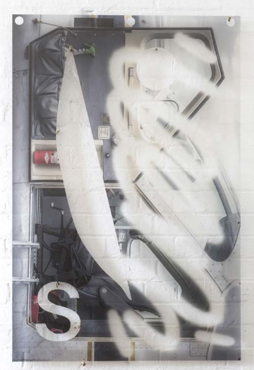
Ibrahim Azab FL1GHT_02 , 2022 Direct UV Media Print (Acrylic) 120 × 80 cm Edition of 5 + 1AP (Shown as part of the FL1GHT installation in the exhibition)