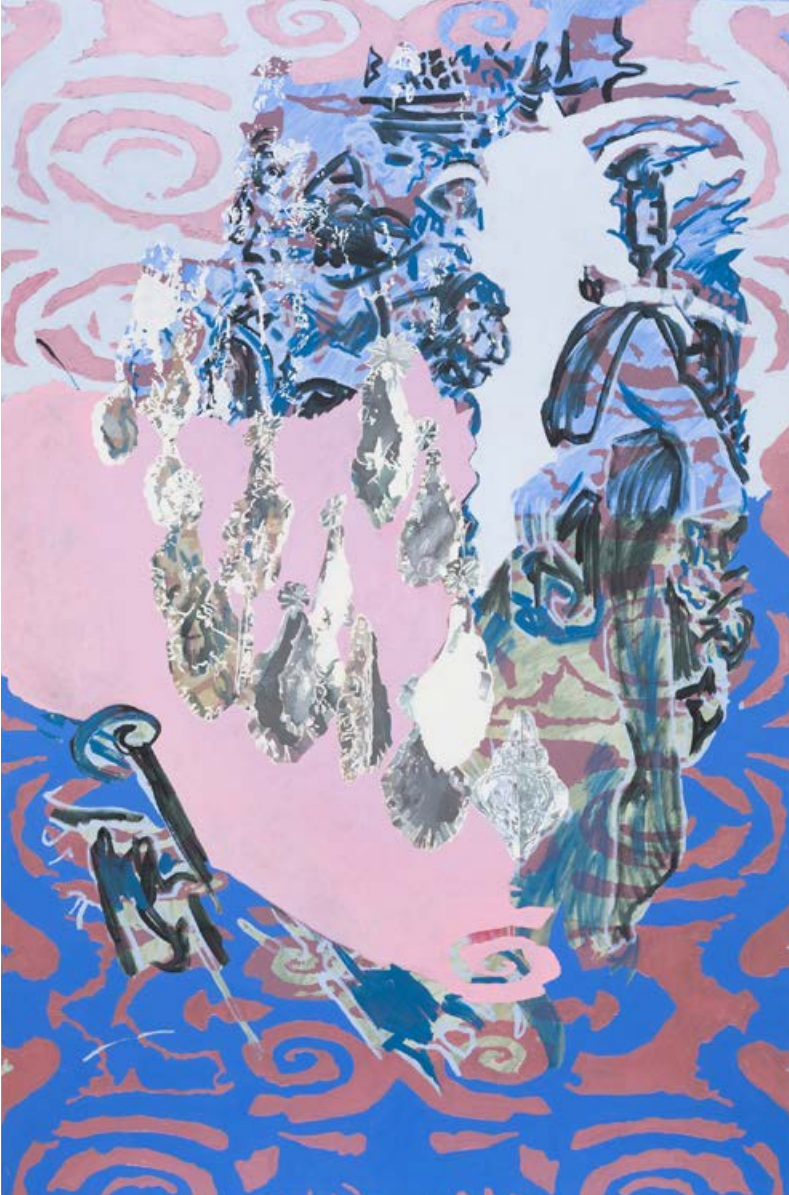
Tommy Camerno Curlicue Dandy 04 , 2022 Oil and acrylic on canvas 250 × 165 cm