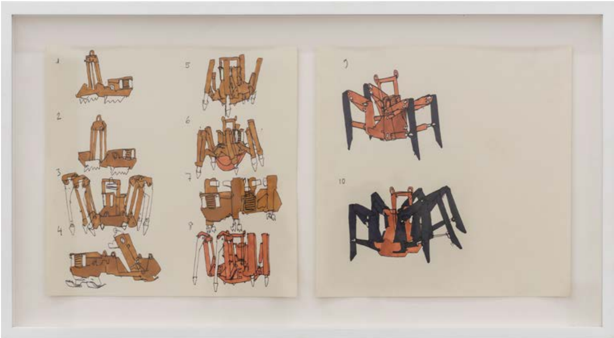
James Capper 8 PROTOTYPES & 9 - 10 PROTOTYPES, 2015 Ink on paper Each drawing 28 × 28 cm, Frame: 39.7 × 72.5 cm (for both works in single frame)