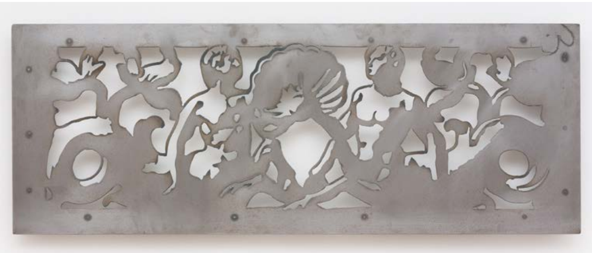
Tommy Camerno Schlossbrücke 02 , 2022 Mild steel 92 × 34 cm