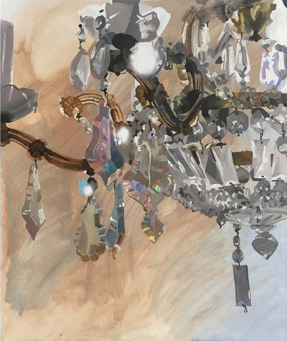
Tommy Camerno Cristal 06 , 2022 Acrylic on canvas 67 × 59.5 cm