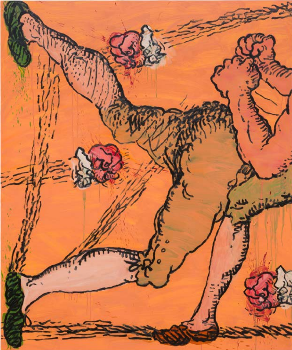
Charlie Billingham Cocktail is a hit (5) , 2021 Oil on linen 180 × 150 cm