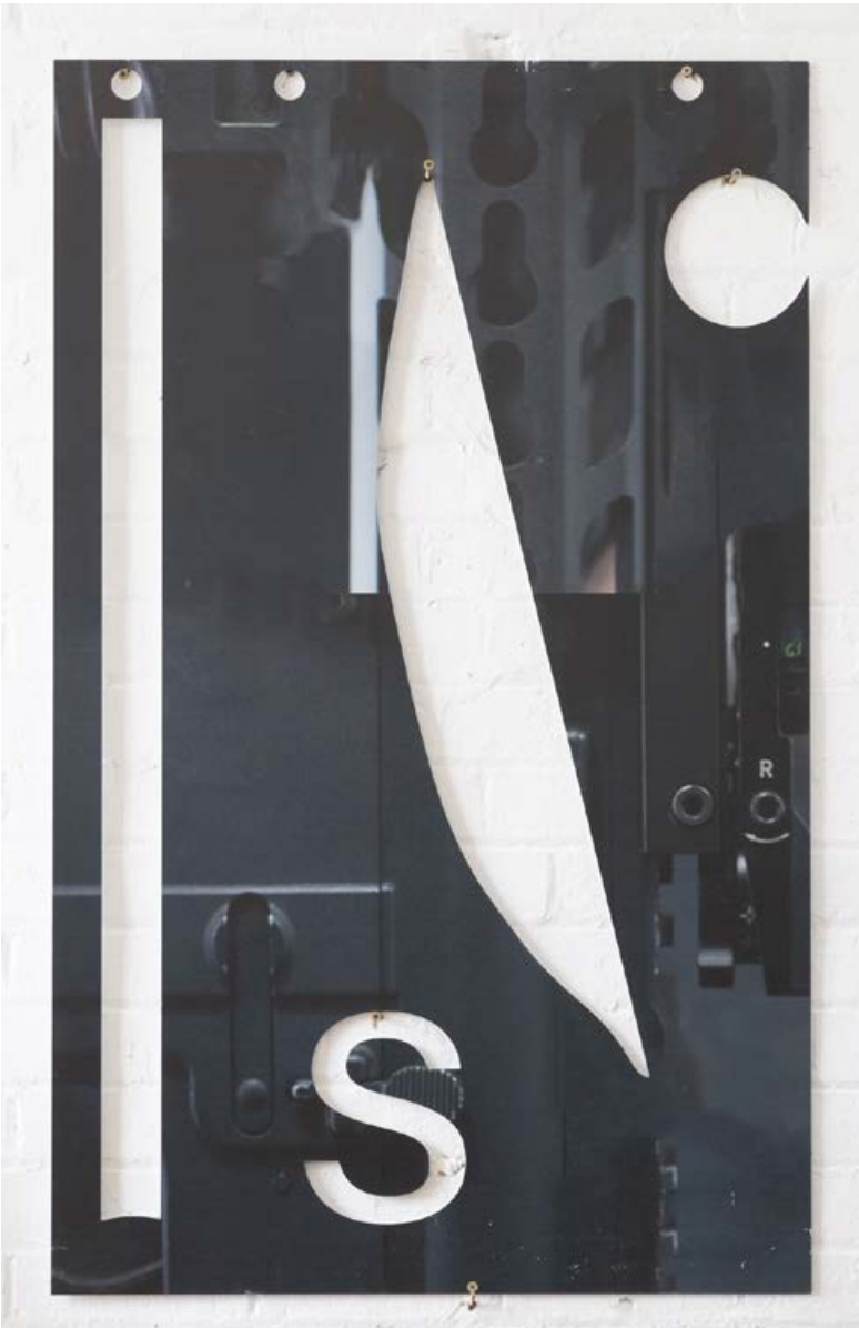
Ibrahim Azab FL1GHT_01 , 2022 Direct UV Media Print (diabond) 120 × 70 cm Edition of 5 + 1AP (Shown as part of the FL1GHT installation in the exhibition)