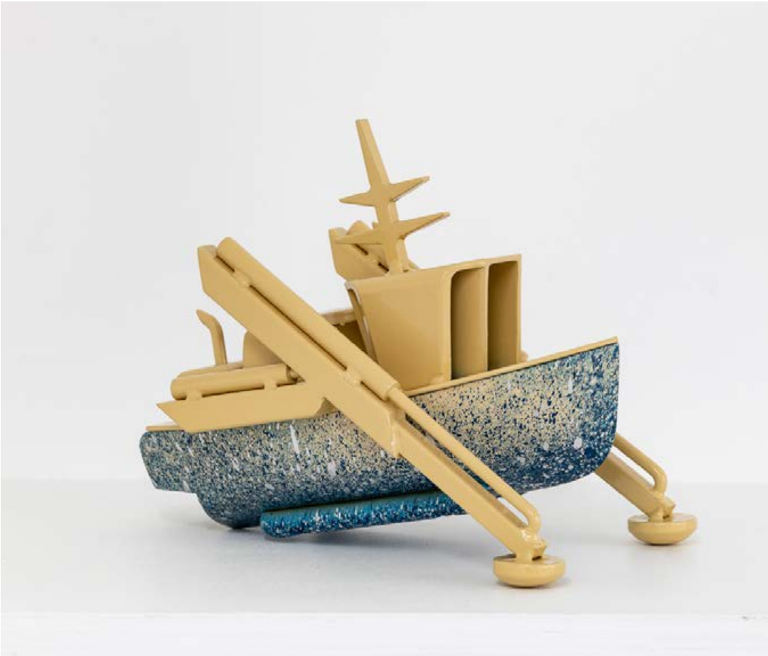
James Capper MUDSKIPPER (maquette), 2019 Powder coated steel, hand sprayed wood 15 × 19 × 10 cm