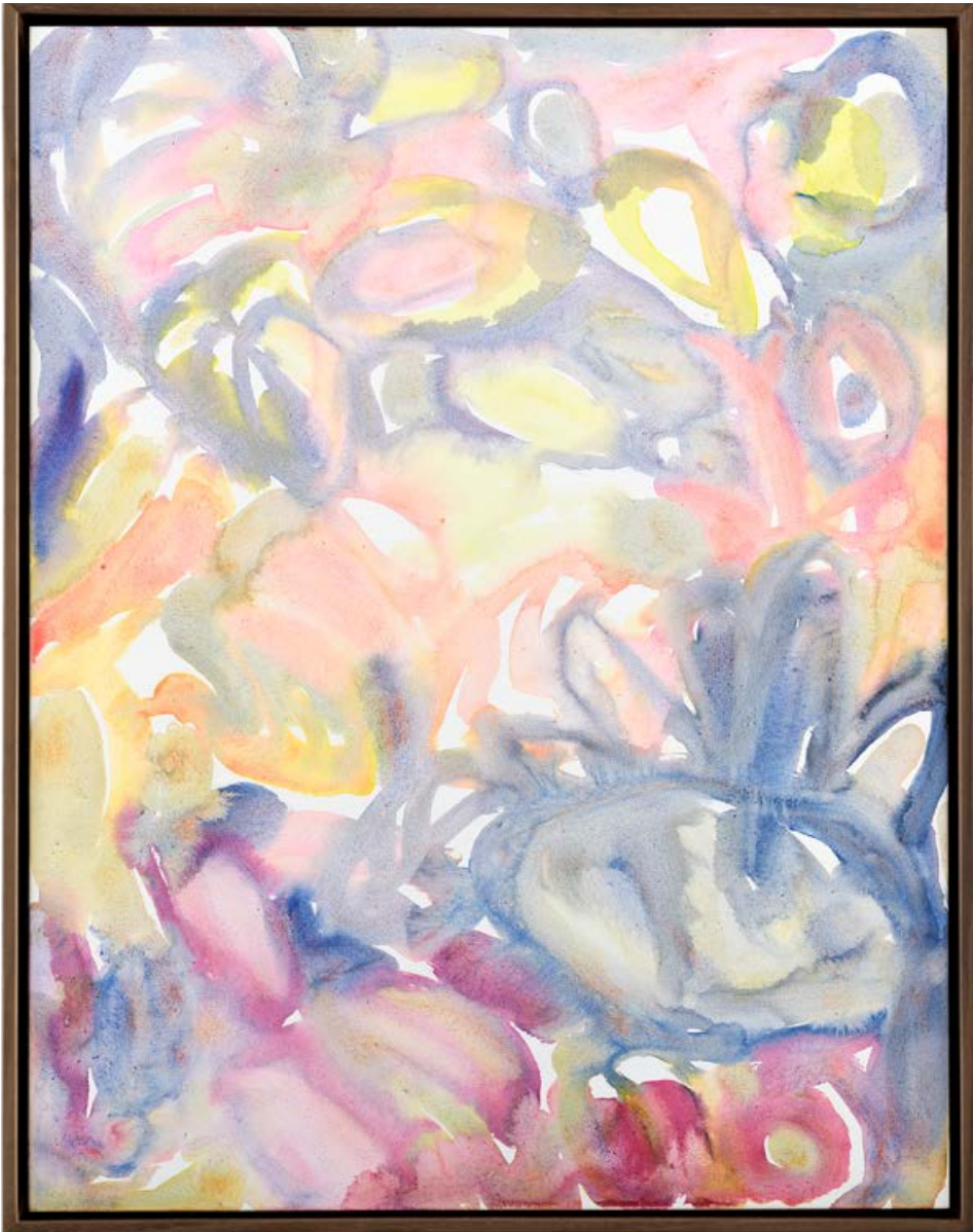
Tamsin Relly The Frogs Pond , 2021 Water-mixable oil on gesso and aluminium panel, framed in natural wax walnut tray frame 45 x 35 cm