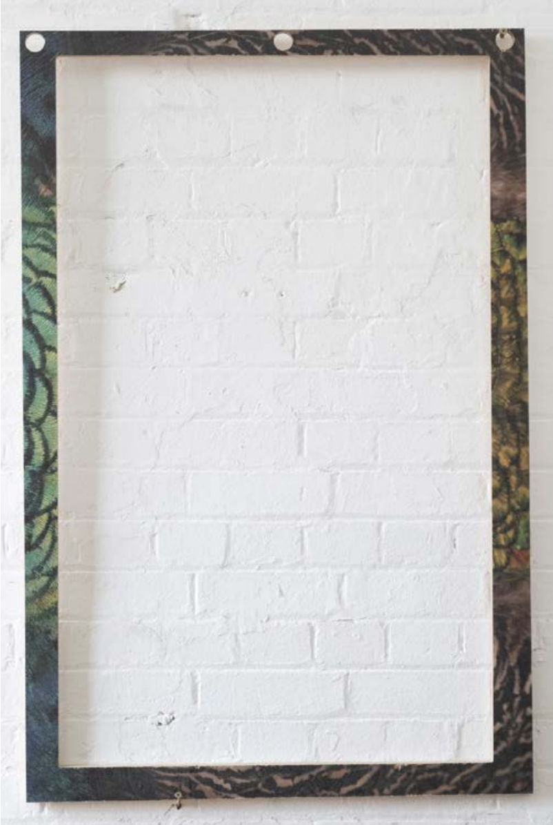
Ibrahim Azab FL1GHT_03 , 2022 Direct UV Media Print (Birch) 120 × 65 cm Edition of 5 + 1AP (Shown as part of the FL1GHT installation in the exhibition)