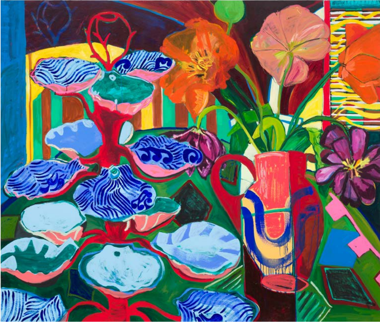
Rose Electra Harris Another Lover , 2022 Acrylic, oil, oil stick and pigment stick on canvas 170 × 200 cm