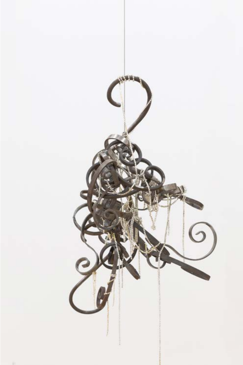
Tommy Camerno Rise Fall Rise 02 , 2022 Mild steel, rhinestones Dimensions Variable