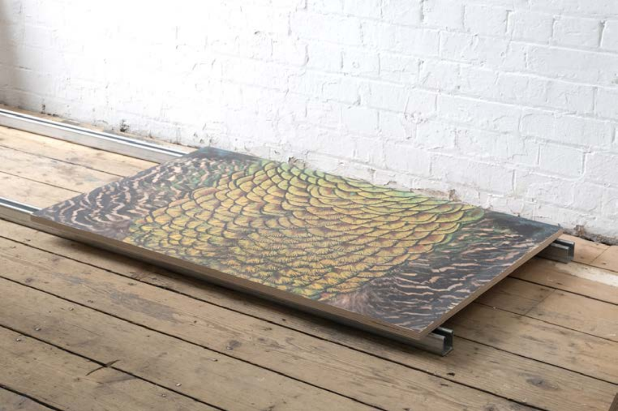
Ibrahim Azab FL1GHT_04 , 2022 Direct UV Media Print (Birch) 100 × 60 cm Edition of 5 + 1AP (Shown as part of the FL1GHT installation in the exhibition)