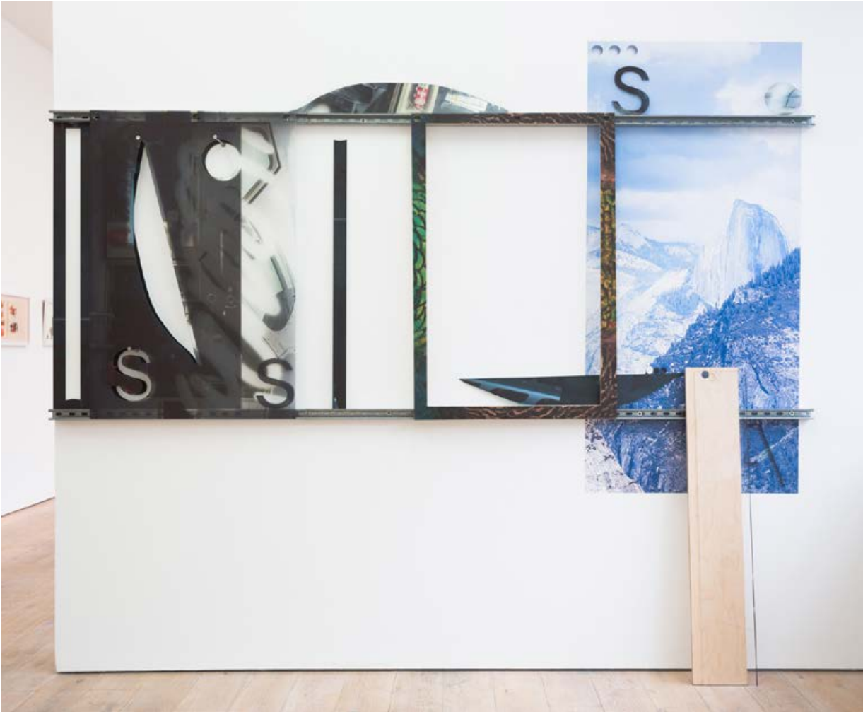
Ibrahim Azab FL1GHT installation , 2022 Mixed media Variable dimensions Edition of 5 + 1AP (complete installation)