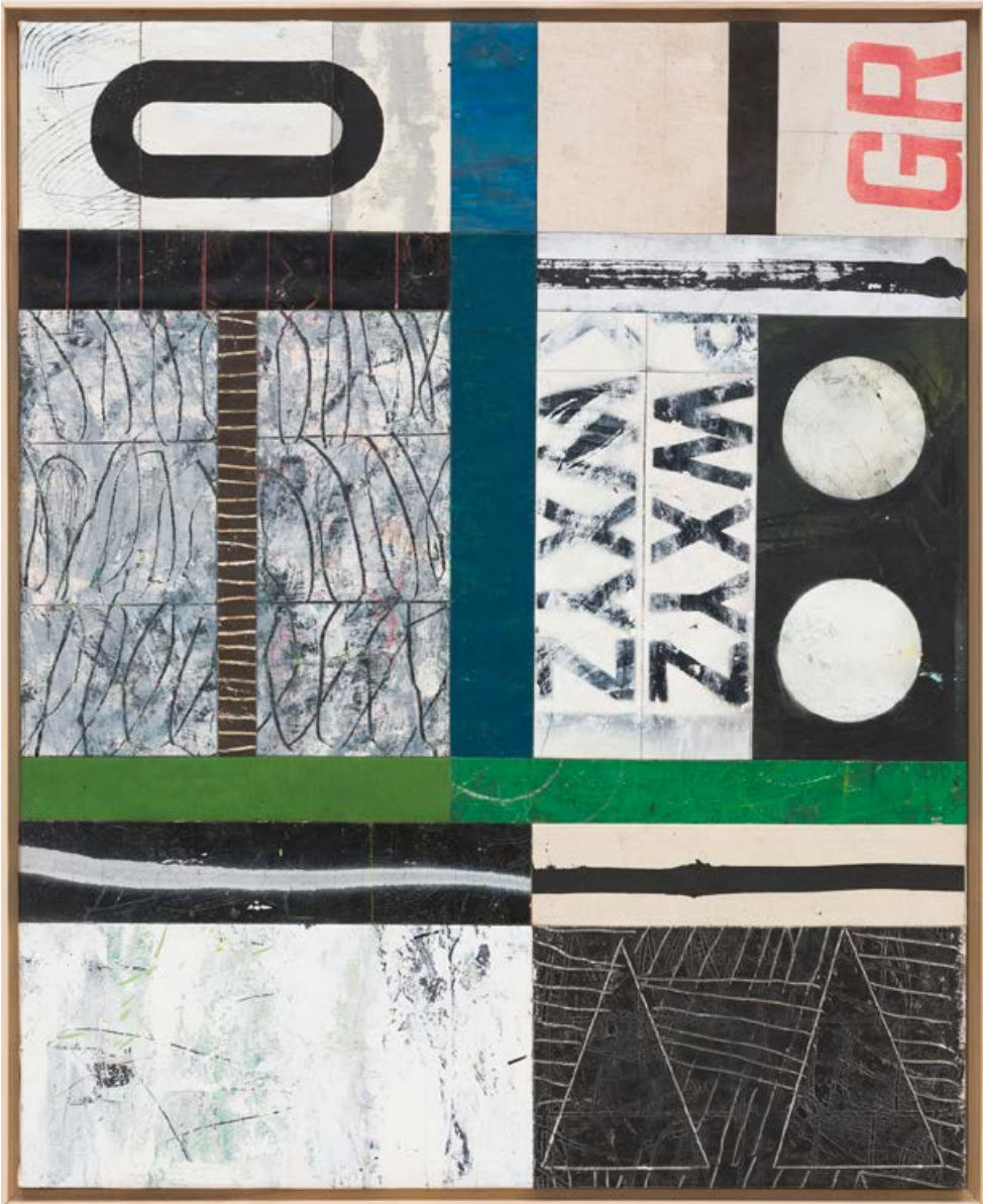
Spiller+Cameron Moirae , 2022 Oil and oil stick on collaged canvas 120 × 100 cm