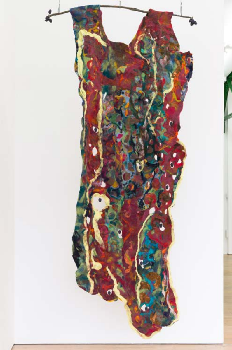
Sophie Goodchild Two Grasshoppers , 2022 Hand felted wool and bronze 240 × 110 cm