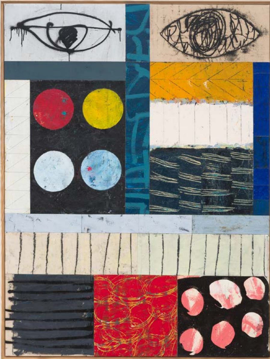
Spiller+Cameron Leto , 2022 Oil and oil stick on collaged canvas 190 × 143 cm