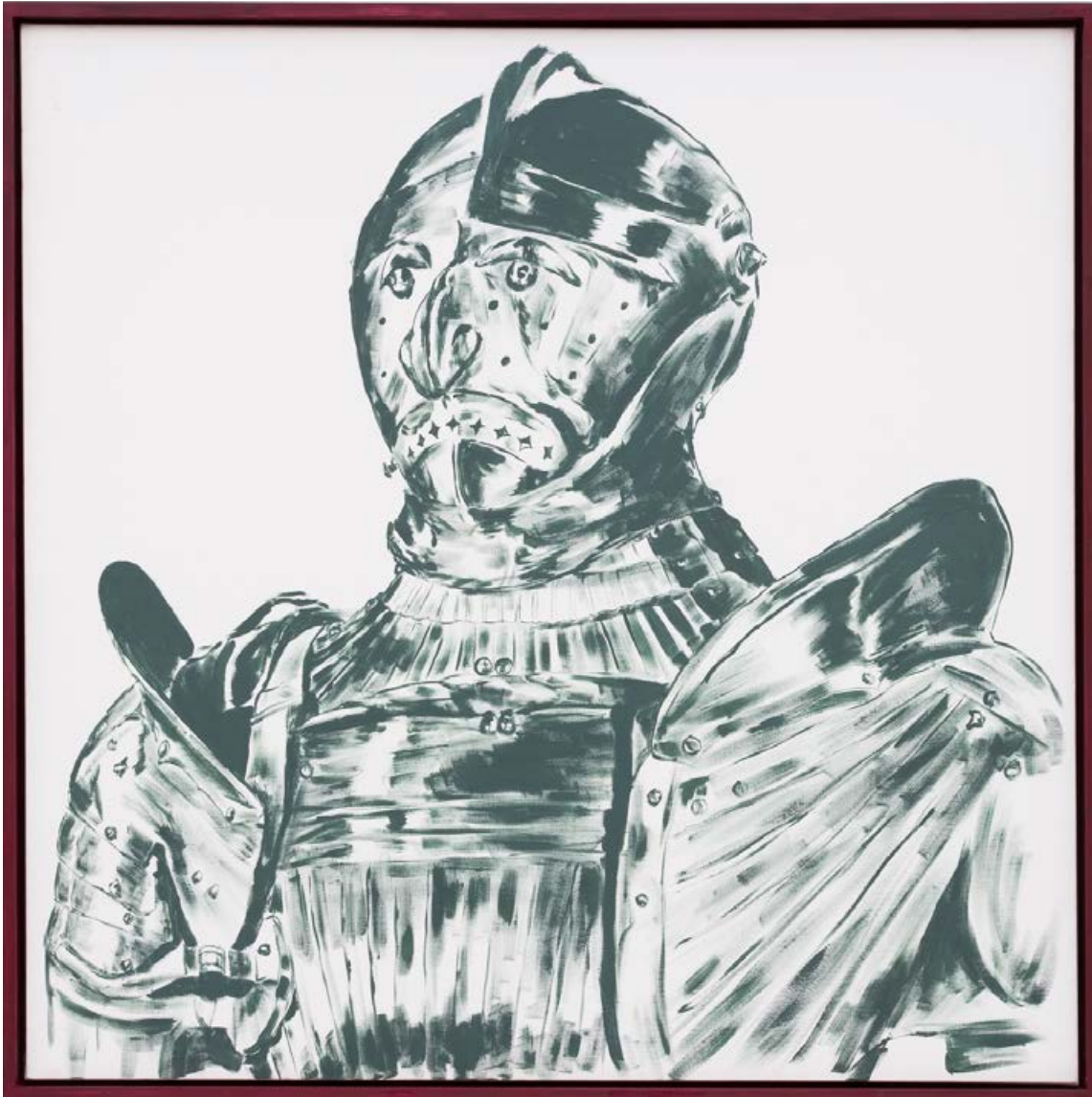
Benjamin Edwin Slinger A Sad Laugh for a Hard Discussion on Why You Are Wrong , 2022 Acrylic on canvas, in artist made pine frame 104 × 104 × 6.7 cm