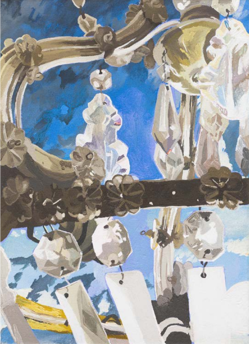
Tommy Camerno Cristal 08, 2022 Acrylic on canvas 35.5 × 26 cm