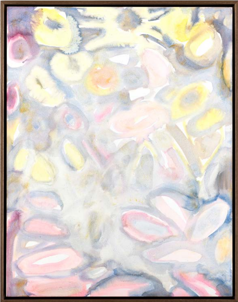
Tamsin Relly Dust in the Sun , 2021 Water-mixable oil on gesso and aluminium panel, framed in natural wax walnut tray frame 45 x 35 cm