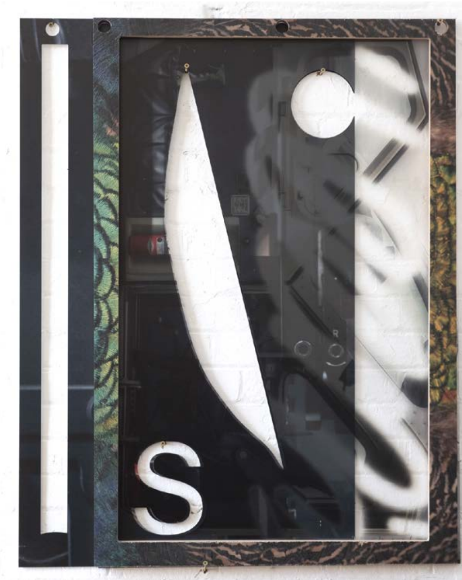
Ibrahim Azab FL1GHT , 2022 Mixed media 120 × 80 cm Edition of 5 + 1AP (Shown as part of the FL1GHT installation in the exhibition)